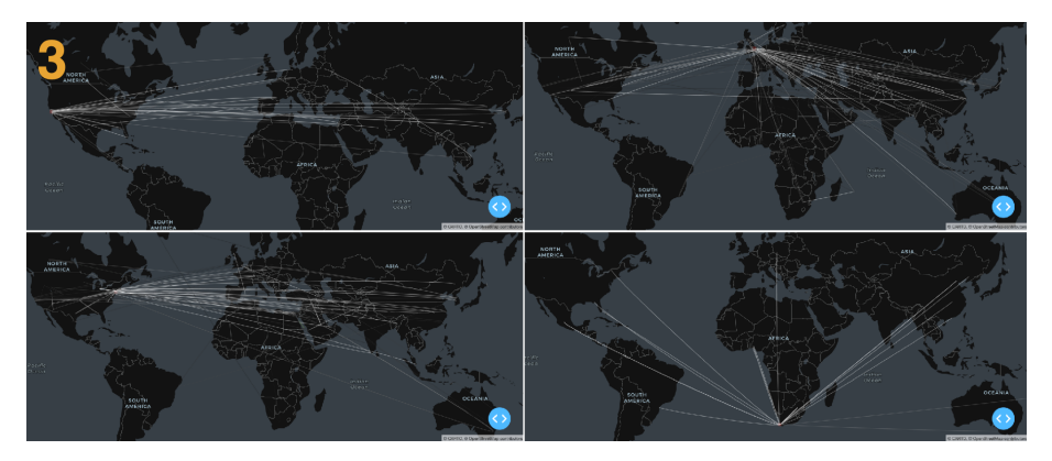
Figure 3. There are highly active centers of activity. The visual shows: top left San Francisco, bottom left New York, top right Cambridge, and bottom right Cape Town (50 km window around each). These are places where the data shows high activity, but they are not the four most active places.

The same type of phenomenon is also found with regard to cultural change in other bodies of thought. A good example is the Chicago School (Baciu 2018). Initially, the term Chicago School had close ties to the city. Over time however, it has spread over the world with Chicago Schools having appeared in new contexts. Suddenly, authors mentioned schools of thought such as the "Chicago School of the West" which was associated with a group of researchers at UCLA. In parallel, scholars in Europe became fascinated with the Chicago School and recounted its history to Europeans (Baciu 2021). Compared to the Chicago School, constructal thinking has spread faster in the Global South. (We have observed its presence in the Global South already in our first insight.)