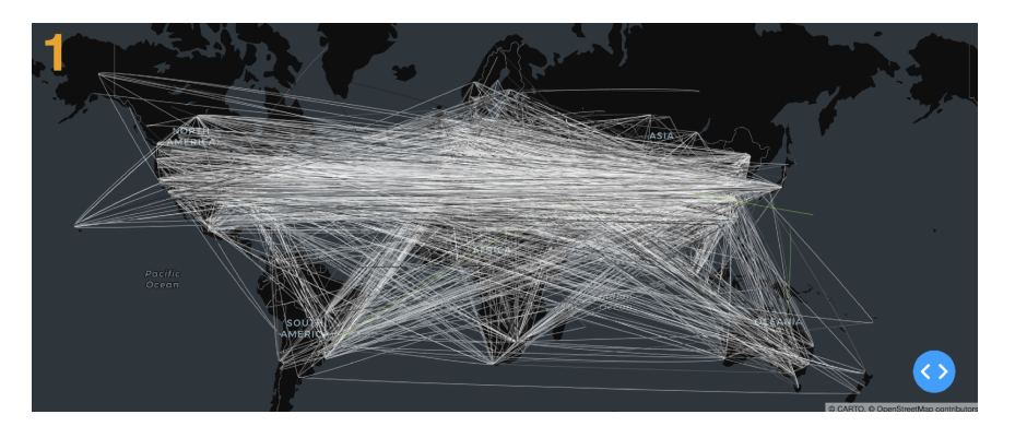
Figure 1. Constructal thinking has spread all over the world, including Australia, Asia, South America, and Sub-Saharan Africa. The visual speaks for itself.

Our five main preliminary insights are visualized in the five following figures.