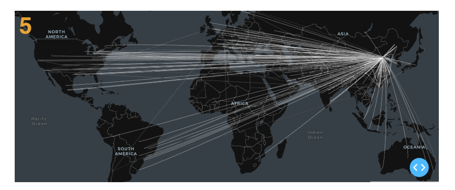
Figure 5. There may be breakaway groups. For example, many publications are affiliated with Beijing but unaffiliated with either Duke or Toulouse.

In Figure 5 , we show that centers of constructal thinking may evolve independent of one another. Focusing on Beijing, we show that research affiliated with Beijing connects this city very broadly to the rest of the world, yet it does not connect it in our dataset with either Durham or Toulouse, which are highly active centers of research, as already mentioned. Thus, the developments in Beijing may be interpreted as a branch of constructal thinking that is at least partly independent of other important branches.