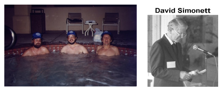
NCGIA PROPOSAL team (in part) at work in Santa Barbara, December 1987