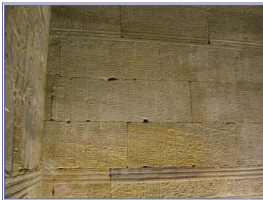
Figure 2. Recipes for scents as recorded in the “laboratory” of the temple of Edfu (Ptolemaic).