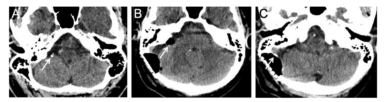
Fig. 2 Bone spicules on post-operative head CT examinations after retrosigmoid craniectomy for VS resection. A single bone spicule is noted in (A) (arrow) along the posterior margin of the resection cavity, abutting the right flocculus. CT examination of a separate patient (B and C) demonstrated multiple bone spicules along the posterior resection cavity (B, arrow) and contouring the craniectomy site (C, arrow). CT, computed tomography; VS, vestibular schwannoma.