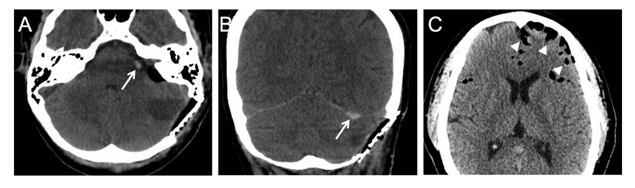
Fig. 3 Spectrum of imaging findings on post-operative head CT after retrosigmoid craniectomy. Noncontrast CT examinations performed after retrosigmoid craniectomy demonstrating focal subarachnoid hemorrhage in the cerebellopontine angle cistern (A, arrow), distal hemorrhage along the left tentorial leaflet (B, arrow) as well as various degrees of pneumocephalus (moderate in C, arrowheads). CT, computed tomography.