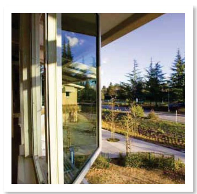
☆ The benefits of natural ventilation for occupants in commercial buildings are well-documented, but not without limitations. Shown here is an example of a naturally ventilated building, the Kirsch Center for Environmental Studies at DeAnza Community College in California.

Weighing the benefits and the drawbacks of each type of ventilation system helps the building occupants, owners, and the technicians integrating and monitoring each concept become a unified force.