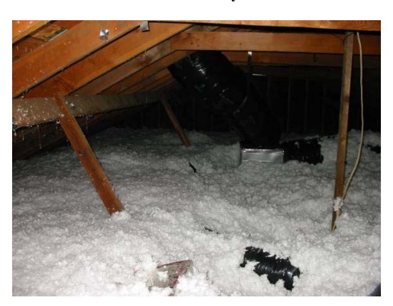
Figure 4. New flex ducts in attic covered by additional blown-in insulation.

Because the ducts, furnace, and air handler were located in the attic, the original retrofit plan was to seal and insulate the attic to bring the system inside conditioned space. Unfortunately, it was not possible to obtain code approval for this retrofit in the available time. As an alternative, it was decided to place the ducts on the attic floor and cover them with blown-in insulation (as illustrated in Figure 4), thus increasing the effective insulation of the ducts and protecting them from the radiation from the underside of the roof deck. Thus, the added attic insulation served two purposes: it increased the envelope insulation and improved the distribution system performance. With sufficient time and resources, it may have been possible to persuade the code authorities to allow a sealed attic. However, as in most real retrofit situations, limits of time meant that the vented attic was retained and the ducts were buried in additional ceiling insulation. Given the strict conservatism of code officials, it is unlikely that these issues can be dealt with on an individual project basis without extensive advance planning. Hopefully, research projects like the current study will mean that innovative building changes will become more widely accepted.