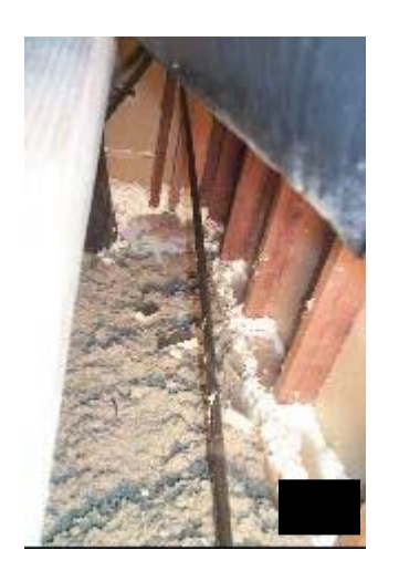
Figure 3. Sealing cavities connecting the house to the attic. Foam was used for sealing small holes and cracks at building component intersections (left). Duct board insulation was used to block off large open areas (right)