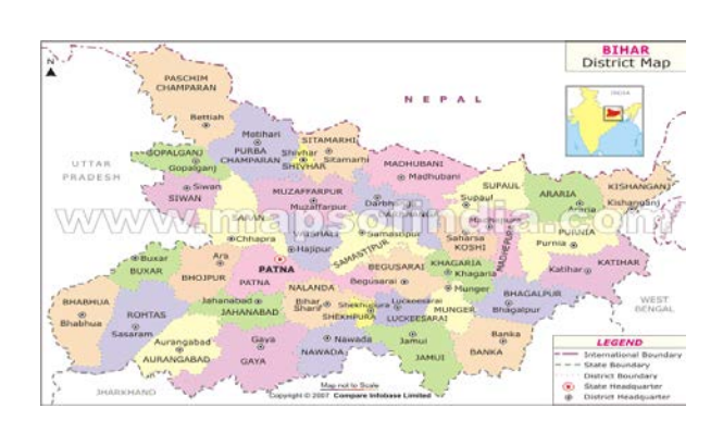
Currently, Bihar is one of the states of the Indian union situated in the eastern part of India between latitude 21-58-10 N ~ 27-31-15 N and longtitude 82-19-50 E ~ 88-17-40 E (Figure-1). Patna is the capital of Bihar. To Bihar's north is the Kingdom of Nepal. On its other three sides Bihar is surrounded by the Indian states of Uttar Pradesh to the west, Jharkhand to the south and West Bengal to the east. Bihar lies in the very fertile Gangetic plain. It's average elevation above sea lea level is 173 feet. The total area of Bihar is 94,163 sq km. The total population of Bihar per the 2011 c ensus is 103.8 million (approx.) making it the third largest state in terms of population.<sup>50</sup> The density of population is 880/square km. Now there are 38 districts as main administrative units.

Bihar is among the least developed states of India and has a per capita income of Rs.24,681 ($537) a year against India's average of Rs.60,972($1410) by the end of 2011.<sup>51</sup> A total of 40% live below the poverty line as compared to India's average of 26.1%. The blame for this stems from many factors: grossly discriminatory central government policies, viz. Freight