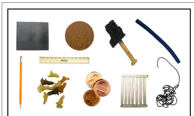
FIGURE 1 | Stimuli used during the experiment. There were four known objects (ruler, pennies, string, and pencil) and six novel objects. Please note that objects are not scaled according to size.

At the beginning of the experiment, children were told they were going to play a game in which they would learn to measure things. Adults were told that they were going to play a game that was