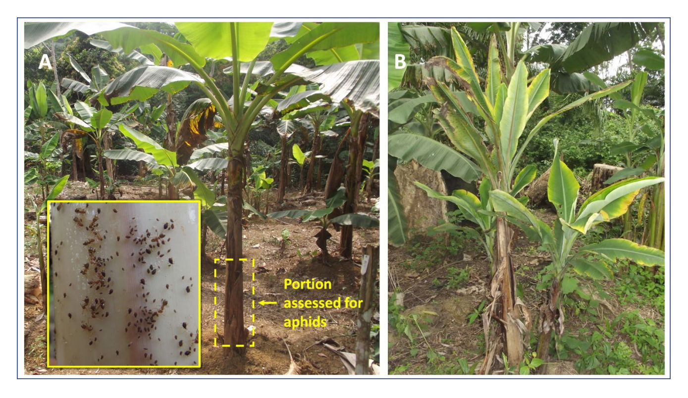
Figure 1. ( A ) The lower part of the pseudostem of a banana shoot used for aphid counting in the field trial; inset: banana aphids on pseudostem. ( B ) Musa plant with typical bunchy top disease symptoms in the field.