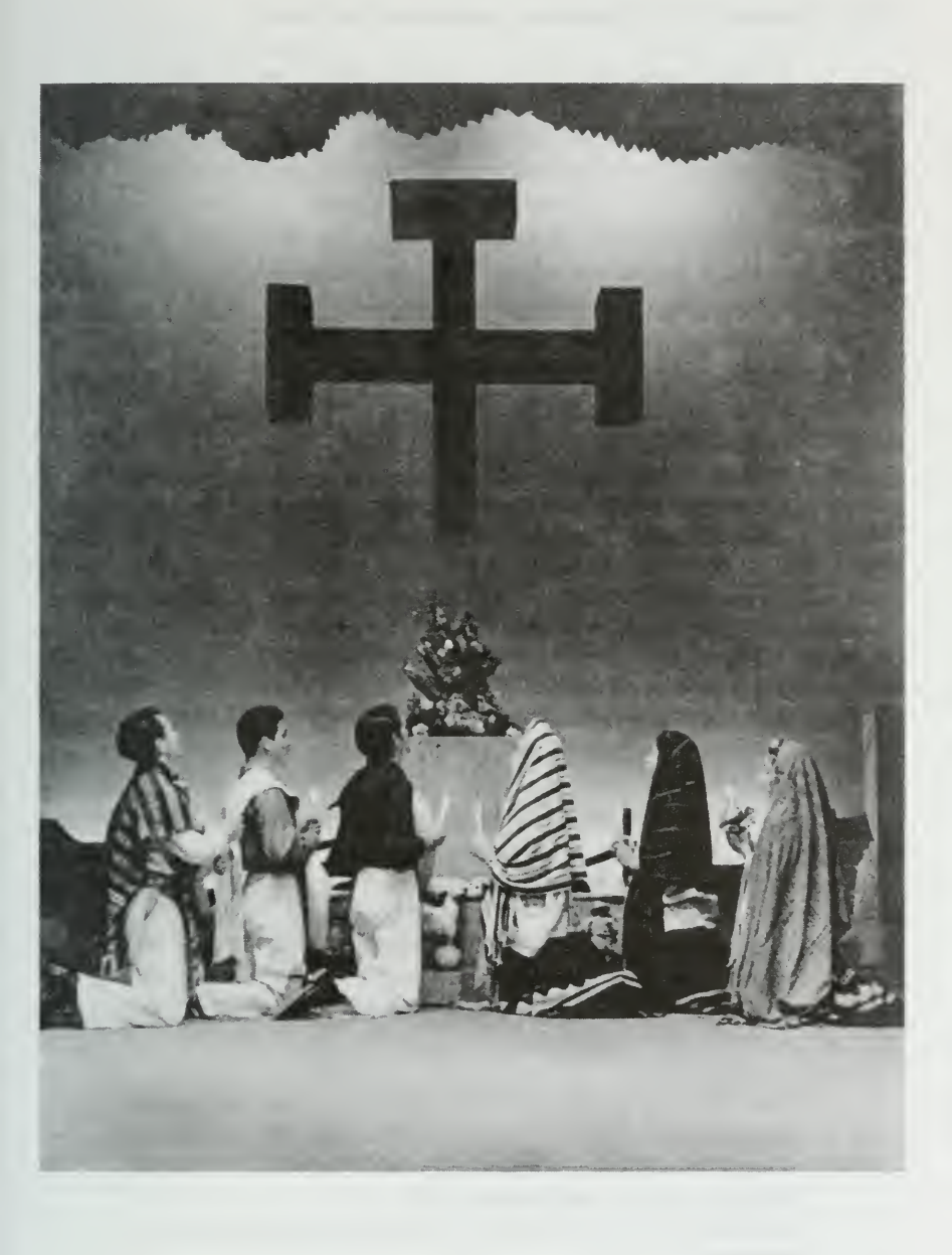
(Figure\ 3: Scene from\ ``Ysidro."\ Padua\ Hills\ The atre\ Collection\ at\ Pomona\ Public\ Library.)