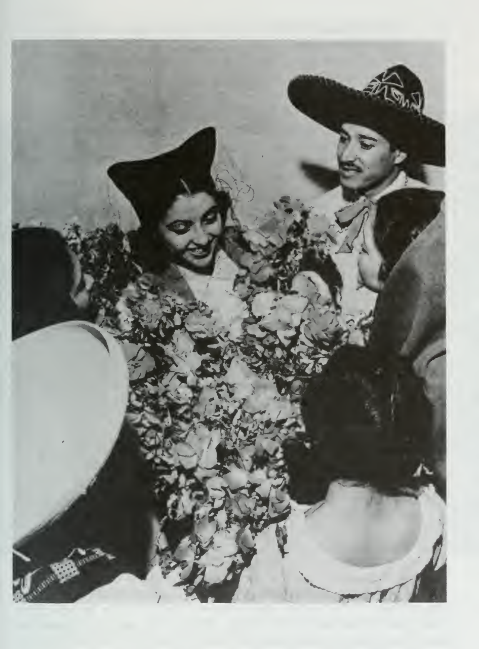
(Figure 8: Scene from "Marina". Padua Hills Theatre at Pomona Public Library.)