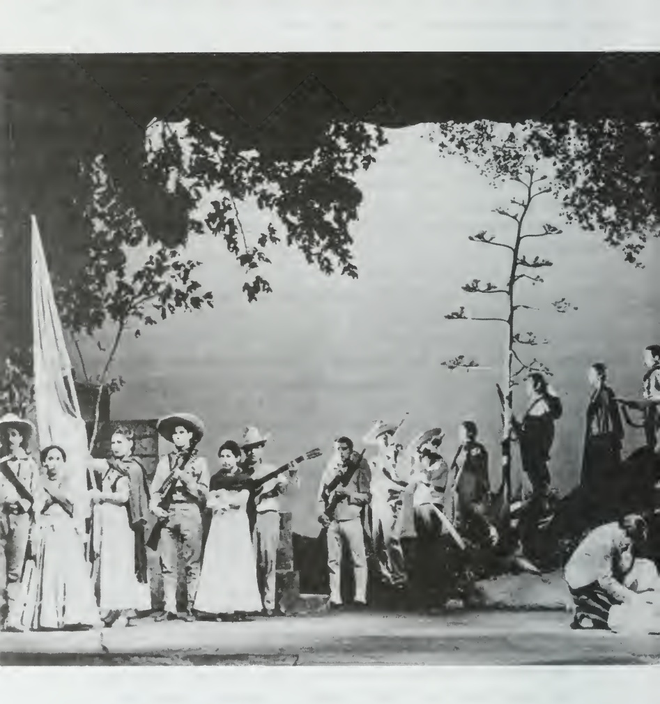
(Figure 6: Scene from "La Adelita".)