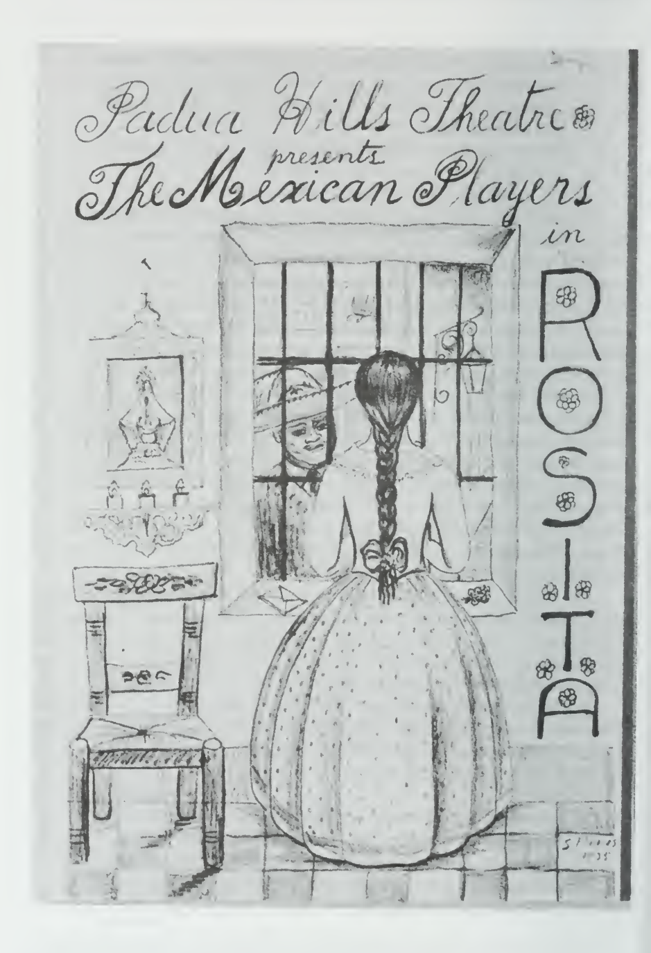
Figure 4: Cover page of the "Program Notes."