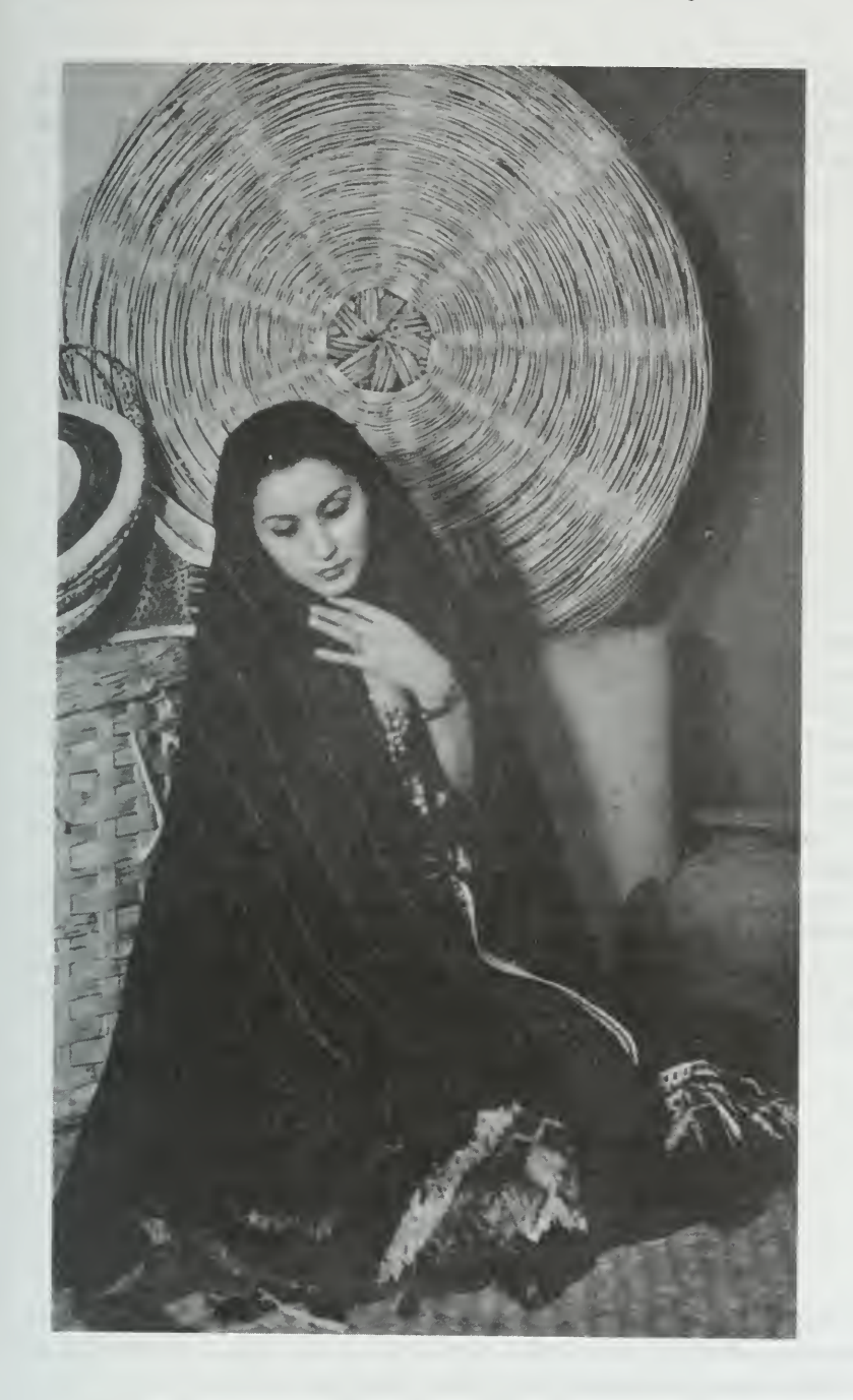
(Figure 5: Scene from "Qué bonito México".)