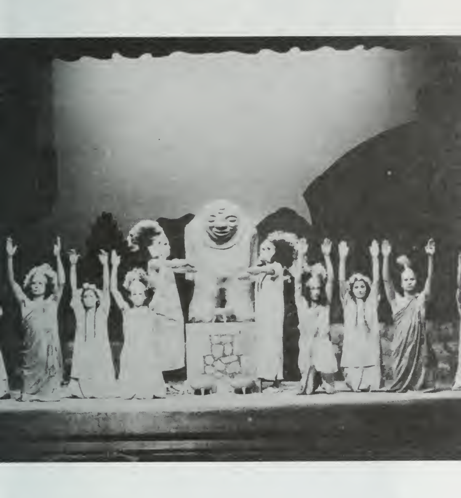
(Figure 9: Scene from "¿Idolos Muertos?" Padua Hills Theatre Collection at Pomona Public Library.)