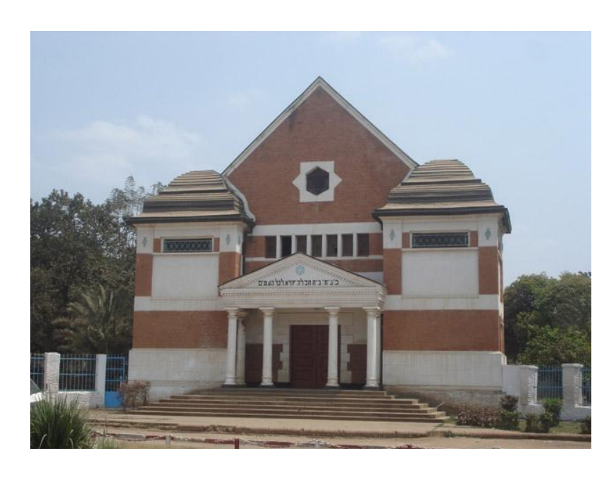
Figure 5: Synagogue