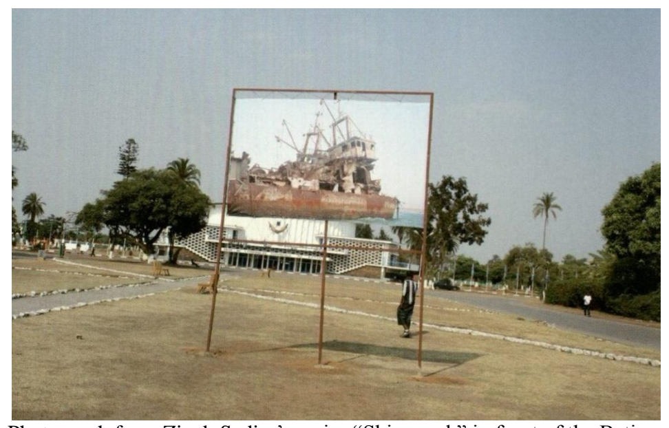
Figure 17: Photograph from Zineb Sedira's series "Shipwreck" in front of the Batiment 30 juin.

Senga, Georges. "Vue de l'installation de l'image de la série 'Sans Titre', de Pierrot Men, placée devant le Gécamines. Parcours: Zone Neutre » (Njami 2010:139).