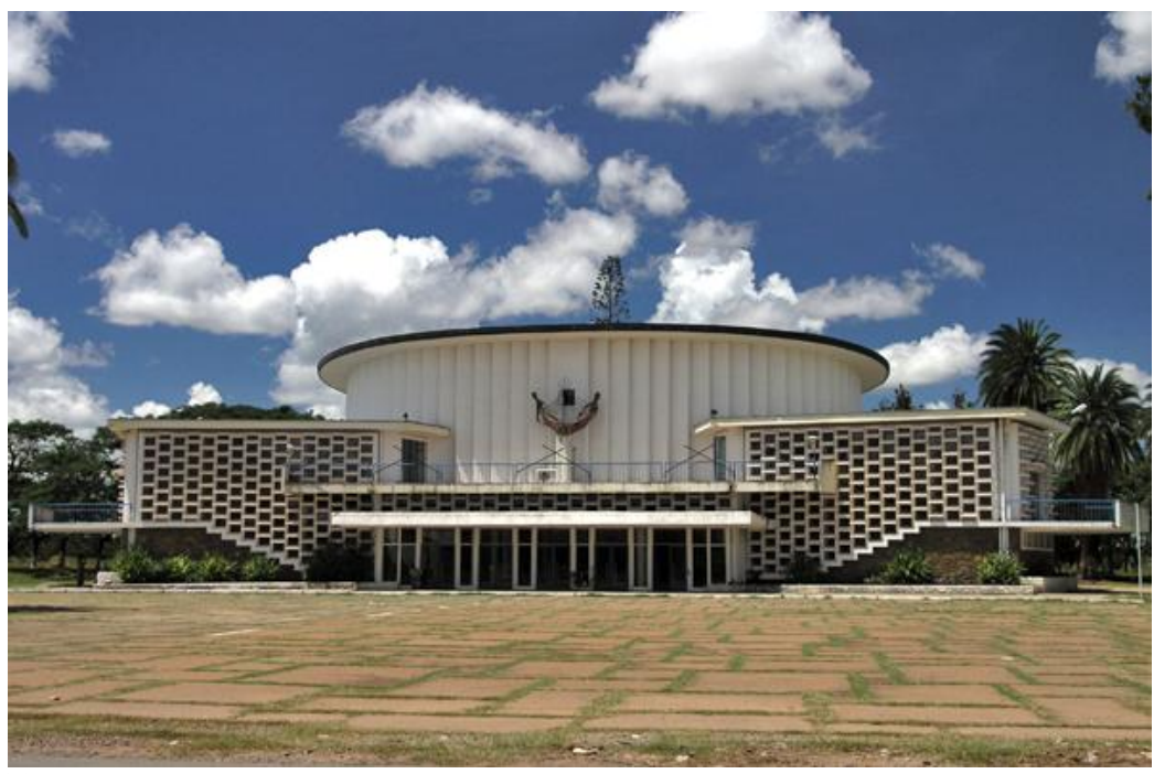
Figure 11: Batiment 30 juin