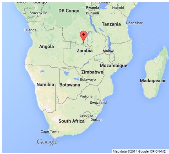
Figure 2: Map of southern Africa with Lubumbashi indicated ( Ibid. ).