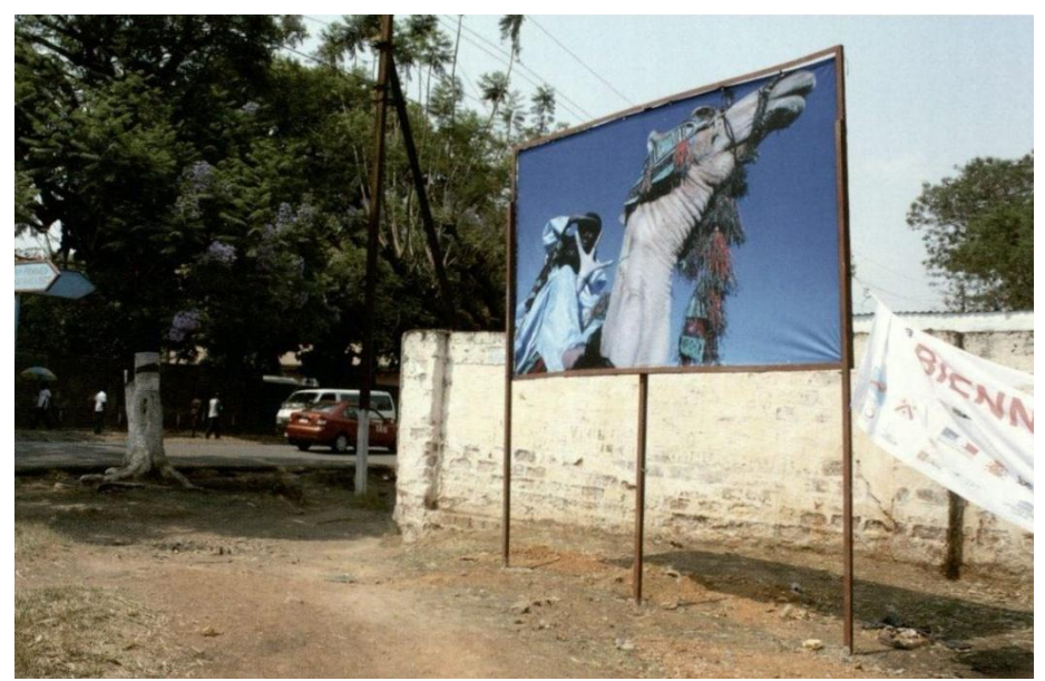
Figure 13: Photograph from Adama Bamba's "Bouctou" series installed in front of Methodist church

Senga, Georges. "Vue de l'installation de l'image de la série 'Bouctou', d'Adama Bamba, placée devant l'église méthodiste. Parcours: Pouvoir» (Njami 2010:136).