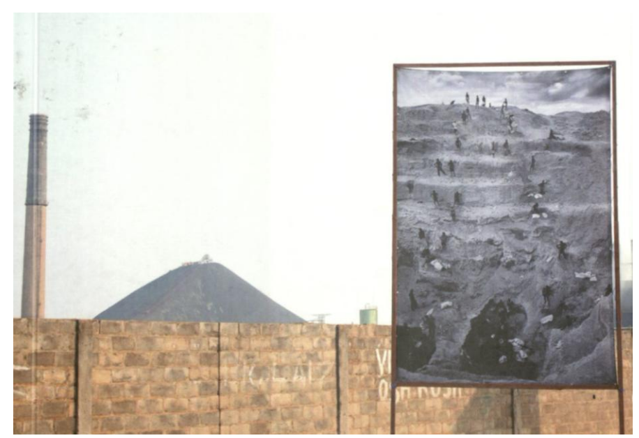
Figure 15: Photograph from Pierrot Men's series "Sans Titre" in front of the Gécamines slag heap.

Senga, Georges. "Vue de l'installation de l'image de la série 'Sans Titre', de Pierrot Men, placée devant le Gécamines. Parcours: Zone Neutre » (Njami 2010:139).