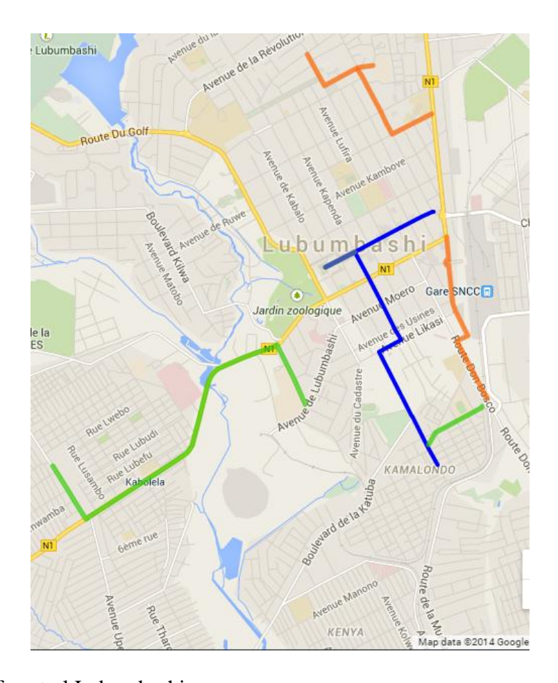
Figure 1: Map of central Lubumbashi

Green Route: Neutral Zone Blue Route: Axis of Power