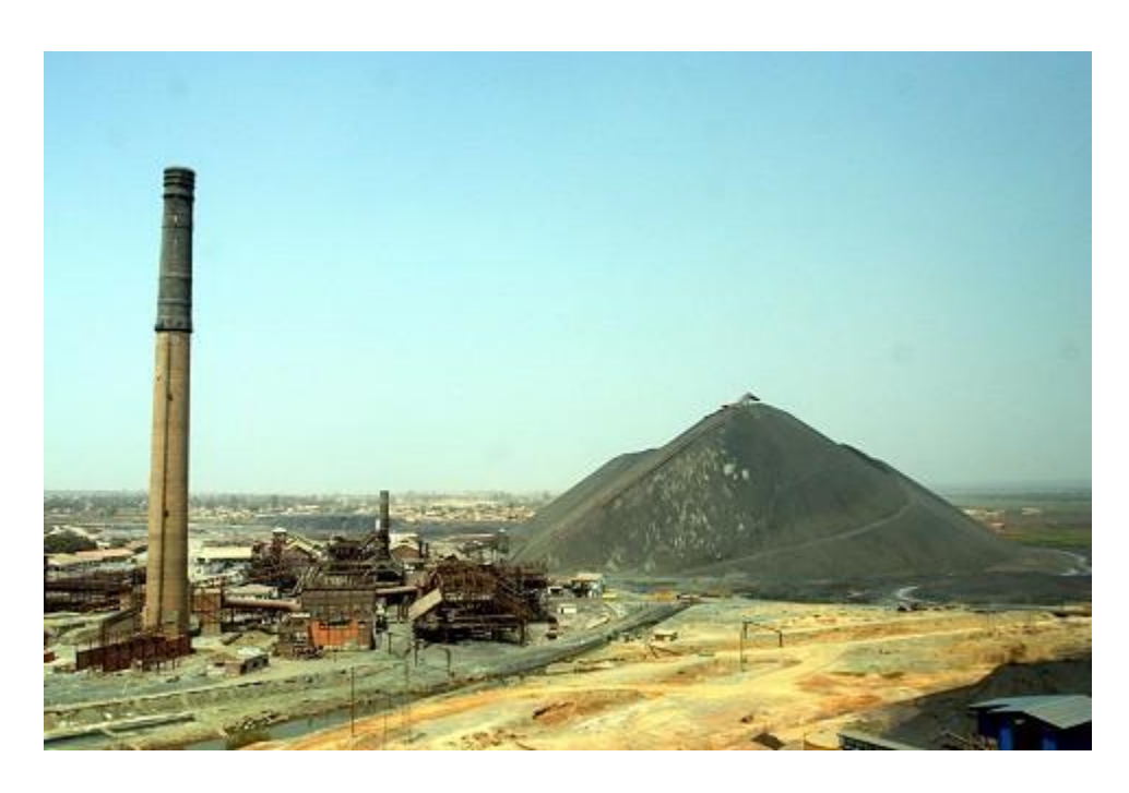
Figure 3: The iconic chimney and "terril" of Lubumbashi. ("A general view of the Gécamines copper mine in DR Congo's southern mining town of Lubumbashi," Congo Planet [August 2005]. Congo Planet . http://www.congoplanet.com/2014/07/04/news/2100/congo-improves-natural-resources-accounting.jsp.)