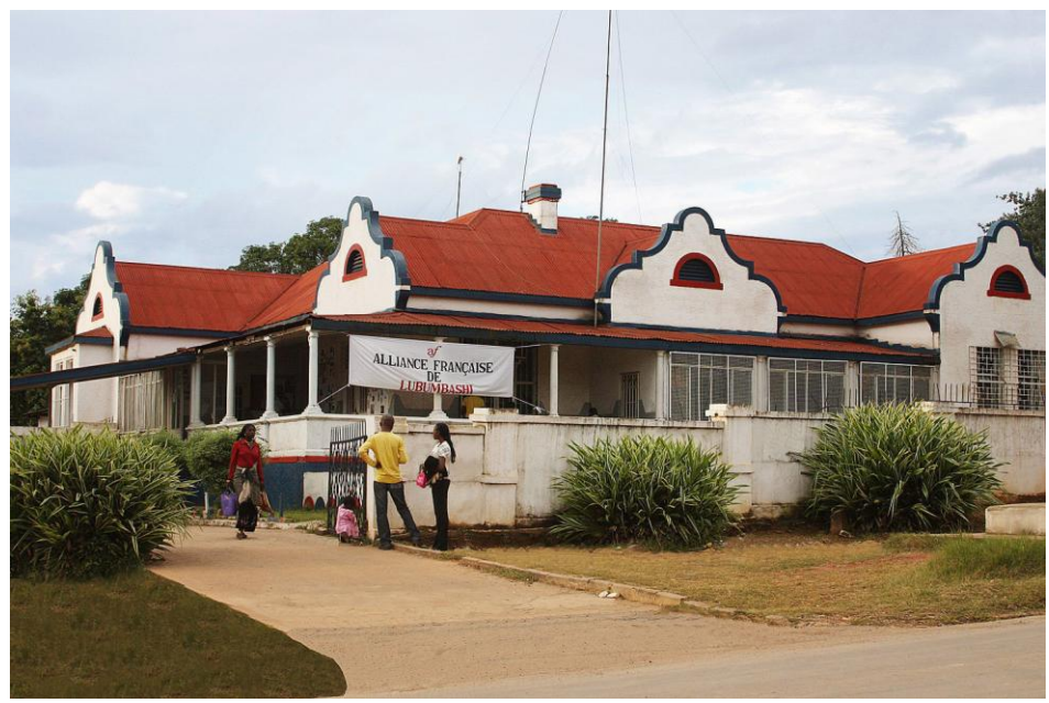
Figure 9: Alliance Française building

Alliance française de Lubumbashi. « Alliance française de Lubumbashi. » From Facebook album.