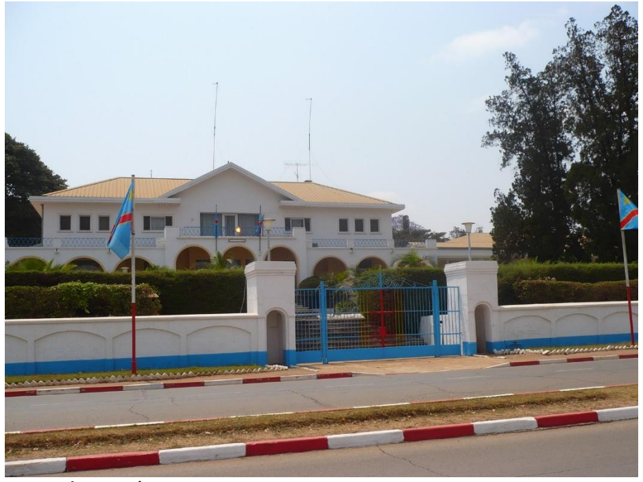
Figure 7: Governor's mansion