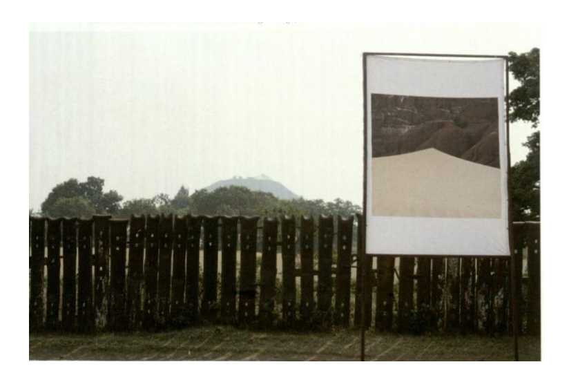
Figure 14: Photograph from Jellel Gasteli's series "Objects In Mirror Are Closer Than They Appear" in front of the Lubumbashi slag heap (terril).

Senga, Georges. "Vue de l'installation de l'image de la série 'Bouctou', d'Adama Bamba, placée devant l'église méthodiste. Parcours: Pouvoir» (Njami 2010:136).