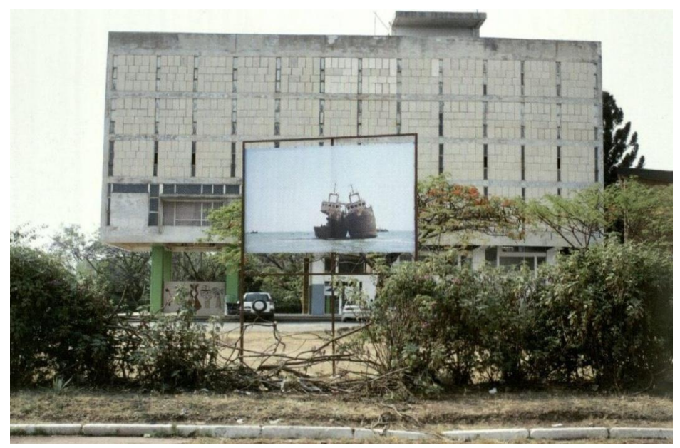
Figure 18: Photograph from Zineb Sedira's series "Shipwreck" in front of the national museum.

Senga, Georges. "Vue de l'installation de l'image de la série 'Shipwreck', de Zineb Sedira, placée devant le Musée National de Lubumbashi. Parcours: Culture » (Njami 2010:142).