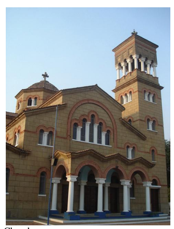
Figure 6: Greek Orthodox Church