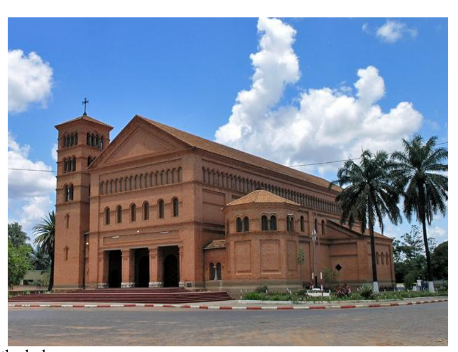
Figure 10: Cathedral

Alliance française de Lubumbashi. « Alliance française de Lubumbashi. » From Facebook album.