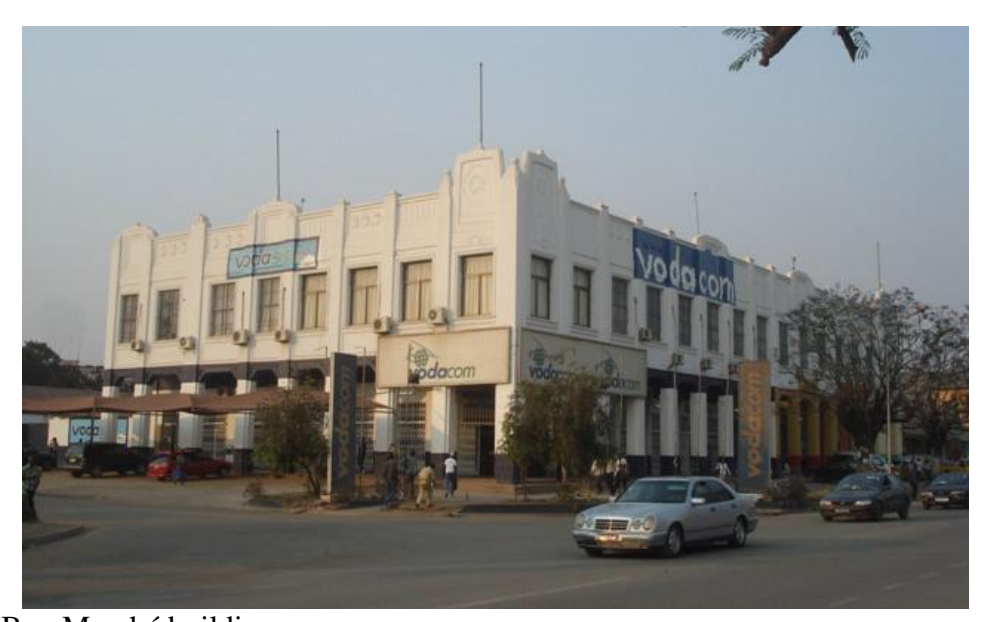
Figure 8: Bon Marché building

École privée belge de Lubumbashi. « Le gouvernorat. » From <a href="http://epblubumbashi.blogspot.com/p/lubumbashi.html">http://epblubumbashi.blogspot.com/p/lubumbashi.html</a>.