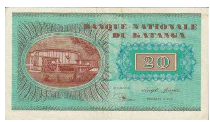
Figure 12: Twenty franc note from Republic of Katanga

"Katanga provincial parliament building" by Nick Hobgood from Cap-Haitien, Haiti - Katanga - provincial parliament building. Licensed under CC BY 2.0 via Wikimedia Commons - <a href="http://commons.wikimedia.org/wiki/File:Katanga_provincial_parliament_building.jpg#mediaviewer/File:Katanga_provincial_parliament_building.jpg">http://commons.wikimedia.org/wiki/File:Katanga_provincial_parliament_building.jpg</a>