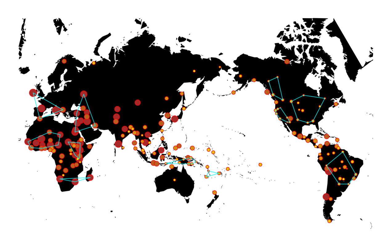
Figure 1: Technological level (not spatially smoothed). Larger red points represent higher values, smaller yellow points low values. The cyan lines demarcate convex hulls around regions of significant local autocorrelation.

metalwork, and include most African pastoralists. Societies in the Americas and Melanesia lack large domesticated animals, and tend to have low values.