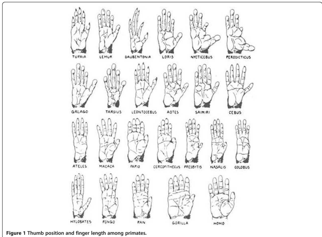
Figure 1 Thumb position and finger length among primates.

There are other differences among species and almost all are related to evolution. Table 1 [57-59] shows some differences in the composition of enzymes that metabolize drugs. Different enzymes metabolize different drugs,