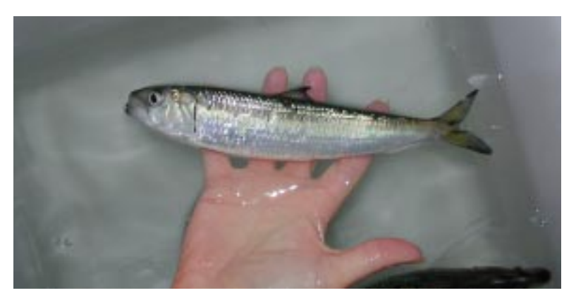
A healthy adult sardine (Sardinops sagax).

In 2001, a potentially lethal pathogen was identified in sardines landed in Southern California. The pathogen was found to be a rhabdovirus with similarities to the rabies virus. The virus attacks the lining of a fish's blood vessels causing hemorrhaging. Fish with these symptoms have what is known as viral hemorrhagic septicemia (VHS),