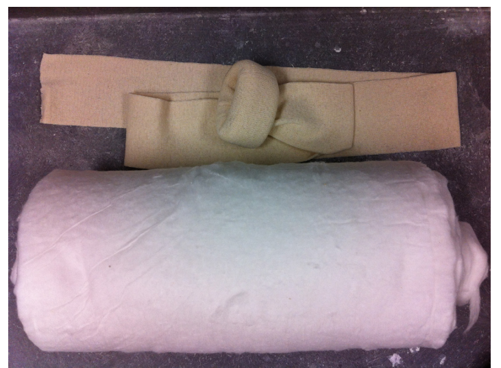
Figure 3. The stockinette is cuffed, to allow for insertion of the cotton roll.