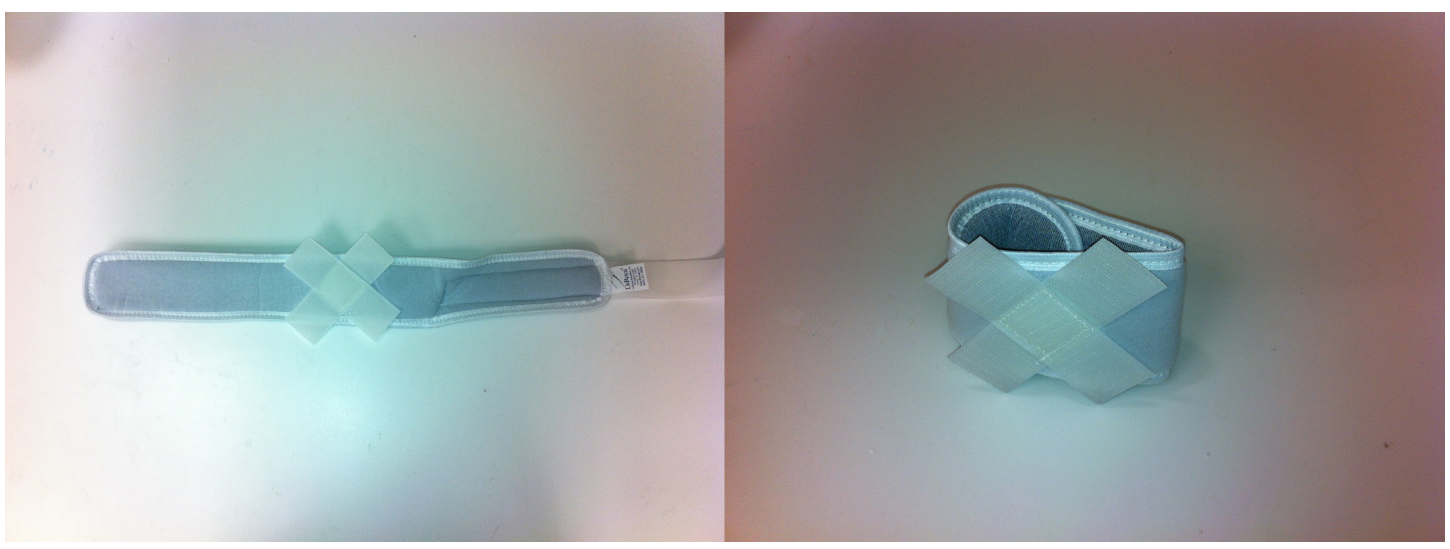
Figure 7. The arm strap and the slightly smaller wrist strap.