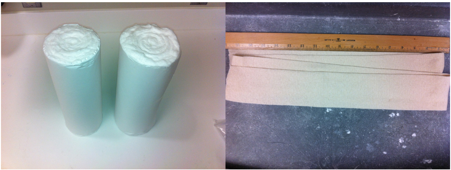
Figure 2. Two 14-inch cotton rolls and 4 feet of 4 inch stockinette are prepared.