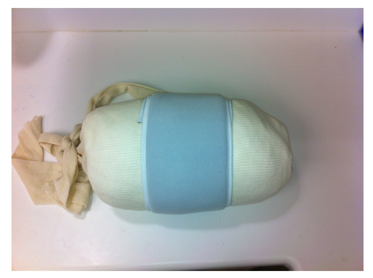
Figure 5. A waist strap is wrapped around the bump and fastened, completing the external rotation bump.