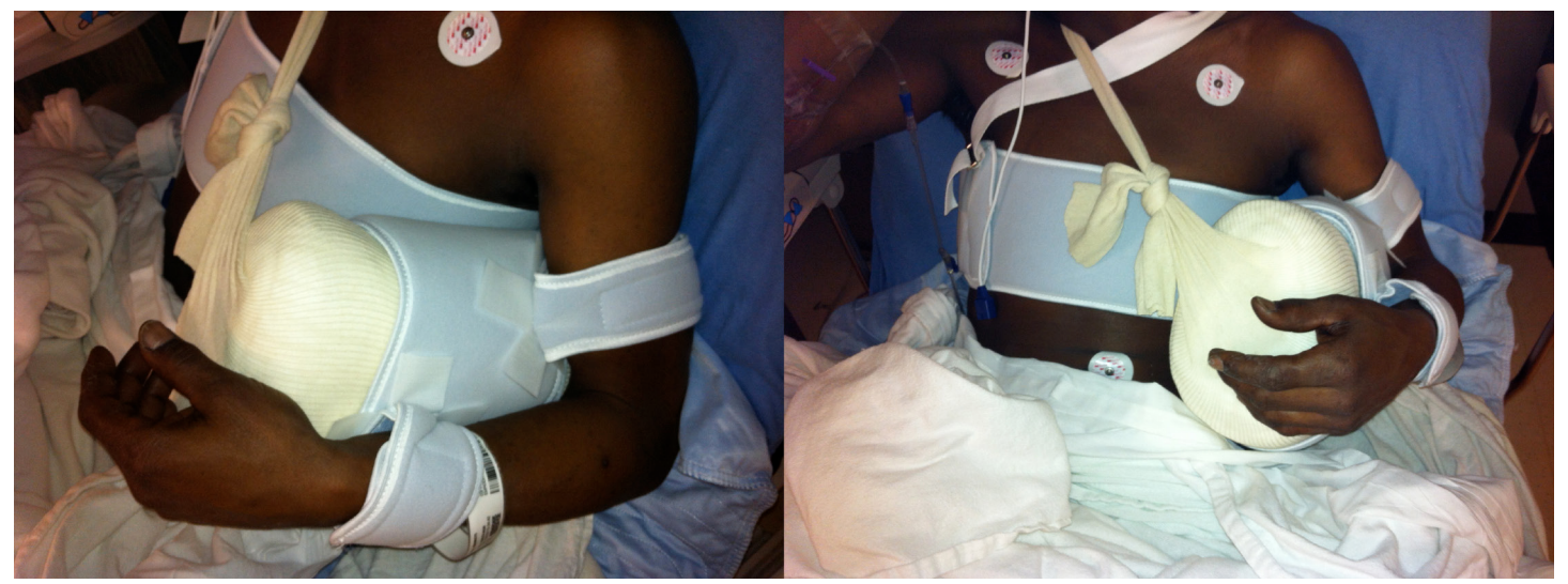
Figure 8. The ideal shoulder immobilization position of 10 degrees of external rotation and 20 degrees of abduction.