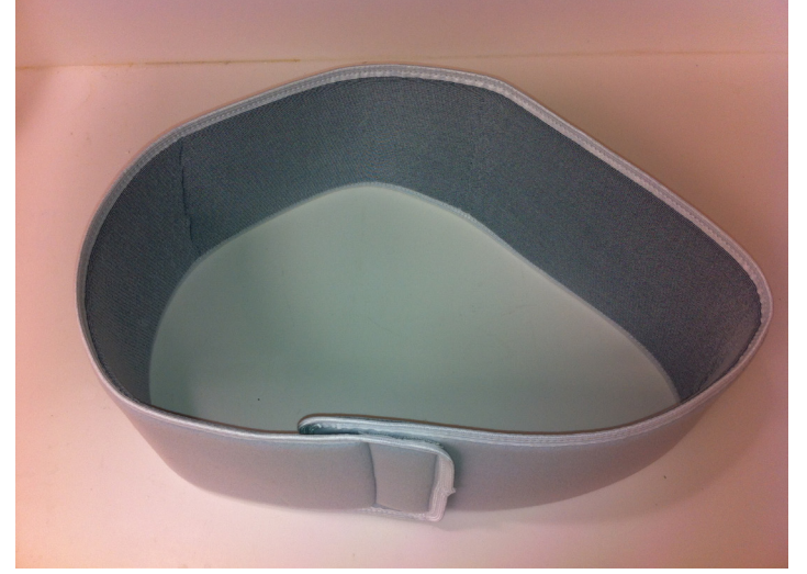
Figure 6. The waist strap.

rotation. <sup>9,10,24</sup> However, larger randomized controlled trials and meta-analyses comparing positions of internal and external rotation for shoulder immobilization following reduction after shoulder dislocation have shown no difference in rates of dislocation recurrence. <sup>2,15,17,26,27</sup> Although a controversial topic, immobilization of the shoulder in a position of external