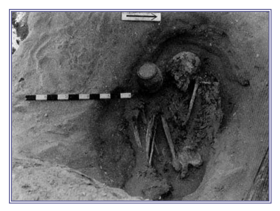
Figure 4. Maadi, burial number 44 (c. 3900 – 3600 BCE).

recorded from the cemetery is attested in the settlement, only certain forms from the settlement were deemed to be appropriate in a (Buchez 1998: funeral context Comparison of the types of flints found in settlement and burial contexts also reveals preferential selection for blades, bladelets, and knives for use in mortuary arenas (Holmes 1989: 333). Palettes may also have been used differently in funeral contexts in comparison to everyday life, with green malachite staining predominant in burial contexts but red ochre more common on settlement palettes (Baduel 2008).