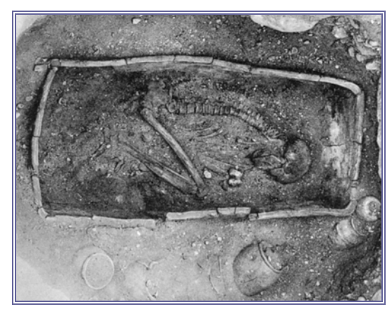
Figure 1. Pottery coffin (c. Naqada IIIA1). El-Mahasna, grave H92.

subterranean tombs is attested at a few sites in late Naqada II (e.g., Tomb 100 in Hierakonpolis), but by early Naqada III, this had been adopted as a standard feature of high-status burials, such as at Minshat Abu Omar (Kroeper 1992: fig. 3). The series of Naqada III brick-lined tombs at Abydos, some with multiple chambers, form direct precursors to the 1st and 2nd Dynasty royal tombs that extend south from this location.