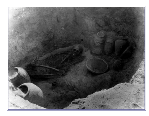
Figure 3. Naqada II burial (c. Naqada IID). El-Abadiya (Diospolis Parva), grave B379.

Such choice in funeral arrangements is also clear from the objects selected for inclusion in the tomb. It was previously assumed that some objects were made specifically for mortuary consumption, such as decorated pottery (D-ware). Examination of use-wear and settlement deposits has demonstrated, however, that this is not the case (Buchez 1998) and that the majority of tomb paraphernalia derived from daily life. Nevertheless, with the benefit of concurrent excavation of cemeteries and settlement at Adaima, it is evident that whilst all the pottery