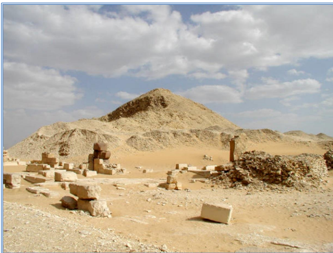
Figure 1. Pyramid of Pepy II at South Saqqara.