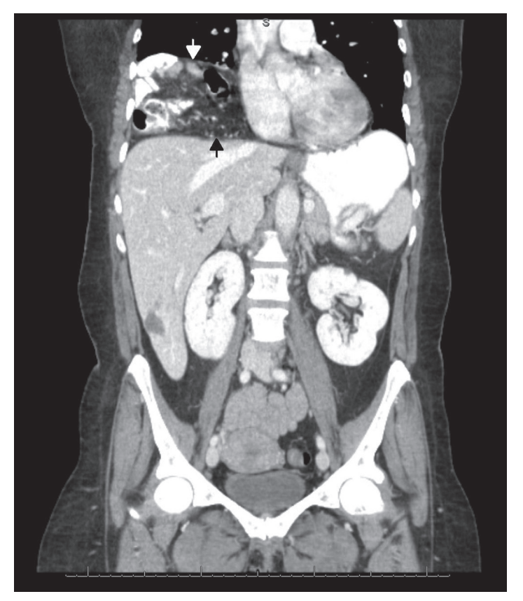
Figure 2. Coronal computed tomography image showing multiple bowel loops within the right thoracic cavity (white arrow) consistent with a Morgagni hernia. The diaphragm can be identified below the hernia contents (black arrow).

Development of hepatodiaphragmatic interposition has been attributed to multiple factors. Predisposing functional disorders include constipation, diaphragmatic paralysis, increased gastrointestinal motility and aerophagia. 1,2,4 Anatomic factors include malfixation or malposition of bowel, redundant or elongated bowel, laxity of hepatic suspensory ligaments, reduced liver volume (i.e. cirrhosis), disorders resulting in increased intraabdominal pressure (i.e. pregnancy), and disorders associated with enlargement of the lower thoracic cavity (i.e. chronic obstructive pulmonary disorder). 1,2,4