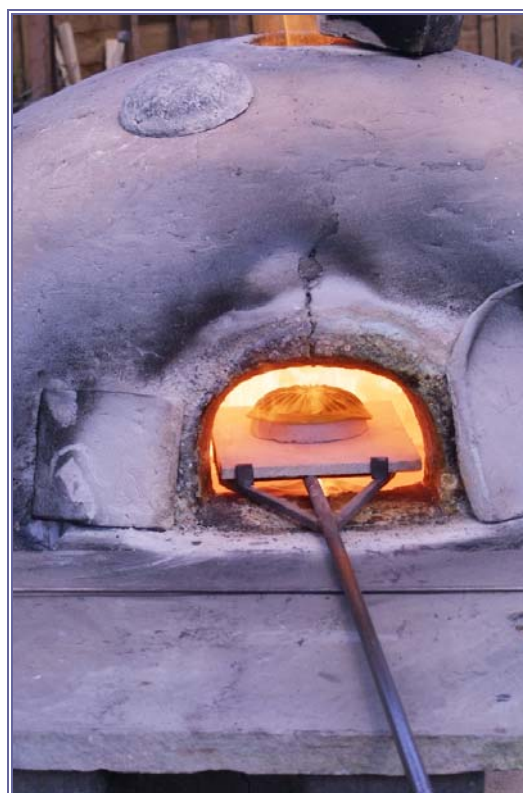
Figure 8. A replica Roman bowl slumping over its former in the furnace.

have been made in open-face molds. A few small pieces in the round exist and seem to have been made by the lost wax process. In this method, a wax image of the object was produced and had clay pressed around it. The object was then heated, which fired the clay and melted away the wax leaving a void in the shape of the object. The void was then filled with the intended medium for the object—in