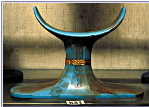
Figure 1. Glass headrest of Tutankhamen. This is believed to have been cast and cold worked. It was made in two parts joined by a wooden dowel and covered by a gold band. Carter's number 403a.

2. Core forming. A process known as core forming was the most widely used method for producing glass vessels from the New