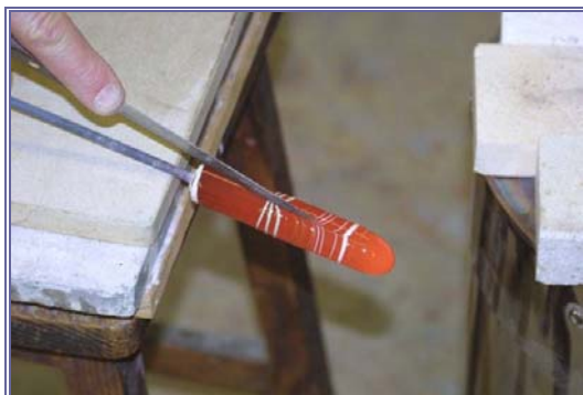
Figure 5. Using a metal tool to draw up some of the bands of applied decoration to form them into swags or zigzags.

2002: 27 - 28) or covered by the application of chunks of softened glass. It has also been suggested the core was dipped into a pot of molten glass (cf. Harden 1968: 50) or that molten glass was trailed onto the core (Nicholson and Henderson 2000: 202 - 204). Whatever means was used, the glass was then