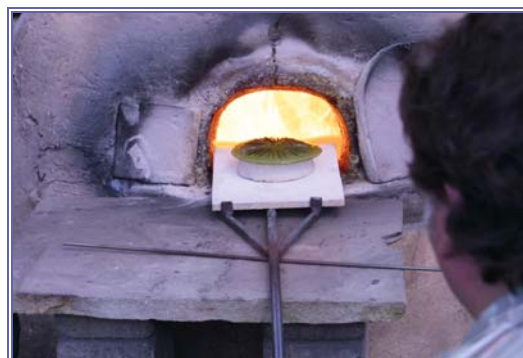
Figure 7. A replica of a Roman ribbed bowl being slumped over a former.

4. Lost wax. There remains the question of the manufacture of small items such as amulets and inlays other than those that may