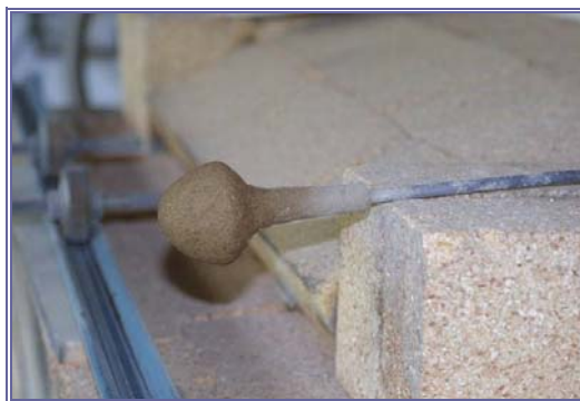
Figure 2. A core drying before being heated and coated in glass.

Kingdom into Hellenistic times (Gudenrath 1991: 214 - 215; Nicholson and Henderson 2000; Stern and Schlick-Nolte 1994: 27 - 44). It was a more difficult and time consuming operation than simple gathering and became the common process for making glass vessels once the properties of glass were better understood and confidence in its use had been achieved.