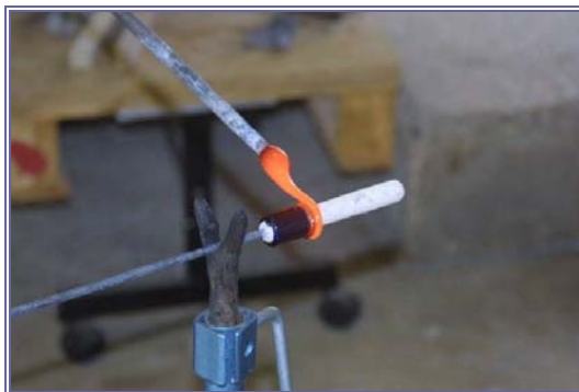
Figure 3. Applying glass to a dried and heated core.