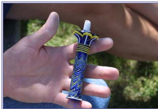
Figure 6. A completed replica of a kohl tube in the form of a palm. The piece has been annealed and still contains the core, which now has to be broken up to remove it.

2002: 27 - 28) or covered by the application of chunks of softened glass. It has also been suggested the core was dipped into a pot of molten glass (cf. Harden 1968: 50) or that molten glass was trailed onto the core (Nicholson and Henderson 2000: 202 - 204). Whatever means was used, the glass was then