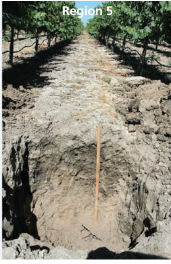
Region 2 soils formed from coarse, textured alluvium deposited during the last 70,000 years; region 3 soils, with duripans and clay-rich horizons, formed from granitic alluvium deposited 130,000 to 330,000 years ago; region 4 soils formed from alluvium deposited over 600,000 years ago, originating from metamorphosed volcanic and sedimentary rock; and region 5 soils formed from consolidated volcanic mudflows deposited 3 to 10 million years ago. In region 1 (not shown), soils develop from basin alluvium deposited over the last 14,000 years.

Region 3. This region consists of low terraces of Riverbank age, deposited approximately 130,000 to 330,000 years ago. Large expanses of this soilscape are located in the district's central portion (fig. 1). The original landscape consisted of gently undulating microtopography (highs and lows with 5- to 10-foot spacing). Leveling and cultivation have extensively altered this landscape. Soils have formed from granitic alluvium and often contain duripans (silica-cemented hardpan) and clay-rich layers that restrict water and root penetration. Dominant soils of this region are San Joaquin, Bruella, Montpellier and Cometa.