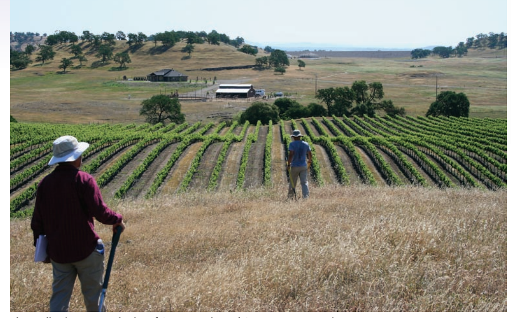
The Lodi Winegrape District of San Joaquin and Sacramento counties encompasses a wide range of soil types, on which about 100,000 acres of wine grapes are grown.

The Lodi Winegrape District is one ■ I of the largest in California, with approximately 750 growers and about 100,000 acres in production in San Joaquin and Sacramento counties. This district encompasses a wide range of wine-grape varieties, production systems and soils.