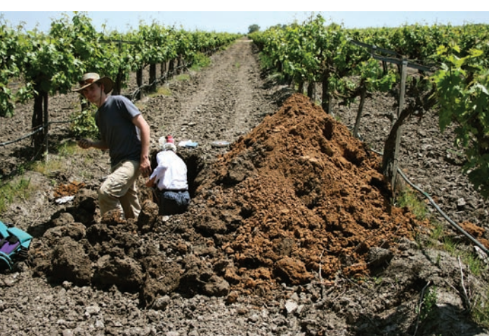
Characterization of soil profiles provided the basis to divide the District into five soil regions, by integrating the existing soil databases in a GIS and linking soil properties to potassium status.

tion and exchangeable potassium were measured from soil samples collected from the horizons of each soil profile (Murashkina et al. 2007a). Samples were also analyzed for particle size distribution, pH, cation exchange capacity and clay mineralogy.