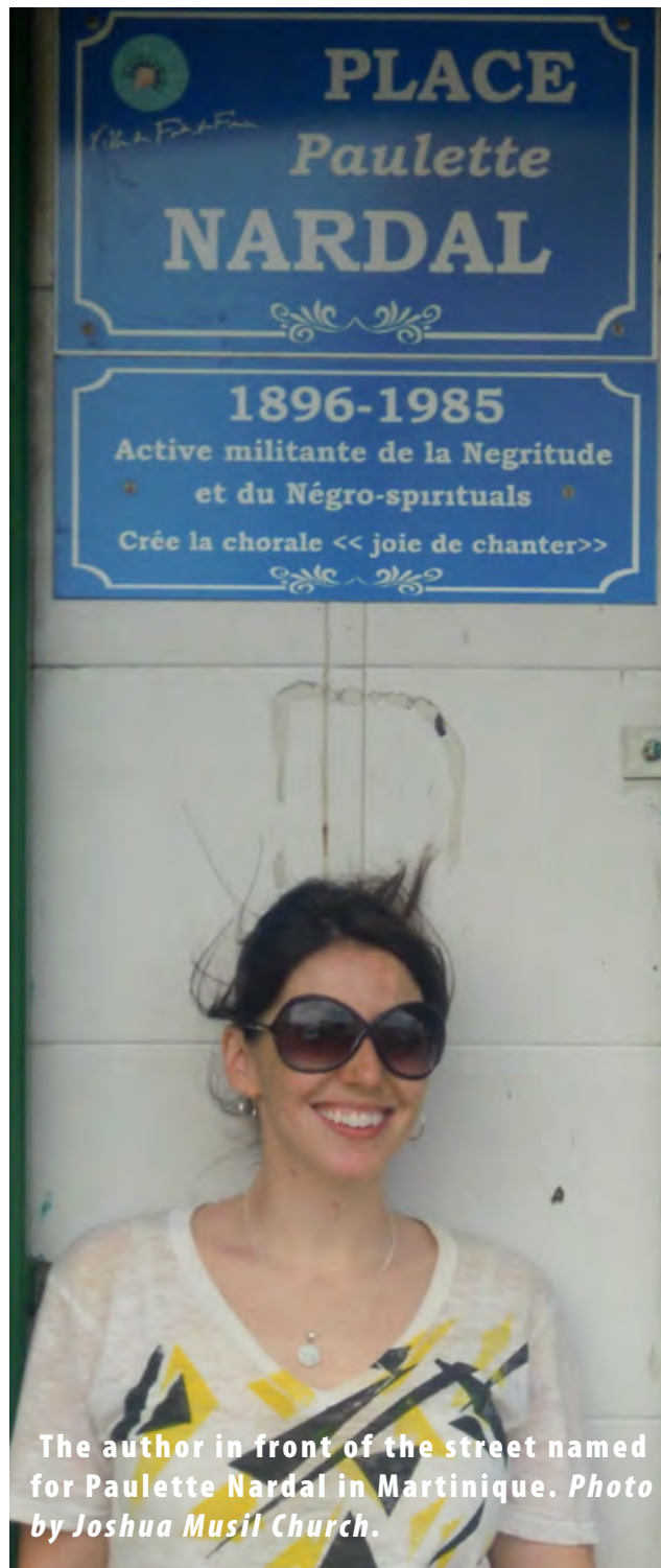
The author in front of the street named for Paulette Nardal in Martinique.

WHAT I FOUND AS I DID MY RESEARCH INTO THE NARDAL FAMILY WAS THAT THERE WAS A RICH HISTORY OF WOMEN OF AFRICAN DESCENT WHO HAD WORKED FOR RACIAL JUSTICE AND WOMEN'S RIGHTS IN THE FRENCH EMPIRE SINCE ITS INCEPTION. IN MY LATEST TRIP TO MARTINIQUE I WAS ABLE TO MINE THE ARCHIVES AND TRACE THE NARDAL FAMILY'S ANCESTORS BACK TO ENSLAVEMENT AND BEGAN THINKING ABOUT HOW THE NARDALS' ANCESTORS EXPERIENCED RACE AND GENDER IN THEIR TIME.