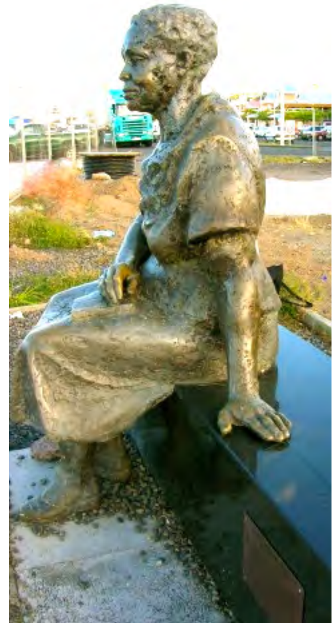
Statue of Gerty Archimède in Guadeloupe.

1880-1900, European colonial empires claimed all of Africa, with the exceptions of Liberia and Ethiopia. 9 France added the bulk of West Africa as well as French Equatorial Africa, French Somaliland, and Madagascar to its colonial empire. Unlike the British colonial policy that implemented “indirect rule” in the colonies, viewing colonized lands as separately governed entities; French colonial policy was one of “direct rule.” It viewed the lands it had colonized as an extension of France. The accompanying ideology was known as the French mission civilisatrice , or “civilizing mission.” This philosophy promoted the idea that the infusion of French culture could improve the lives of the “uncivilized” and “savage” indigenous peoples from the colonies. 10 Although slavery was legally abolished in the French colonies, forced labor continued to be widespread in Africa. The Code de l’indigénat was a legal code adopted in 1887 that gave colonial administrators authority to fine and jail indigenous people without trial. 11 The