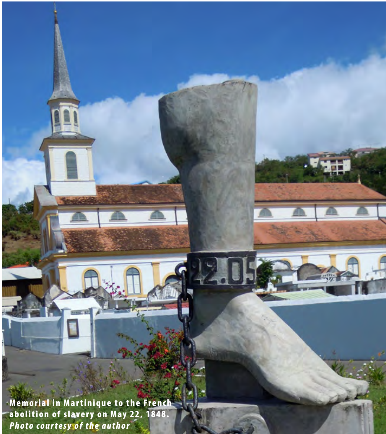
Memorial in Martinique to the French abolition of slavery on May 22, 1848.