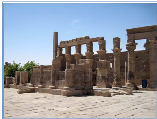
Figure 9. The kiosk of Nectanebo I on the island of Philae.

The Late Dynastic Period was not only the last period of Egyptian independence but also paved the way to the advent of Hellenism in many respects. Due to its alliances with the Greek city-states, Egypt became a standing factor of their international situation. The contacts to Greeks were strong enough to produce even a certain "Hellenization" (at least some knowledge of the Greek culture) in Egyptian society: the Hellenic education of Manetho mentioned by Josephus Flavius ( Contra Apionem I. 14. 73) is likely to have been acquired still under Dynasty 30. The religious trends represented at that time (the flourish of the animal cult; the cult of royal statuary; the importance of mammisi; the choice of such building grounds as Edfu, Dendara, the isle of Philae, etc., fig. 9) is well-attested under the Ptolemies.