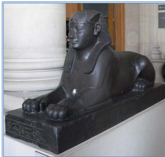
Figure 1. Basalt sphinx bearing the name of king Hakoris (393 - 380 BC). Found in Rome, maybe at the Iseum of the Campus Martius. Louvre, A 27.