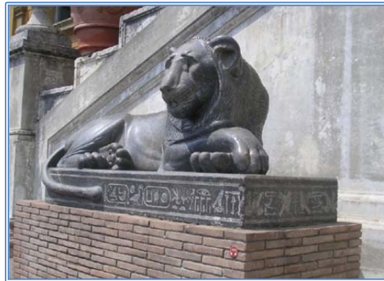
Figure 2. Lion statue of king Nectanebo I. Vatican, Museo Gregoriano Egizio, 16.

Soon after the death of Hakoris the royal power was seized by Nectanebo I ( Nht-nb=f , “Strong is his lord,” fig. 2). The name-form “Nectanebo” used by English-speaking scholars for both the first and the third ruler of Dynasty 30 is a conventionality based on the Greek form found in the Romance of Alexander (e.g., recensio α', I.2.3: ὁ Νεκτανεβῶ), where it actually applies to the last Egyptian king Nectanebo II ( Nht-Hr-(n)-Hbyt , “Strong is (the god) Horus of (the town of) Hebyt,” i.e., the town in the Delta known to the Greeks as Iseum, modern Behbeit el-Hagar), who was represented as the father of Alexander the Great (see on the Nectanebo legend in the Romance of Alexander and, generally, on its Egyptian background in Jasnow 1997). Manetho distinguished the two rulers with the name-forms Νεκτανέβης and Νεκτανεβός (frgg. 74 a-b, in Waddell 2004). It is noteworthy that the “sequence” of the two Egyptian names (their correct attribution to Nectanebos I and II) was established only after the discovery of the Demotic Chronicle (cf. Clère 1951; Spiegelberg 1914: 6).