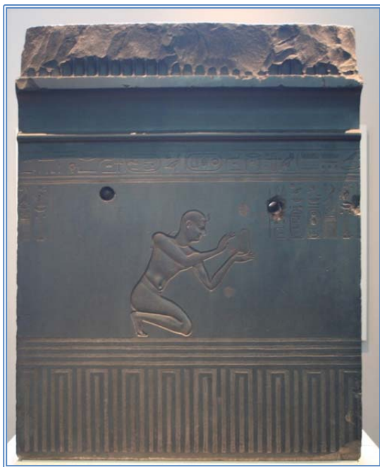
Figure 3. Basalt slab showing Nectanebo I with a bread offering. From Sais. London, British Museum, E 22.

possibly a son of Nepherites I, see De Meulenaere 1963), his official texts and the texts of his contemporaries affirm that he was singled out for kingship by deities from the “multitude” (the Naucratis Stela, l. 2; the Heracleion Stela, l. 2; cf.: Blöbaum 2006: 242 - 243; Brunner 1992: pls. 25 - 26; Yoyotte 2001) or from his “pairs” (text of the statue of Amenhapi, Cairo JE 47291, cf. Guerneur 2009: 186, comm. “z”). The king probably appreciated being legitimized through his own deeds showing divine support rather than any dynastic right to the throne. According to the historical stela from Hermopolis, the activities that brought him to power started specifically at Hermopolis in the time of “trouble” ( nšnj ) under the king “who was before him” (i.e., taking these words literally, in the short reign of Nepherites II, see Roeder 1954: 389). Hermopolis was perhaps the place where Nectanebo I’s ascent to royal rank was prophesized by the goddess Nekhmetawy (Klotz 2010: 247 - 251); and in due course this temple featured prominently in his building activities (fig. 3).