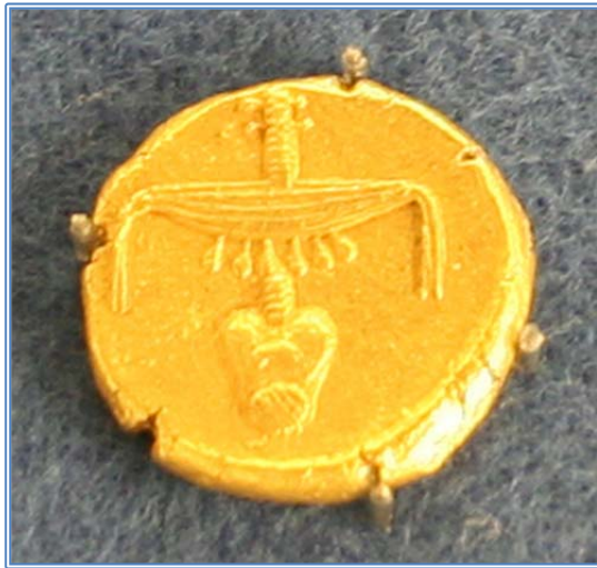
Figure 5. Stater of Nectanebo II (360 - 342 BC). Kestner Museum, Hannover.

The outcome of Teos' manipulations is a rather telltale indicator of the internal state of Egypt of the time: though radical and rapid, his actions were well-motivated by the military need. The resistance to Teos must have come from the corporations, into which Egyptian society had split since the beginning of the first millennium BCE, the priesthood and the military class being the most authoritative. To sum up, the rulers of the period (Nectanebos undoubtedly being the strongest figure ever since the end of the Saite time) were not able to overcome the decentralization of the Egyptian society.