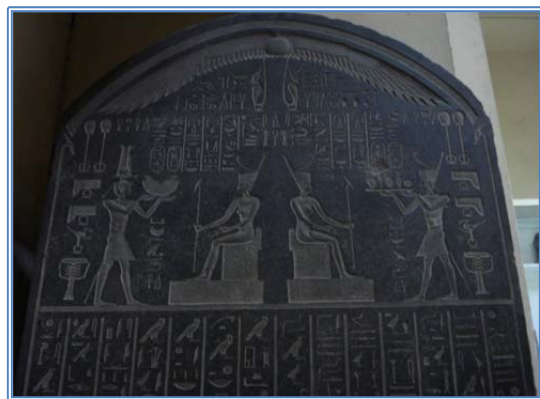
Figure 4. The Naucratis Stela. Cairo, Egyptian Museum, JE 34002.

function, once inherent for the Egyptian kingship, was by that time vested mostly in the priesthood, although the king ought to have been a beneficent donor to temples. Egypt became closely connected to the Greek world, including even a minor migration to its states (e.g., the Athenian inscriptions IG II 2 7968, 7969); symptomatically, the fourth century BCE was the time when Egypt started its own minting in order to pay its mercenaries from abroad (Daumas 1977). Trade with Greeks is attested in the Naucratis Stela (fig. 4) of Nectanebo I stipulating 10 percent tax on the Naucratis import to the benefit of the temple of Neith at Sais (Brunner 1992: pls. 25 - 26; Erman and Wilcken 1900; a copy of this act was found in Herakleion, another locality of the Western Delta, cf. Yoyotte 2001). However, Egypt's connections to the outside world hardly had any serious impact on the fundamentals of its own society: significantly, the coin minted for the payment of mercenaries was not put into circulation inside the country, and its economy remained basically natural. Inside the country the growth of the economy under Nectanebo II made it necessary to increase the number of "planners" ( snty , an administrative position once established by the Saites): instead of one there were three "planners" at Memphis, Hermopolis Magna, and Hermonthis (Yoyotte 1989: 76 - 77; fig. 5).