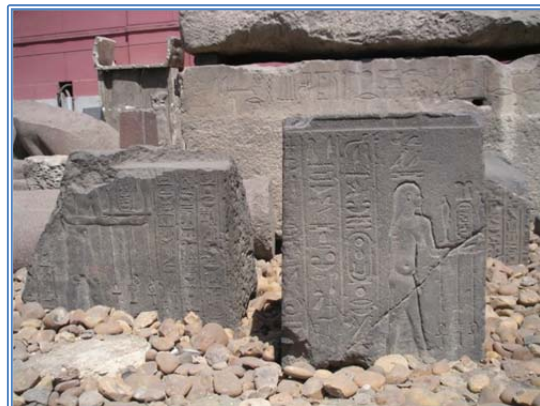
Figure 6. Wall-reliefs of Nectanebo II from Behbeit el-Hagar (on the left) and of Nectanebo I from Sebennytos (on right). Cairo, Egyptian Museum.

visible in the growth of the state income and the architectural boom under Nectanebo II (Kessler 1989: 231 - 232). The integration of the royal cult with the local cults of sacred animals, once established under Amasis (Kessler 1989: 225 - 229), took a more definite shape under Dynasty 30: the kings provided for the organization of special rearing places for sacred animals and their cemeteries; the most important was the Serapeum at Saqqara that was built and enlarged by Nectanebo I and II and housed their cult temple ( ts-dhnt = the East Temple of the Serapeum area) and perhaps burials (Arnold 1999: 111, 130; Kessler 1989: 124 - 130, 300). Evidence of the cult of the sacred bull Buchis (embodiment of the god Montu worshiped in the Theban region) appeared under Nectanebo II (the first Buchis bull was born in his Year 3, cf. Goldbrunner 2004: 102, 287 - 288).