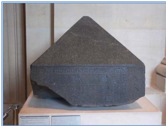
Figure 7. Top half of the naos dedicated to the god Shu. Nectanebo I. Louvre, D 37.

the attempt to parallel the rule of Dynasty 30 with a phase in Egypt's mythological history (in the text of the naos from el-Arish, see Schneider 2002) and to build a “theological rampart” against the foes of Egypt on its easternmost border (Virenque 2006). These interpretations, coherent as they may be, should not discount a significant mythological connotation: the Egyptian presumption that the demiurge established the temple shrines and installed in them gods at the moment of creation (Shabaqo Stone, ll. 59 - 60). Thus, the erection of naoi by the kings of Dynasty 30 must have been in line with their delineating the sacred space of temples, presenting them as (re)creators and organizers of not only the temples but to some extent the universe. An important feature of the temple building under the Late Dynastic Period were the mammisi , or “birth houses,” i.e., specific buildings located apart from the main temple complex and devoted to the birth of a child of a divine couple (Daumas 1958).