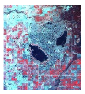
Fig. 10. A high altitude infrared photograph of the Ninepipe area. The Ninepipe pothole wetlands complex supports the highest density of pothole wetlands in western Montana.

The Ninepipe segment includes a rural section spanning the Ninepipe pothole wetlands complex and an urban section through the community of Ronan. The ecological, cultural and social issues involved in reconstructing the highway through the Ninepipe segment will be evaluated by the Tribes, MDT, and FHWA during the preparation of a Supplemental Environmental Impact Statement (SEIS). The three governments will consult with affected State and Federal agencies and have invited extensive public participation. The three governments have selected nine alternative lane configurations for the rural section. One of the more controversial lane configurations includes 6,870m (22,540ft) of raised parkway. Estimated unavoidable wetland impacts for the nine rural alternatives range from 7.2 to 10.1 hectares (17.91 to 24.90 acres).