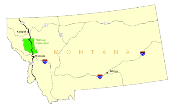
Fig.1. Location of the Flathead Indian Reservation and U.S. Highway 93.

Much of the FIR is rural and agricultural in nature but Reservation lands face accelerated development pressures due to the proximity of rapidly growing urban centers at Missoula and Kalispell, highway expansion, and the natural beauty and recreational opportunities in the area. Resident population is projected to increase by 50 percent during the period 1994 to 2025 with development expected to occur at a faster pace in the rural areas rather than the urban areas (CSKT 1996). The Tribes are concerned that an expanded highway will harm the rural character of the Flathead Reservation and adversely impact traditional cultural values.