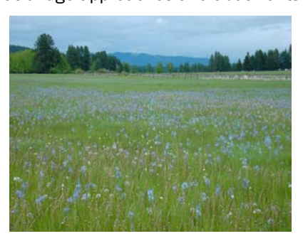
Fig. 3. This wetland is a Category I (FHWA and MDT 1996) wetland of special concern (CSKT 1999). The new lane configuration adds a northbound passing lane. The wetland will be avoided by shifting additional highway width away from the wetland and by reducing the standard ratio 6:1 side slopes to between 4:1 and 2:1 with guardrail. The wetland is Tribal Trust land and the Tribal Council has redesignated the wetland from agricultural use to wetlands mitigation. The wetland mitigation status of the site will protect and maintain habitat connectivity between wildlife crossing structures that will be constructed north and south of the wetland.