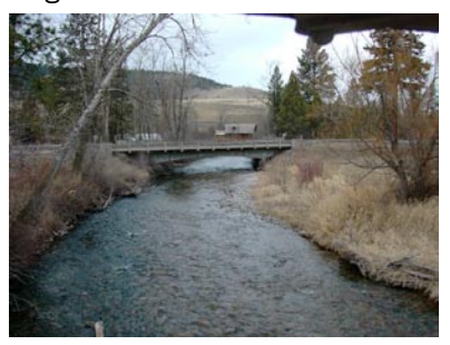
Fig. 4. The Jocko River is a "core area" for bull trout (Savelinus confluentus) recovery in Montana (Montana Bull Trout Scientific Group 1996) and is the focus of a Tribal wetland, riparian habitat and bull trout restoration program (CSKT 2000a). The existing crossing is a two-lane, approximately 30 m (100 ft) bridge lacking vertical clearance for large wildlife species passage. Buildings, septic systems, roads, bridge abutment fill, parking lots, and a horse corral occupy the floodplain. The lane configuration will be expanded from a two-lane to a three-lane. The new crossing will be a three-lane 120m (393ft) multi -span bridge with 4-5m (14-16ft) of vertical clearance. Bridge approaches will be constructed with vertical retaining walls to minimize fill in the floodplain. Buildings and the horse corral will be removed. The floodplain will be graded to original elevations and contours and planted with native wetland and riparian vegetation. Stormwater runoff from the bridge and roadway will be treated in vegetated bioswales and treatment wetlands.