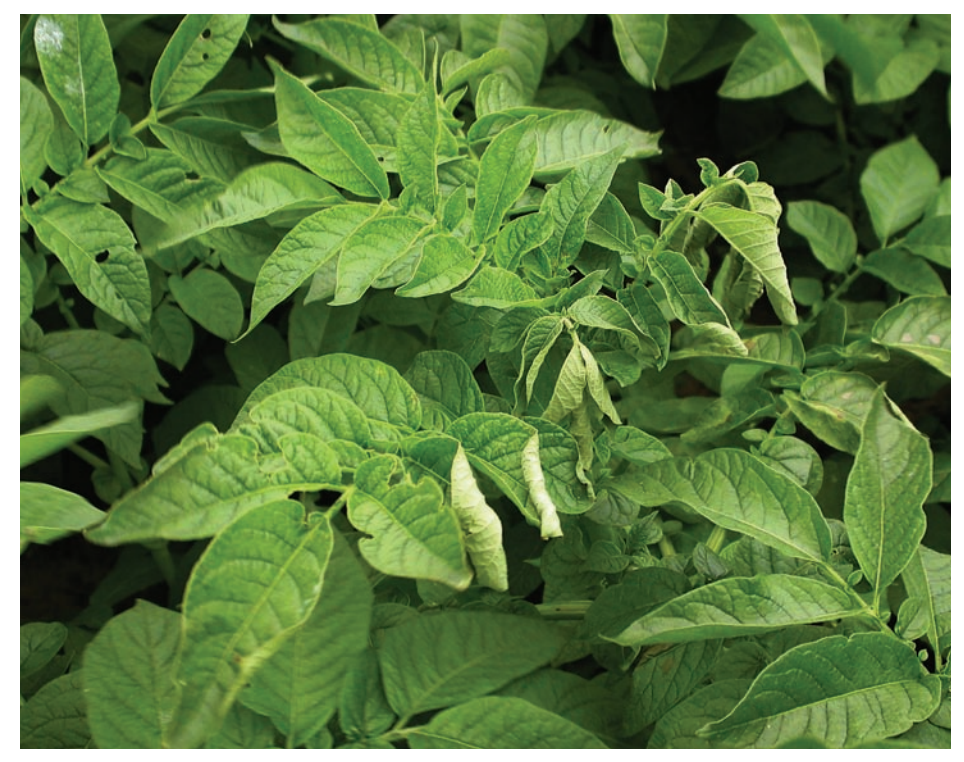
The initial symptoms of Erwinia early dying — a potato plant disease associated with lenticel rot — include leaf wilt in adequately irrigated fields.

Lenticel rot. We isolated Erwinia caro tovora subsp. carotovora (more recently called Pectobacterium carotovorum subsp.