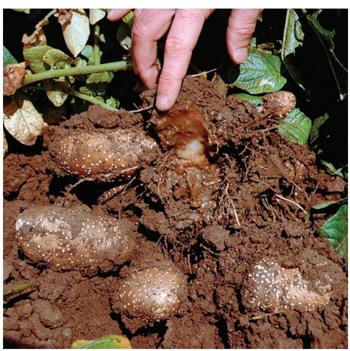
A rotten lower potato stem with Erwinia early dying disease (left) and a healthy stem (right).