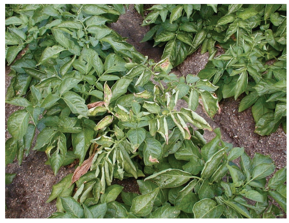
As Erwinia early dying progresses, leaves wilt further and die, sometimes killing the potato plant. When potatoes from these diseased plants are washed, bacteria can get into the lenticels and cause them to rot.

Erwinia early dying. Erwinia early dying is caused predominantly by Erwinia cartovora subsp. carotovora (Ecc) and to a lesser extent by Erwinia chrysanthemi (Echr). The causal agent of blackleg of potato, Erwinia carotovora subsp. atroseptica , is not associated with Erwinia early dying. Blackleg is characterized by a black to brown soft rot of the stems extending from the seed piece upward. Potato plants with blackleg are typically stunted and usually die prior to canopy closure in the San Joaquin Valley.