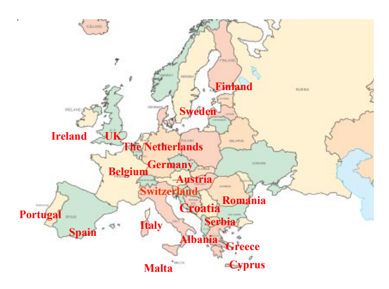
Figure 3. Distribution of European Master in Disaster Medicine students across Europe.

international EM organizations, Arnold and Della Corte included the following initiatives:<sup>3</sup>