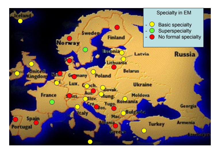
Figure 2. Status of recognition of the specialty of EM across the European continent.