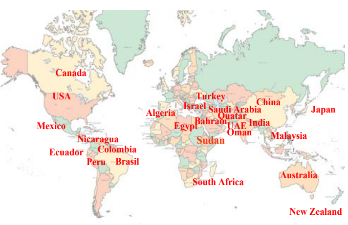
Figure 4. Distribution of European Master in Disaster Medicine students across the globe.

Address for Correspondence: Mark I. Langdorf, MD, MHPE, Department of Emergency Medicine, 101 The City Drive, Rte 128-01 Orange, CA 92868. Email: milangdo@uci.edu