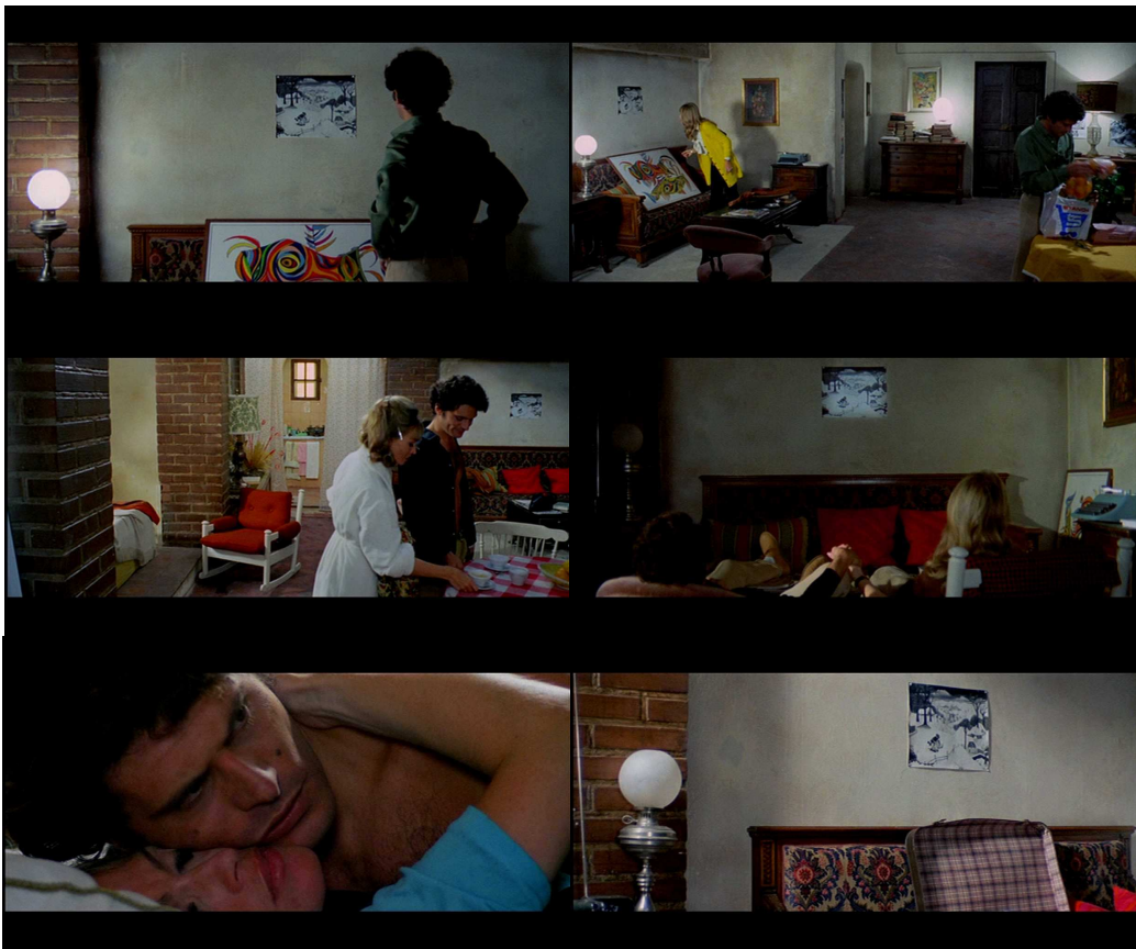
Fig. 12: The presence of the painting in Sam's apartment.

Carlo appropriately excuses himself from their apartment. Seconds after they are left alone with the painting, Sam's eyes drift away from Julia when the "La, la" motive sounds. The camera cuts away to the painting on the wall as she asks, "Do you really love me?" The music pauses as if waiting for Sam's reply. The direction of his attention is unmistakable, as his eyes are locked on the painting (Fig. 12, lower left) and his response begins with a disinterested, "Sure," followed by "How much time have we got?" After Julia replies, "How much what?" the "La, la" motive ushers the melody back in, and it is clear that Sam has chosen to pursue the killer over the