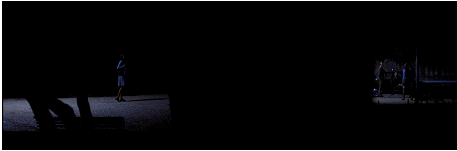
Fig. 15: Left, the young woman inspects the sound of a broken twig; Right, the woman approaches police officers as the killer peeks from behind cover.

feeling of being in the killer's shoes is furthered when the young woman comes across a trio of policemen. The camera ducks behind a tree to evade detection (Fig. 15, right) before peering around the trunk to view the outcome of this interaction. The audience's sense of dread is then deepened as the woman unknowingly leaves this chance of survival behind and apparently seals her fate. Argento simultaneously gives the audience the killer's vision and links them emotionally to the victim. As she treads alone through the darkness, the audience is acutely aware of the evil waiting to strike.