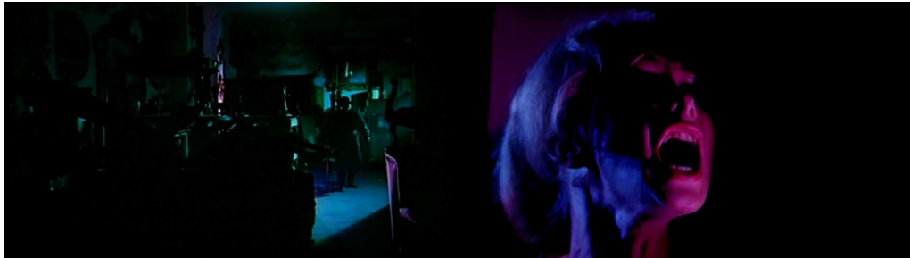
Fig. 7: Left, Killer is illuminated in a green light; Right, Nicole's final scream.

dissonant full orchestral horror cue when her death is inescapable and she lets out her final loudest scream drenched in red and blue lighting (Fig. 7). The music drops to silence again as the killer grabs Nicole from behind and chokes her screams into silence, reconnecting the audience with the victim's cries. The music returns on a high-pitched drone as the killer reveals a spiked iron glove, upon which winds, tremolo strings, and brass are layered in harsh harmonies in a controlled massive crescendo. As he prepares to attack a brief climactic whole tone gesture brings melodic motion to the layering of dissonances and peaks as he strikes...falling into silence after mortal contact is made, allowing the audience to hear her body drop from the killers arms to the floor.