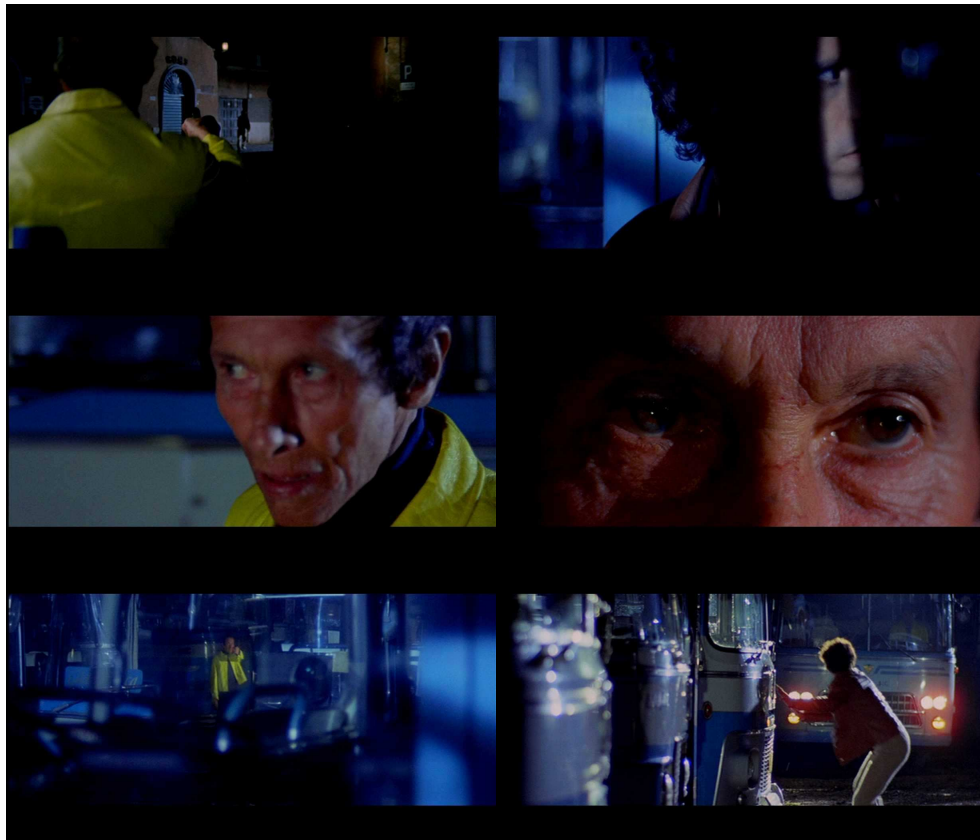
Fig. 14: The chase between Sam and Needles displays some of Vittorio Storaro and Dario Argento's most inventive camera work. Light and shadow are emphasized (upper right, lower right) and Needles' presence is both sinister and surreal. The predatory character paces about and appears suddenly in imaginatively unlikely fashions (lower left in a bus' rear view mirror, lower right in a bus' driver seat).

first close-up on his eyes scanning for his prey. Another thematically consistent returning motive is male groaning, which appears less frequently than the breathy feminine panting heard throughout the scene. This moaning masculine voice is heard as Needles paces intently around the bus yard, and later in the film during the second explicit murder scene as the central killer lies in wait for her victim to ascend a darkened stairway into a trap. The noise accompanies Needles as he licks his lips,