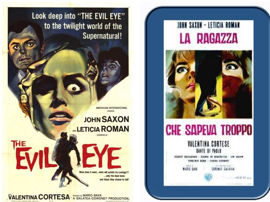
Fig. 1: Posters for La Ragazza Che Sapeva Troppo ; for international release the title was altered for respective nations, as is common in film. A poster for the American release, The Evil Eye , is on the left.

yet to be turned into spectacle. Bava's choice to shoot in black and white, and the title (translation "The Girl who Knew Too Much"), suggest the film is largely a nod to Hitchcock. Even the inclusion of giallo novels in the plot serves to aid "the Hitchcockian theme of the foreigner who can't make the authorities believe her story." 14 Thus, others argue that the first true giallo is Bava's 1964 film Sei donne per l'assassino (entitled Blood and Black Lace in America), which defined many of the trademarks of sexualized violence associated with the genre. 15