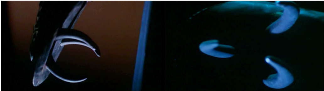
Fig. 8: Left, The killer unveils the iron glove; Right, Nicole's final vision.

eroticism as her breasts come deliberately closer into view in the reflection of a mirror. The blatant sexual imagery gives the scene a strong voyeuristic quality that underscores the emotions of the killer. The result is a conflict of empathy and excitement; the scene's sounds and images have made the victim's fear palpable to the audience, but the scene takes on an almost pornographic quality as the viewers know they have paid to see six models murdered.