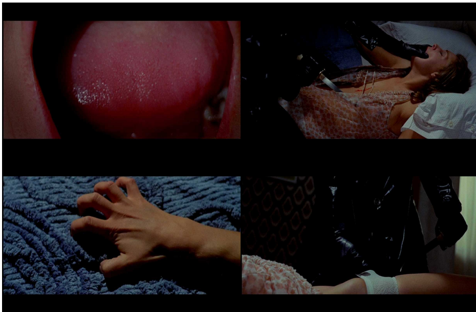
Fig. 17: The victim's final moments before death are displayed with overt sexuality. The killer slices open her nightgown (upper right) and tears off her panties before striking (lower right), and the knife and the mouth of the victim are portrayed with respective phallic and vaginal qualities (lower right, upper left). Gestures such as the victim's moaning and the clutching of the sheets (lower left) are ambiguously fearful and sexual as well.

Though the attack is brutal, it is not gory. All one sees of the strike is the motion of the knife and a splash of blood on the covers. Nevertheless, the extremity of the victim's violation makes the sequence particularly difficult to watch. The killer's actions are not in struggle, as the victim lies almost motionless in terror.