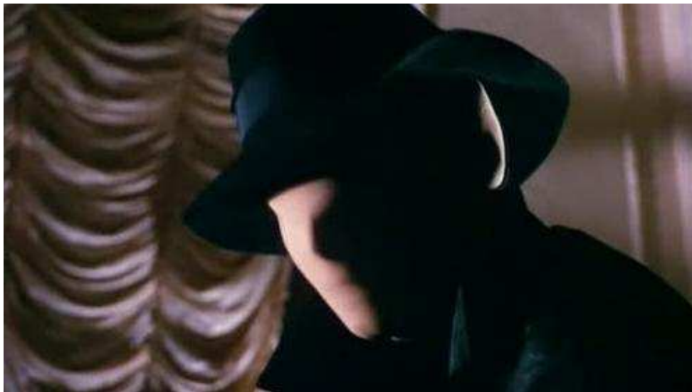
Fig. 2: Bava's faceless killer, sporting the iconic giallo fedora and trench coat.

and personal harm. Cloaked and featureless (Fig. 2), the killer becomes something inhuman, and the mortal consequences of the character's actions purely associate this being's image with death. As an alien, seemingly unstoppable force, the antagonist becomes death incarnate, and Bava's specific image resonates powerfully throughout future gialli . 18 The murder scenes rely on the strength of such a villain's presence, sonically and visually, to give credence to the victim's sense of danger and instill fear in the audience. 19 The image of the killer is surely cultivated so that the audience might identify with the terror of the victims. However, the excitation of sexual