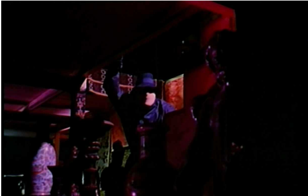
Fig. 6: The killer is revealed for the first time in the antique shop.

explicit film tricks give the sense of hallucination in complete musical silence. Nicole gets her first glimpse of the killer standing still at the other end of the shop, bathed in the slowly pulsing green light (Fig.7). When the light dims a second time, an attentive eye can spot a cut used to make the killer disappear before the light resurges. This cut on the same background imbues the killer with an unnatural ability to move, and brings Nicole's perception into question. As she stumbles through the dark trying to find her way out of the shop, the audience hears only her footsteps and whimpers among the clutter of falling antiques. Imminent danger increases as a spear misses her head by inches, followed by the killer grabbing her from behind and exposing her bra as she rips free from his/her grasp. As she fumbles with keys trying to escape, she is wholly vulnerable. The music re-enters dramatically in a classically