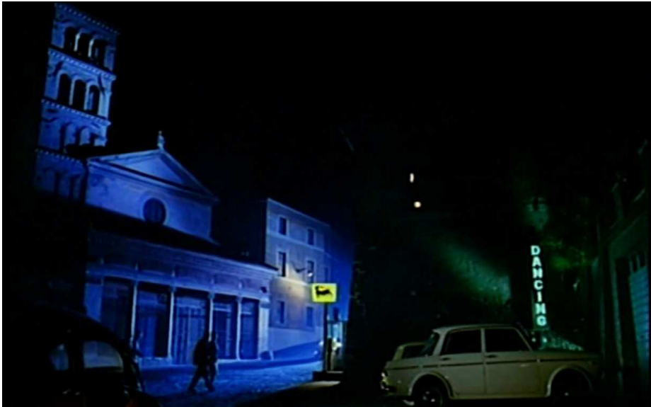
Fig. 5: Outside the antique shop.

dresser suddenly cuts off her path, causing her to run out of the frame in terror. The camera continues rolling to reveal the killer fully for the first time in the scene (Fig. 6). The camera cuts to Nicole running in fear through the dark shop, prompting a cut to her point of view.