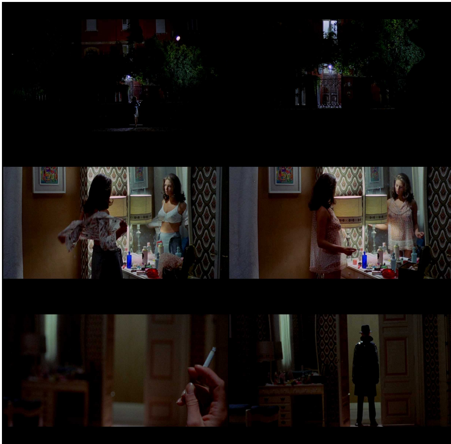
Fig. 16: The steadily deliberate amplification of the vulnerability and sexuality of the victim in the final events before the killer is revealed in the bedroom doorway.

of the masculine voice. This interaction of voices brings a dark and immediate meaning to the tubular bell stinger, cementing the shadowy figure as the harbinger of the woman's death. Argento pushes the eroticism of the scene further as the killer gazes upon the woman's outline passing in front of the second-story window. The figure is no longer merely a force of death, but a peeping tom invading the victim's sexual privacy (Fig. 16, top right).