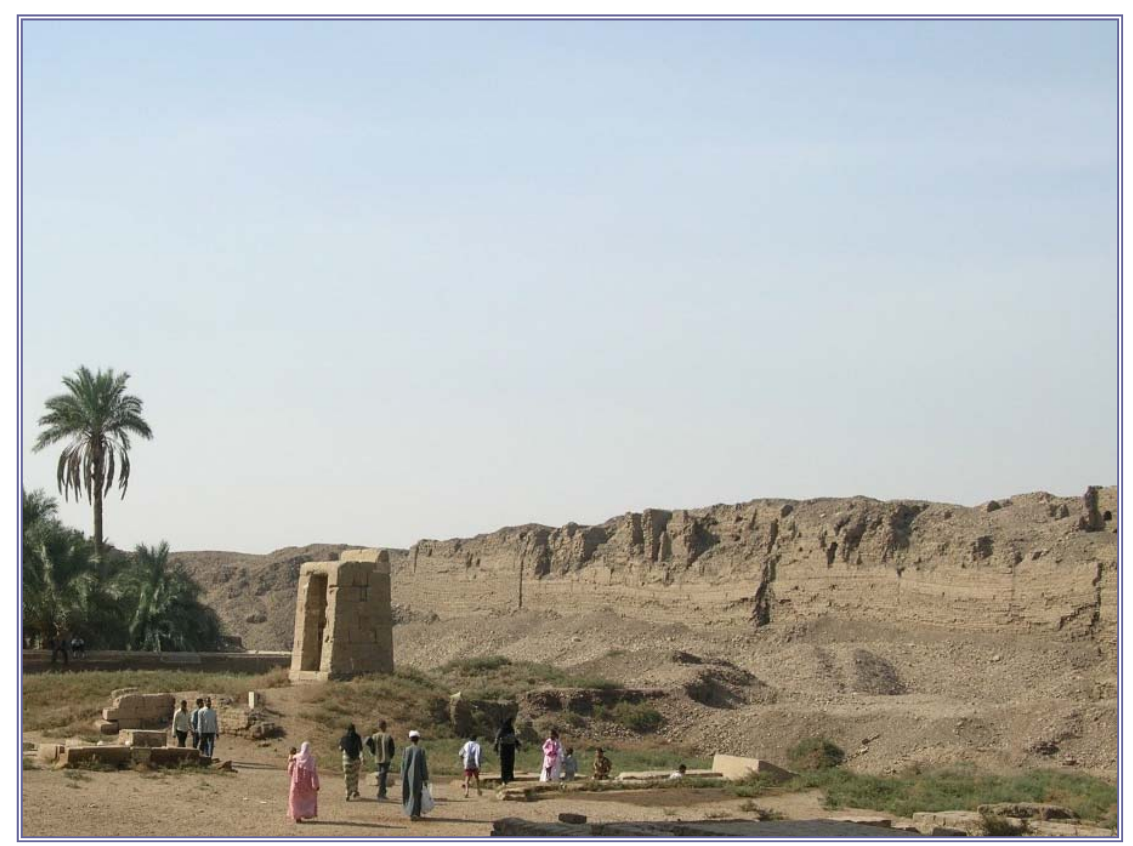
Figure 4. North temenos wall at Dendera showing concave and convex sections.

and mud-brick foundation walls dating to the reign of Senusret I at Tod, as well as the single spectacular example of the Satet Temple of Elephantine, the excavation of which revealed multiple iterations of mud-brick construction before an increasing number of stone architectural elements were added, starting in the 11th Dynasty and continuing through to the 18th Dynasty (Dreyer 1986: 11 - 36). Frequently, excavations have uncovered the temple enclosure walls contemporary with both early brick and stone temples, even when there remains little to no evidence of the original temple structure itself, as at Abydos and Medamud (Spencer 1979a: 62 - 63). Massive temple temenos walls became increasingly common through time, with many kings of the Late Period reconstructing enclosure walls, particularly with the expansion of temple precincts, as at Karnak and Elkab (Spencer 1979a: 64 - 82). These temenos walls were constructed in sections with either alternating convex and concave