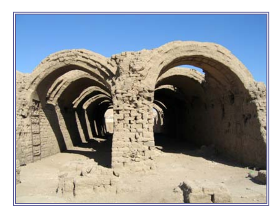
Figure 3. Vaulted storage magazines at the Ramesseum.

could be laid using the same bricks as were employed in the construction of walls or could be created with bricks made specifically for the job (fig. 3). In the latter case, the bricks are thinner and lighter and could even be wedge-shaped, rather than rectangular, to facilitate the shaping of the vault; specialized vaulting bricks often were scored with fingermarks when they were produced, a feature that increased the bonding of mortar to the