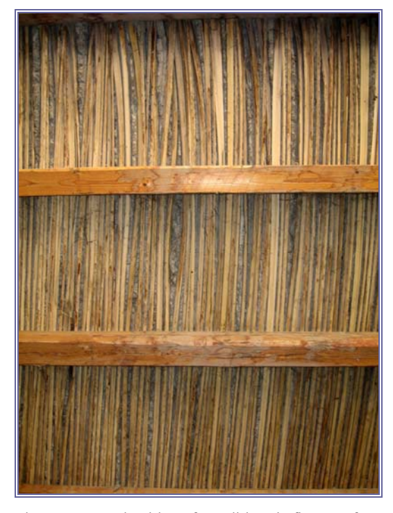
Figure 2. Underside of traditional flat roof at Hassan Fathy residence, Thebes.

3. Roof construction. Upon the completion of the walls, mud-brick buildings were roofed in one of two fashions: with flat roofs or with vaulted roofs. Flat roofs were created by laying wood cross-beams perpendicular to the face of the wall spanning the space from wall to wall or from wall to architrave (supported by columns), laying palm ribs, reeds or reed matting from beam to beam, then covering this layer with mud plaster (fig. 2; Arnold 2003: 47; Jéquier 1924: 289; van Beek and van Beek 2008: 287 - 310; Henein 1988: 42 - 43); this style of ceiling construction is essentially identical in execution to viga and latilla construction of the American Southwest. In the most important rooms at the palace of Malqata, the underside of the ceiling was plastered, filling in the spaces between the crossbeams, in order to create a smooth, level surface for painting (Tytus 1994: 13). Vaults