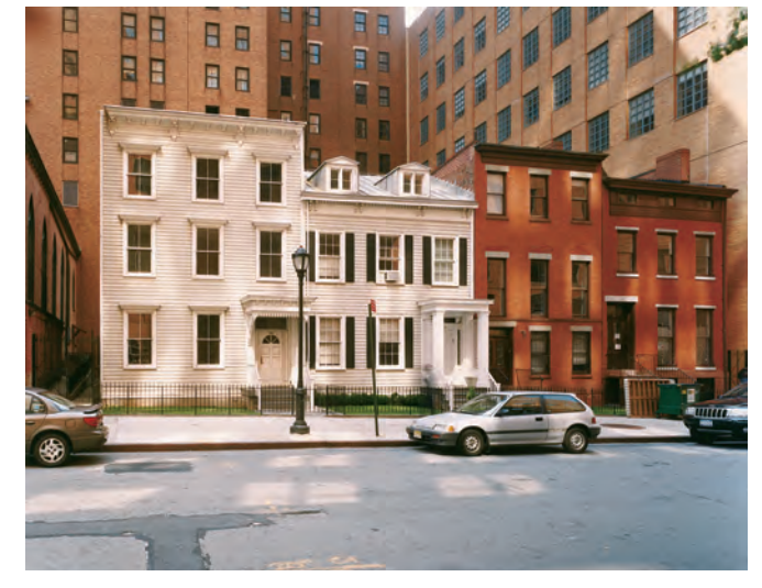
Milford / Bones, Skin and Spirit of a City

{\bf Opposite:}\ Hoyt\ Street, north\ to\ Fulton\ Street\ (through\ parking\ structure).