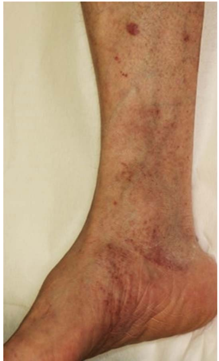
Figure 1. Multiple areas of purpura on the lower extremities.

normal: 11-121mg/dl), and IgE (566mg/dl, normal <170IU/ml), as well as positive antinuclear antibody (1:1280) and hypocomplementemia (C3: 27mg/dl, C4: 2mg/dl, CH50: <12 U/ml). Antibodies against