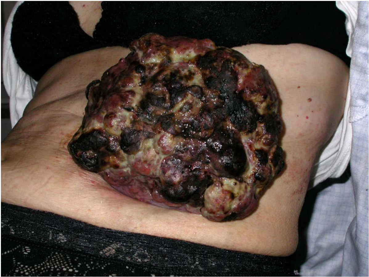
Figure 1. The giant vegetative melanoma of the left abdomen extending from the hypochondrium to mesogastrium.: The dimension of the tumor was 18 cm x 15 cm x 6 cm

According to the American Joint Committee on Cancer (AJCC) TNM staging system, the patient was classified as stage III C disease (pT4b,N1b,M0). The patient refused interferon therapy; adjuvant chemotherapy with dacarbazine at 800 mg/mq for 10 cycles was performed. After 6 years there has been no evidence of local or distant metastasis.