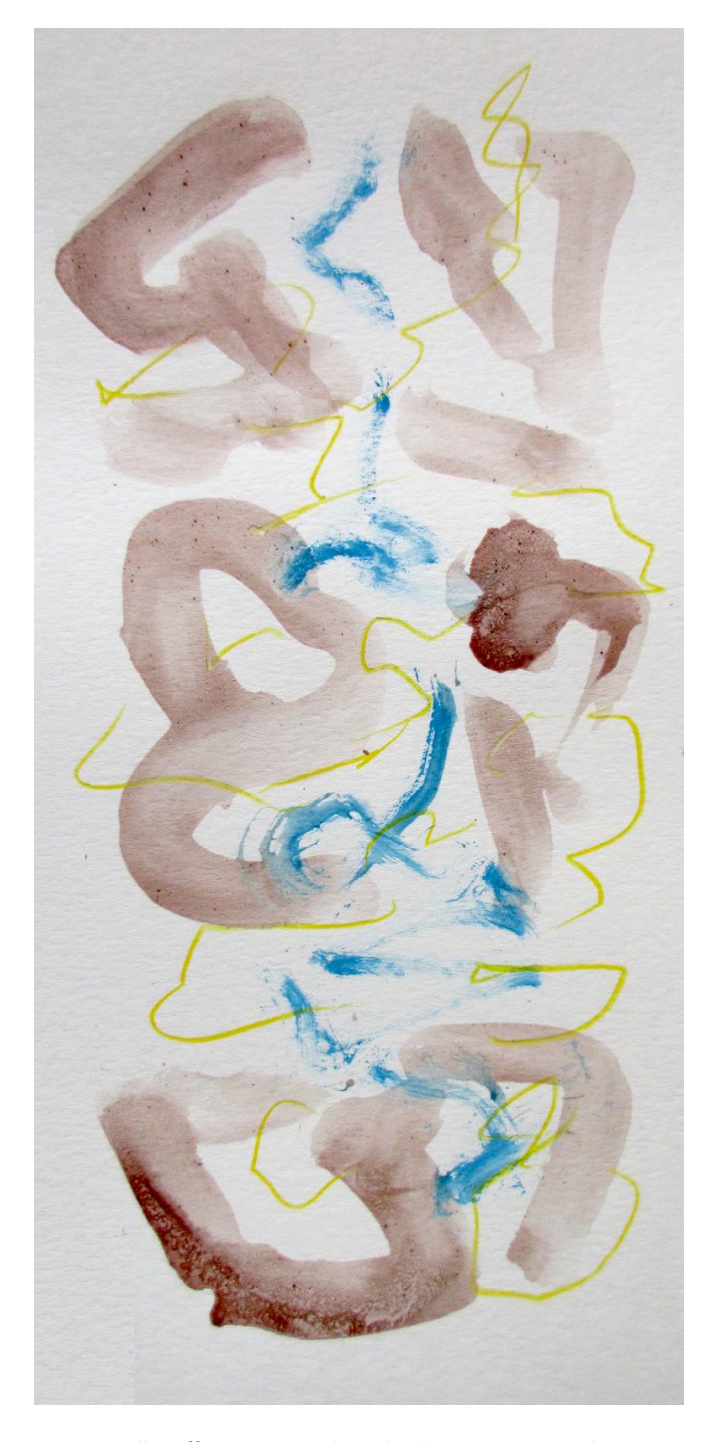
Buzzing Calligraffiti #3, 2020. Material: acai juice, sumi ink, blue watercolor, color pencils on paper. Dimension: 25.4x7.62cm.