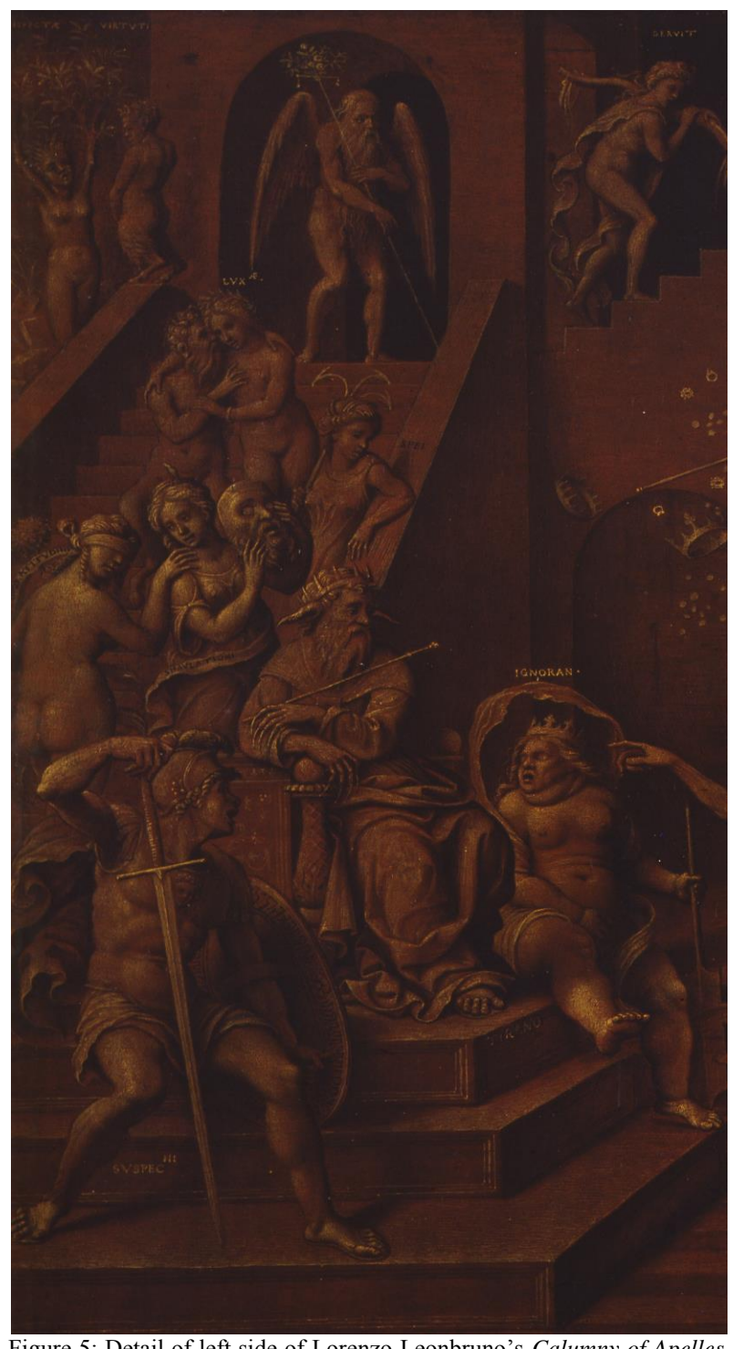
Figure 5: Detail of left side of Lorenzo Leonbruno's Calumny of Apelles , ca. 1525, Brera, Milan.