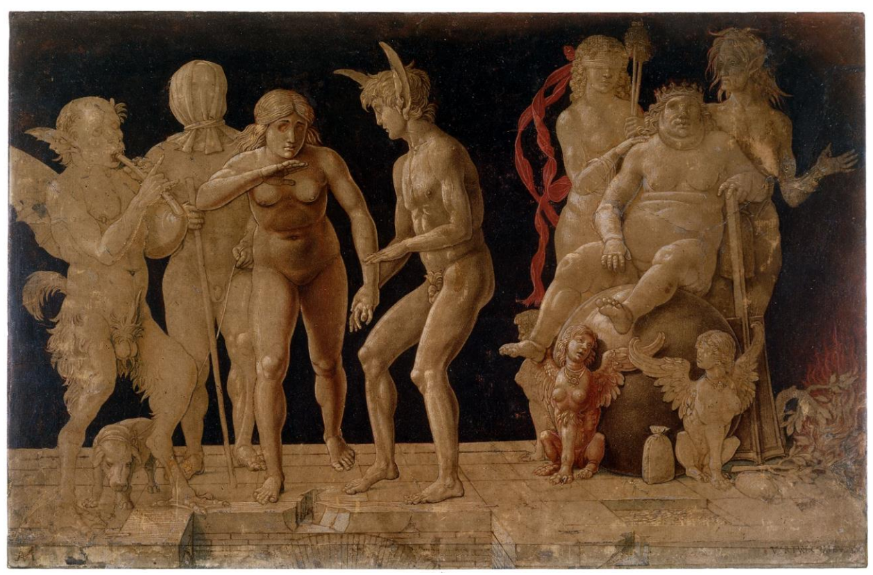
Figure 6: Andrea Mantegna, Virtus Combusta ; unfinished drawing (later a print by Giovanni Antonio da Brescia); ca. 1500, British Museum, London, England.