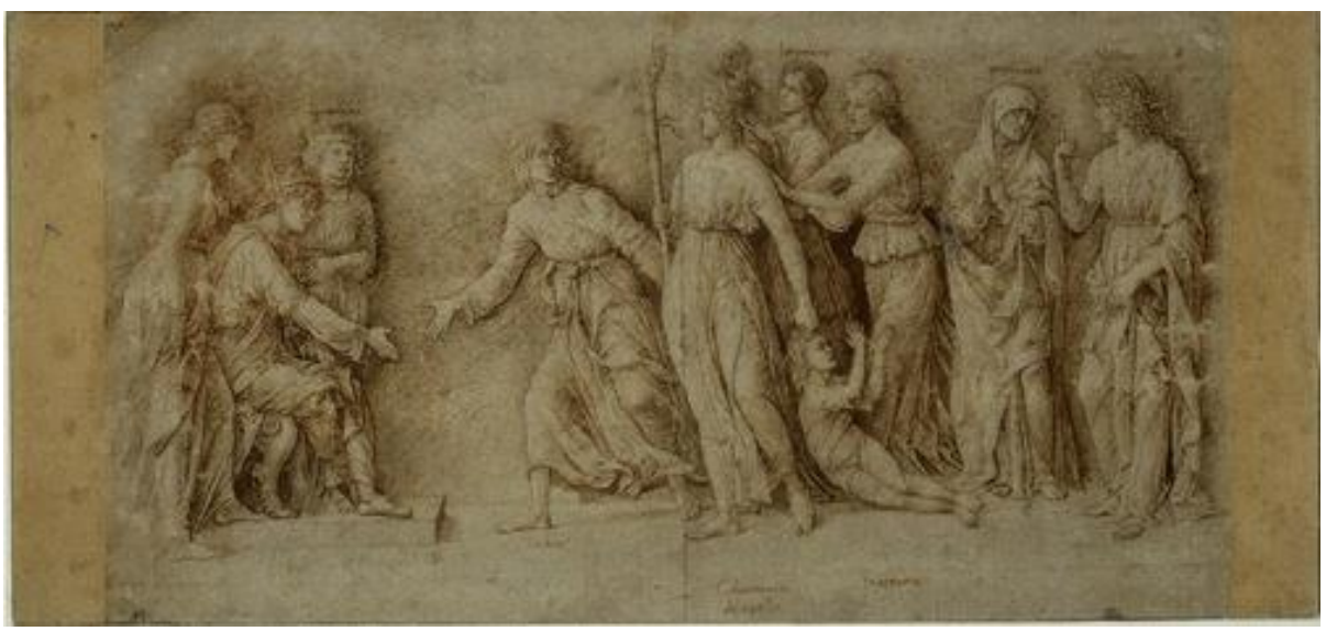
Figure 9: Andrea Mantegna, Calumny of Apelles; ink drawing, before 1506, British Museum, London.

Now, rather than the inexorable sweep of wisdom, moving toward liberation in the direction of reading, we have the determined, upstream swim of the avid pursuers of political corruption, heading toward its most callous expression, and away from any hope of freeing imprisoned virtue.