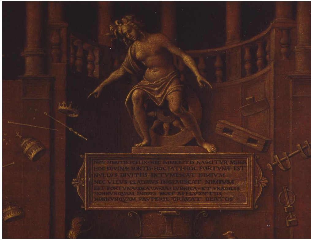
Figure 10: Detail of Fortune from Lorenzo Leonbruno's Calumny of Apelles , ca. 1525, Brera, Milan

Beneath her, an inscription describes her effects: