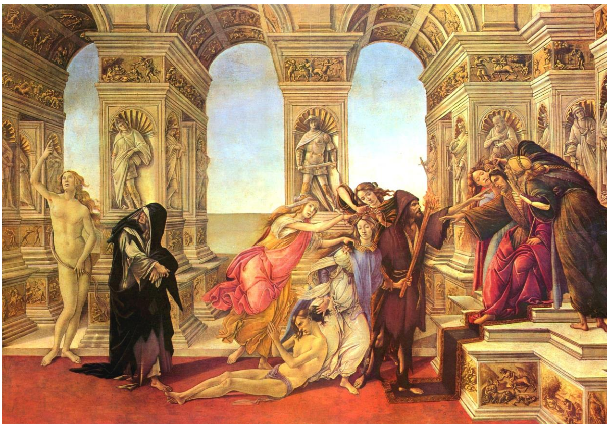
Figure 2: Sandro Botticelli, Calumny of Apelles, ca. 1495, Uffizi, Florence.

A similar sentiment is more succinctly phrased in the inscription running across the bottom of Leonbruno's painting: "If so in adversity then how in prosperity would Leonbruno paint Fortune?" These inscriptions remind viewers that the Calumny was understood as an imprecation against arbitrary exercises of power and a warning of the artist's ability, even his right , to represent that power as he experiences it.