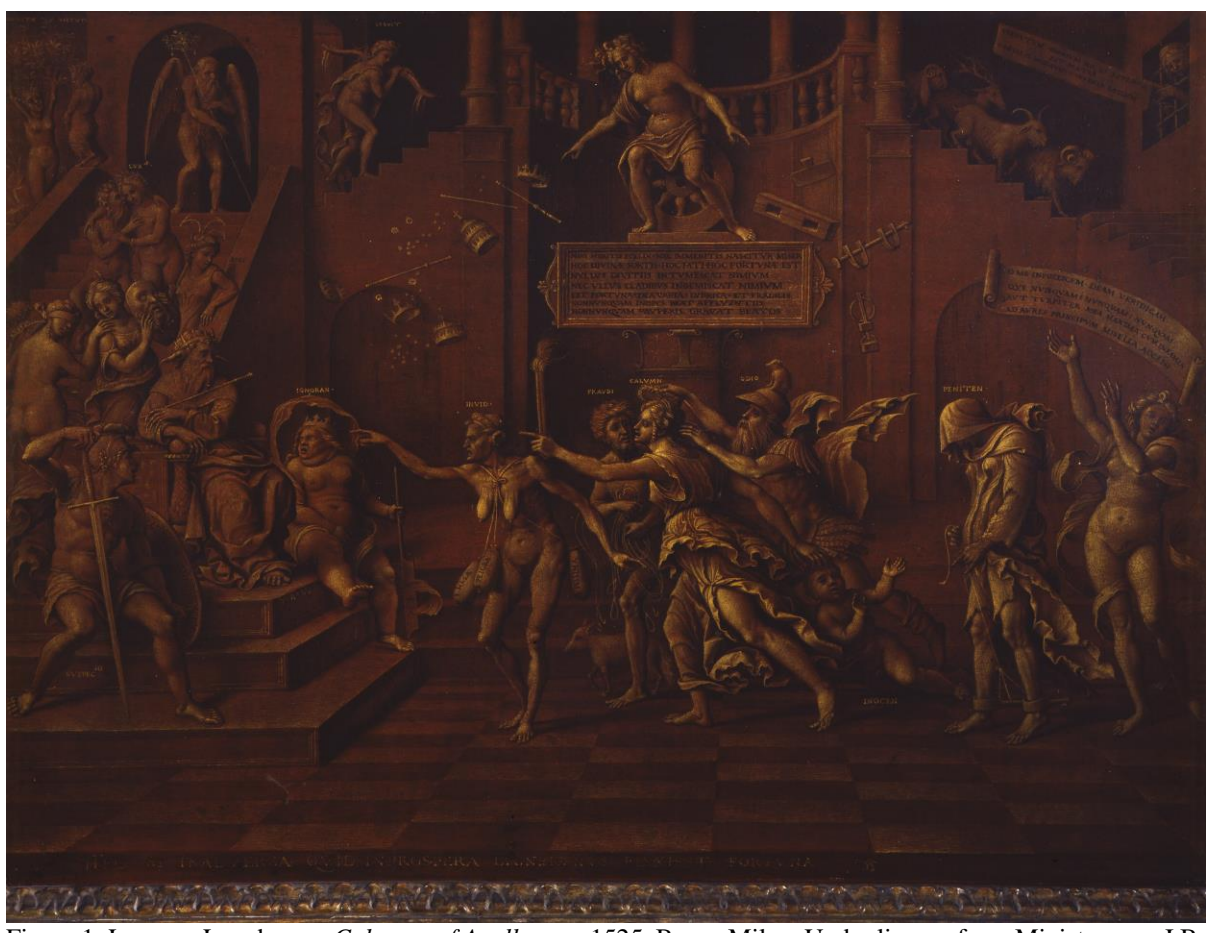
Figure 1: Lorenzo Leonbruno, Calumny of Apelles , ca, 1525, Brera, Milan.

Leonbruno layers three allegorical frameworks to create a depiction of his own relationship to Fortune: the first of these is the theme of the Calumny of Apelles, Lucian's ancient ekphrasis of a painted allegory of Slander, purportedly by Apelles; the second introduces specifically northern Italian visual sources, primarily Mantegna's imagery for Isabella d'Este; and the third (and most innovative) framing comprises a journey through Fortune's palace modeled on Antonio Fregoso's contemporary poem, the Dialogo di Fortuna . Given the painting's complexity—evident at even a cursory glance—I will work through it in sections to emerge with a description of its significance as a whole in relation to its composition and individual figures. Ultimately, these layers of meaning coalesce into a single pictorial purpose: Leonbruno manipulates allegory, space, and time to master Fortune by becoming her. In the process, he stabilizes his own identity in a moment of personal and political crisis, and offers a novel account of the author/artist's own power.