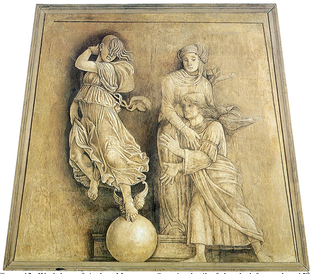
Figure 12: Workshop of Andrea Mantegna, Occasio , detail of detached fresco, late 15<sup>th</sup> century, Palazzo San Sebastiano, Mantua.

In the literary tradition, a self integrated across time is generally understood to require an epic model, one that imposes telos by driving the hero, not toward a ceaseless series of adventures, but toward a pietistic end.<sup>49</sup> But the idea that experience might condition the hero's ability to grasp Occasio developed first in Mantuan romance poetry, in Boiardo's Orlando innamorato .<sup>50</sup>