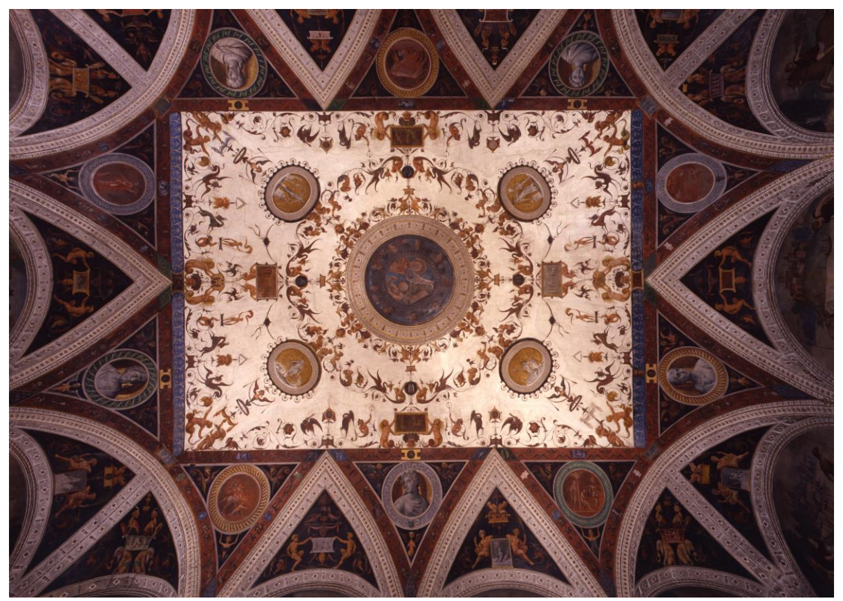
Figure 4: Lorenzo Leonbruno, Isabella d'Este's scalcheria, 1522, Mantova, Palazzo Ducale.

on minor projects and decorative work associated with her studiolo.8 He painted Isabella's scalcheria, the largest room in her private apartments in the corte vecchia of the eventual Palazzo Ducale, with a ceiling evidencing specifically Mantegnesque influences: a small oculus forms the focal point for a pattern of grotesque work bridging the entire vault (Figure 4).9