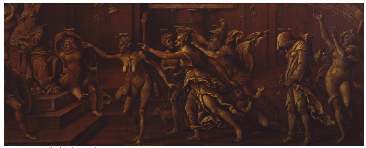
Figure 8: Detail of Calumny from Lorenzo Leonbruno's Calumny of Apelles, ca. 1525, Brera, Milan.

Thanks to the well-established fame of the studiolo paintings and their clear intention to signal Isabella d'Este's role as a great patron, Leonbruno's pointed quotation of the Minerva in association with a corrupt court and imprisoned virtue delivers a sharp indictment: that where Isabella d'Este's famed liberality created a fertile ground for art and artists, the contemporary court of Federico Gonzaga deliberately thwarts any such notion. "O miserable generation, O cruel age!" as Leonbruno's inscription plaintively wails. The court replaces the garden; vice displaces virtue. In a further emblematic reversal, Leonbruno derives his figure of Calumny from the form and pose of Mantegna's goddess Minerva (Figure 8).