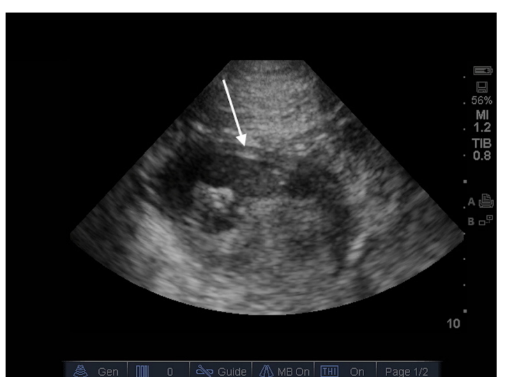
Figure 1. Bowel in transverse view demonstrating distention and wall edema

right upper quadrant tenderness, and voluntary guarding. Soon after the initial exam, the patient had a second episode of non-bloody, non-bilious vomiting for which he was given ondansetron, ranitidine, and one liter of 0.9% normal saline. A prompt point-of-care ultrasound (POCUS) demonstrated a normal gallbladder. However, it also showed free