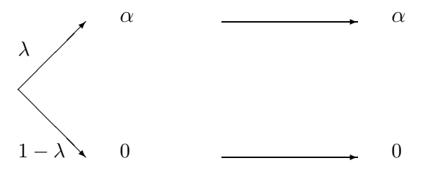
Period t+1 Period t+2 onward

Under the traditional net present value (NPV) model of investment, an IPP would make the investment in period t as long as the NPV of making the investment is greater than the NPV of not making the investment: