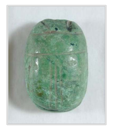
Figure 10. Malachite scarab amulet. Egypt, possibly New Kingdom.