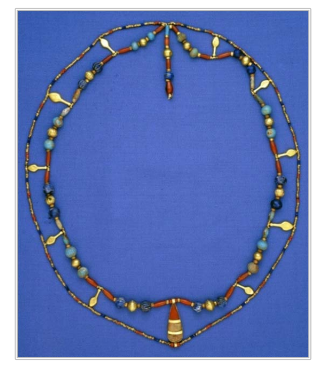
Figure 5. Originally loose jewelry elements restrung as a necklace, with amazonite (large bluish-green convex bicone and oblate spheroid beads—both smooth and ribbed), carnelian (large orangey red convex bicone and tiny cylindrical beads), lapis lazuli (large dark blue oblate spheroid beads—both smooth and ribbed), dark blue glass (large oblate spheroid and tiny cylindrical beads replacing lapis lazuli in the design), and gold. Thebes, Tomb of the Three Princesses, Dynasty 18.