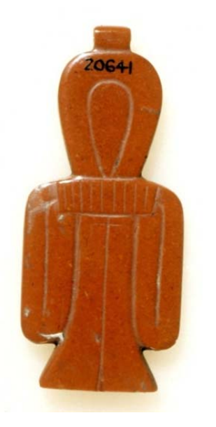
Figure 17. Red jasper girdle-tie-of-Isis amulet. Egypt, New Kingdom.