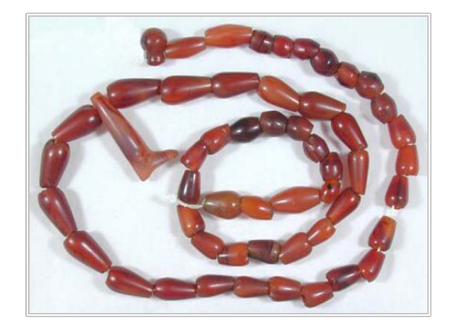
Figure 14. String of convex bicone and drop beads and central "leg" amulet of carnelian with inhomogeneous coloring. Egypt, Dynasty 6.