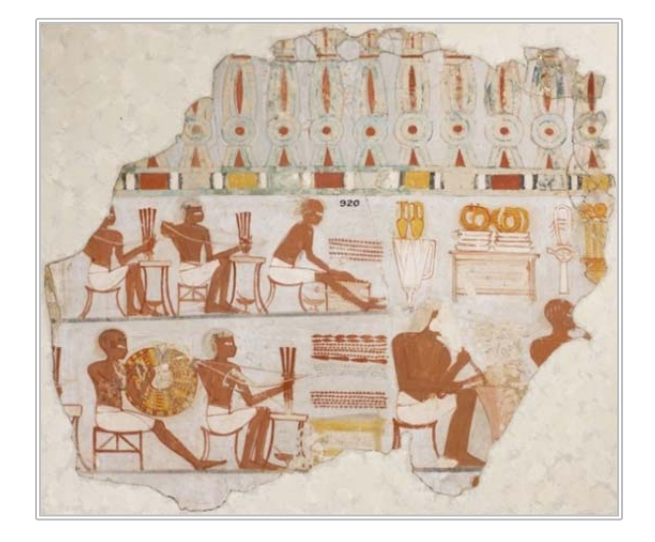
Figure 27. Carnelian bead-manufacturing scene from tomb of Sobekhotep at Thebes, Dynasty 18.