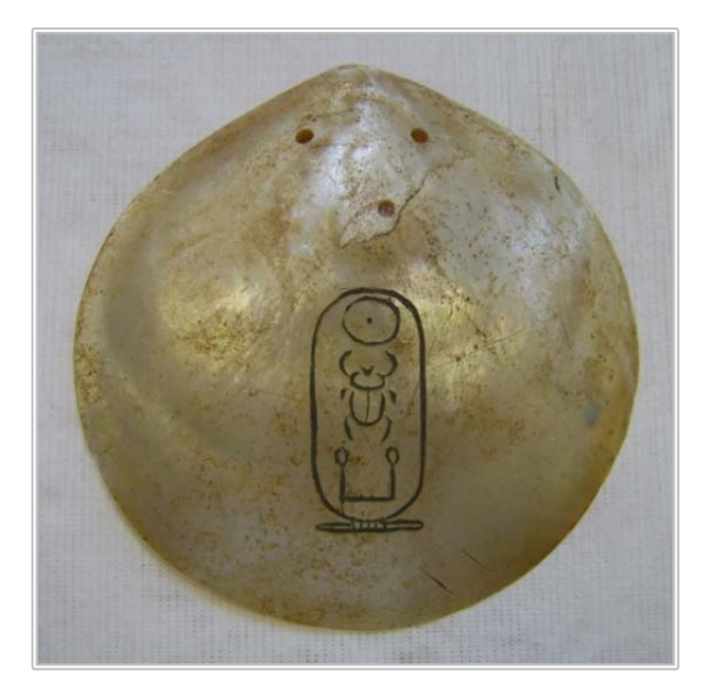
Figure 25. Mother-of-pearl shell pendant or amulet inscribed with cartouche of Senusret I. Egypt, Dynasty 12.

The raw gemstones, always occurring in relatively small pieces, would have been carried from the mines on the backs of men or pack animals (probably donkeys). They were brought to workshops where they were laboriously fashioned into their many forms, with beads being the most common. During the Dynastic Period, the Egyptians had no abrasive material harder than the hardest gemstones they worked, which were the many quartz varieties with a Mohs hardness of 7. It is often claimed that the Egyptians used emery (a granular combination of corundum and iron oxide, Mohs = 8-9) as an abrasive, but there is no credible archaeological evidence for this. What the Egyptians surely did use, and which they had in great abundance, was silica (SiO<sub>2</sub>) in its many forms, most notably: massive microcrystalline quartz (chert or flint), massive macrocrystalline quartz (silicified