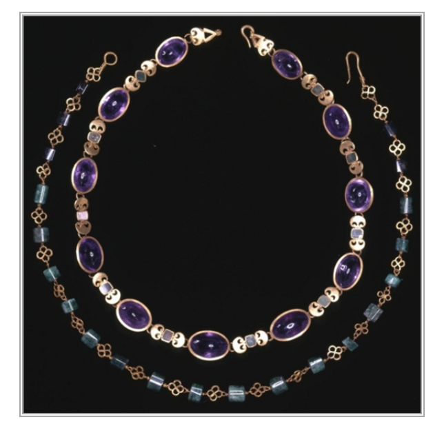
Figure 2. Necklaces, possibly from Egypt, similar to those depicted in Figure 28 mummy portrait. Inner: gold and amethyst cabochons. Early third century CE, Roman Period. Outer: gold and emerald beads (hexagonal crystal segments). Second century CE, Roman Period.