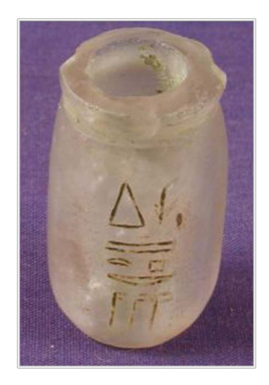
Figure 13. Rock crystal (colorless quartz) cosmetic jar with hieroglyphic inscription: "offering given by the king" and "towards the gods." Egypt, possibly Middle Kingdom.