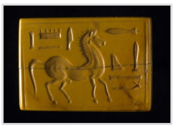
Figure 19. Yellow jasper plaque of Amenhotep II inscribed with figure of a horse and hieroglyphs for "Amun," "great," "majesty," and "he is strong." Egypt, Dynasty 18.

Egyptological literature that carnelian pebbles are commonly found in the wadi gravels of the Eastern Desert (e.g., Lucas 1962: 391), but this is not true. The claim is based on an early misidentification of ordinary (non-chalcedonic) quartz pebbles with reddish (iron oxide) coloring as carnelian. However,