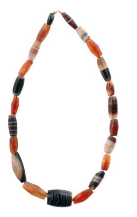
Figure 15. String of convex bicone and barrel beads of common agate (black/dark gray and white wavy banding), onyx (black/dark gray and white planar banding), sardonyx (reddish brown and white planar banding), and carnelian (solid orangey-red). Tell Dafana, Egypt, Roman Period.