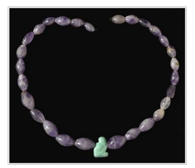
Figure 3. Necklace with convex bicone beads of amethyst and a central amazonite Ba bird amulet. Egypt, Middle Kingdom.

down and recast, but the gemstones were merely reused, although perhaps in a recut form. Consequently, a significant portion of the gemstones used in any given period was probably recycled from earlier times.