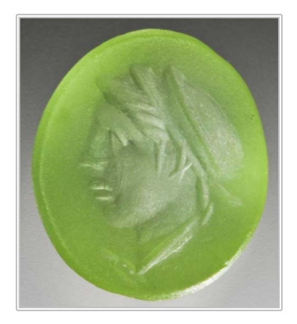
Figure 12. Peridot ring stone carved with male head, possibly Ptolemy XII. Egypt, mid-first century BCE, Ptolemaic Period.

and Bloxam 2010). Most of the other rock and mineral gemstones in Table 1 (common agate, common calcite and Iceland spar, red garnet, hematite, jasper, malachite, common microcline, muscovite mica, milky quartz, rock crystal, and silicified wood) are known to occur in the Eastern Desert or Sinai and these regions are probably where they were obtained. Egypt's Western Desert is another possible source for silicified wood and it certainly supplied the famous Libyan desert glass (de Michele 1997, 1998). For the latter, the only known example of its use is for the scarab at the center of a famous pectoral belonging to king Tutankhamen (Cairo Museum JE 61884). A few of the Dynastic rock and mineral gemstones in Table 1 (nephrite, onyx, and sardonyx) are not known to occur in Egypt, but it is conceivable that they are