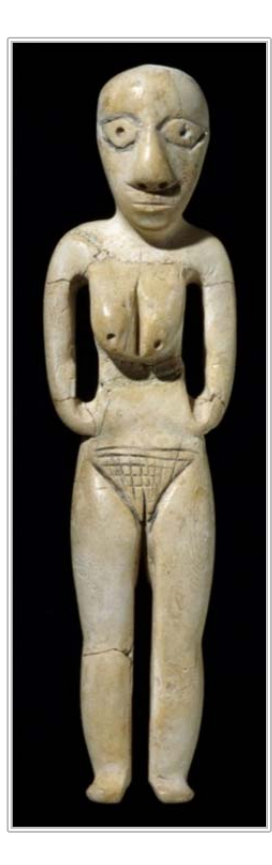
Figure 21. Hippopotamus ivory figure of a woman. El-Badari, Egypt, Predynastic Badarian Period.