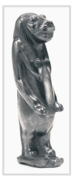
Figure 9. Metallic hematite Taweret figure. Egypt, Dynasty 26.

to some degree what was then popular in this Mediterranean emporium (Harrell 2011).