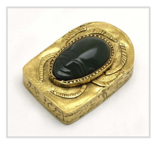
Figure 18. Dark green jasper heart-scarab amulet set in hollow sheet-gold plinth. Hieroglyphic inscriptions from Book of the Dead , Chapter 30B, on sides and bottom. Qurna, Egypt, Second Intermediate Period (reign of Sobekemsaf II, Dynasty 17).

Egyptological literature that carnelian pebbles are commonly found in the wadi gravels of the Eastern Desert (e.g., Lucas 1962: 391), but this is not true. The claim is based on an early misidentification of ordinary (non-chalcedonic) quartz pebbles with reddish (iron oxide) coloring as carnelian. However,