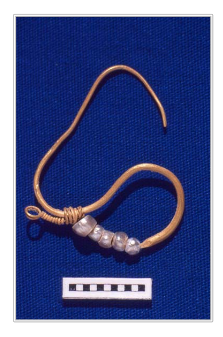
Figure 23. Gold wire and pearl earring. Berenike, Egypt, Roman Period, second century CE.

crystals in the placer deposits of the seasonally dry Nile River channels (Harrell 2010: 81 - 82). Although rocks with red garnet are relatively common in the Eastern Desert and Sinai, the crystals found so far are all of either poor quality or minute size.