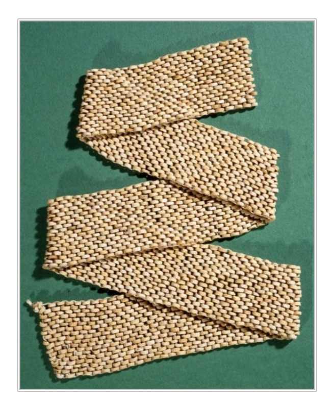
Figure 24. Shell-bead girdle or belt. El-Mustagidda, Egypt, Pan-grave culture, Second Intermediate Period.

and trenches, but those for emerald and turquoise also involved underground excavations like those found in the ancient gold workings.