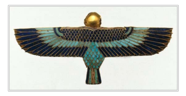
Figure 6. Amulet in form of Ba bird with cloisonné inlays of lapis lazuli (dark blue), turquoise (light blue), and, on shoulder and tail, brownish-gray steatite in gold setting. Possibly from Saqqara, Late or Ptolemaic Period.

Chapters 159 - 160 (Harris 1961: 112 - 116, 123 - 124, 130). Additional common associations between amulet and stone type are sub-metallic hematite for the "headrest" amulet (see fig. 8), and obsidian for the "two fingers" amulet (Andrews 1994: 104). Similarly colored materials were sometimes substituted for these gemstones.