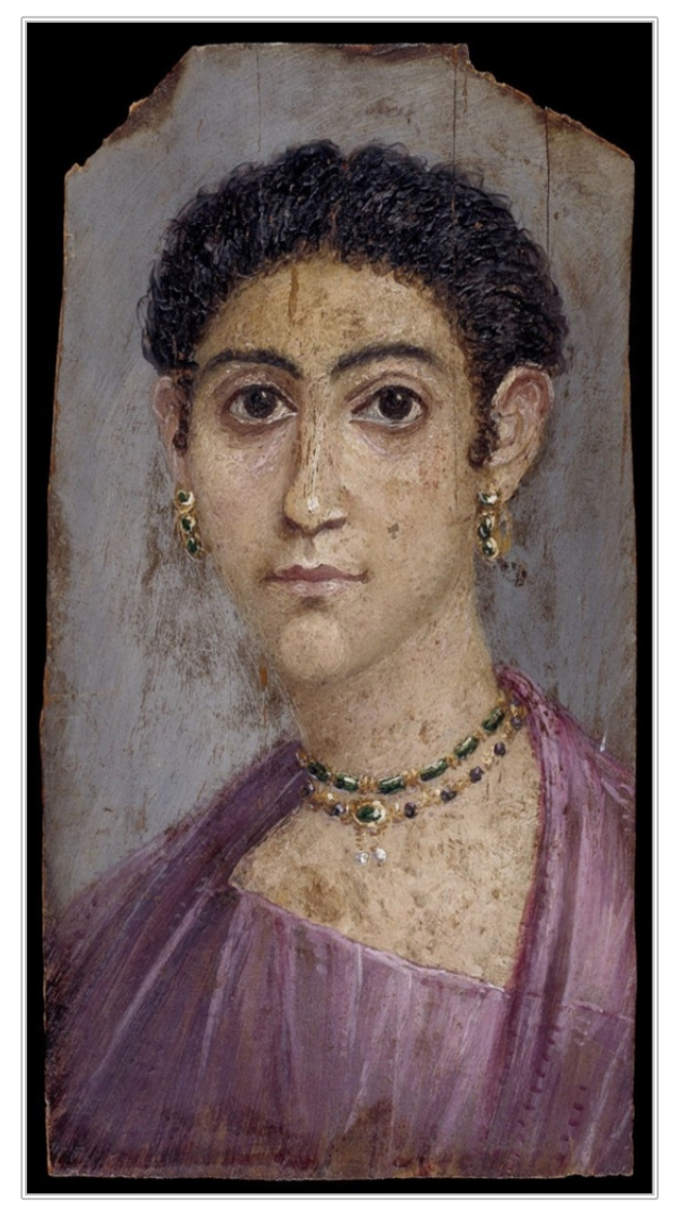
Figure 28. Mummy portrait of woman wearing earrings and inner necklace of emerald and gold, and outer necklace of amethyst and gold with two pearls dangling from the large emerald cabochon in center. (Note that the two necklaces resemble those in Figure 2.) Hawara, Egypt, Roman Period, early second century CE.