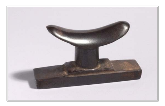
Figure 8. Submetallic hematite headrest amulet. Egypt, Late Period.