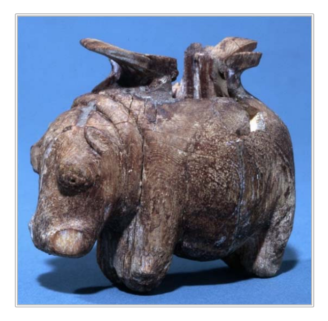
Figure 22. Elephant-ivory cosmetic jar in the form of a hippopotamus. El-Mustagidda, Egypt, Predynastic Badarian Period.