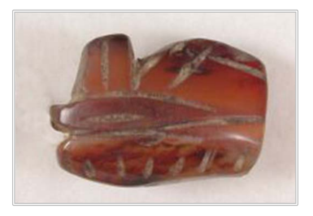
Figure 20. Amber Taweret amulet. El-Amarna, Dynasty 18.