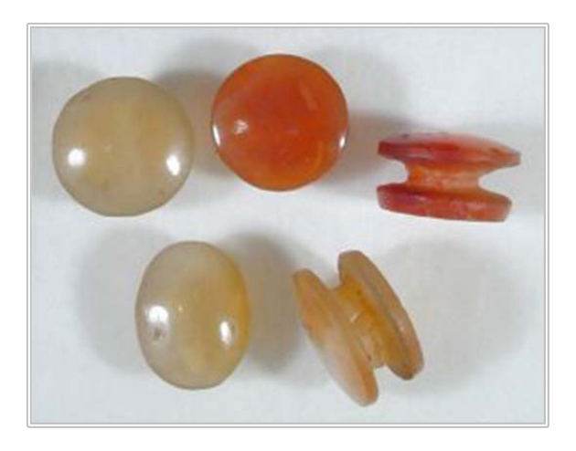
Figure 16. Chalcedony buttons of both the common (white) and carnelian (orangey-red) varieties. Egypt, possibly Late Period.

present and their deposits have merely been overlooked. Coral, pearl, mother-of-pearl and other mollusc shells, and tortoise shell undoubtedly came from the Mediterranean or Red Sea, and ostrich shell (Phillips 2000) and hippopotamus ivory (Krzyszkowska and Morkot 2000) would have come from Egypt's Eastern Desert and Nile Valley, respectively. In addition to lapis lazuli, gemstones imported from distant sources included amber probably from the Baltic region of northern Europe, obsidian (Zarins 1989; Bavay et al. 2000) and elephant ivory (Krzyszkowska and Morkot 2000) from the southern Red Sea region, and, during the late Ptolemaic and Roman Periods, a variety of gemstones (mostly aquamarine, red garnet, onyx, sapphire, and sardonyx) from India and Sri Lanka.