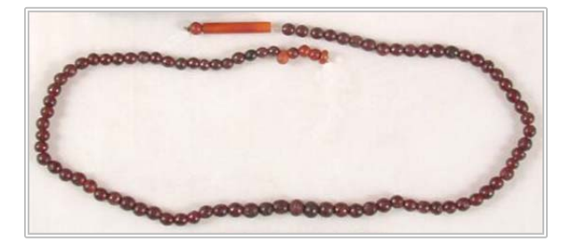
Figure 7. String of spherical beads of red garnet and, at each end, beads of carnelian (orangey red). Egypt, possibly Middle Kingdom.