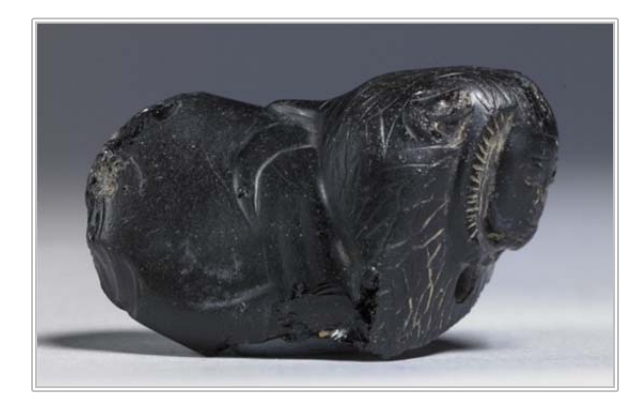
Figure 11. Obsidian sphinx figure, possibly of Amenemhat III. Egypt, Dynasty 12.

and Bloxam 2010). Most of the other rock and mineral gemstones in Table 1 (common agate, common calcite and Iceland spar, red garnet, hematite, jasper, malachite, common microcline, muscovite mica, milky quartz, rock crystal, and silicified wood) are known to occur in the Eastern Desert or Sinai and these regions are probably where they were obtained. Egypt's Western Desert is another possible source for silicified wood and it certainly supplied the famous Libyan desert glass (de Michele 1997, 1998). For the latter, the only known example of its use is for the scarab at the center of a famous pectoral belonging to king Tutankhamen (Cairo Museum JE 61884). A few of the Dynastic rock and mineral gemstones in Table 1 (nephrite, onyx, and sardonyx) are not known to occur in Egypt, but it is conceivable that they are