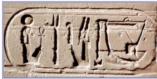
Figure 7. Prenomen cartouche of Ramesses IV annexed by Ramesses VI from a bandeau text inside the "cachette court" at Karnak. The horizontal lines are from the dado pattern of the original 19 th Dynasty wall-decoration over which Ramesses IV carved the bandeau text.

there were discrete periods that account for most of the New Kingdom examples.