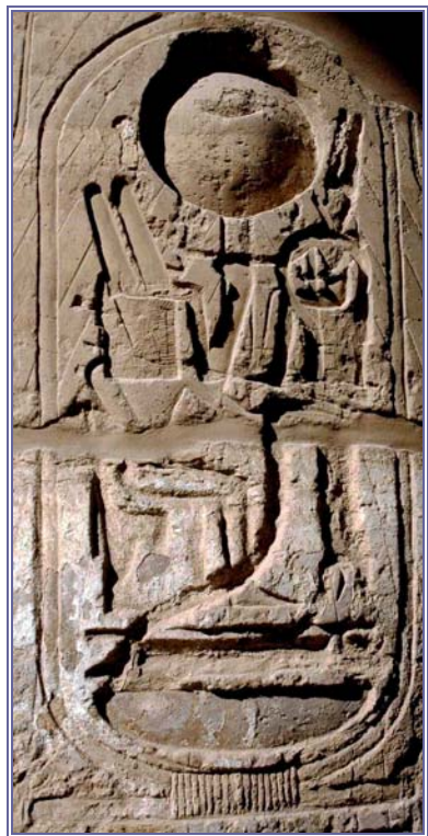
Figure 8. Cartouche of Ramesses IV usurped by Ramesses VI. Three versions are detectable. Ramesses IV first altered the writing of his name before Ramesses VI re-inscribed it. Plaster used to mask one of the suppressed versions is still visible.