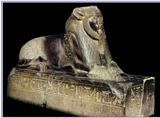
Figure 10. Sphinx of Amenemhet III (CG 394), re-inscribed three times by Ramesses II (on base), by Merenptah (on shoulder), and by Psusennes I (chest between forelegs).

Amenemhet's staturary (Cardon 1979) and wall inscriptions. At the beginning of the 20 th Dynasty, Sethnakhte usurped the royal tomb (KV 14) prepared for Tauseret in the Valley of the Kings (Altenmüller 1983, 1992). Many of the bandeau and marginal inscriptions carved for Ramesses III are cut in extraordinarily deep sunken relief, often more than 10 cm in depth (fig. 9). In the wake of the 19 th Dynasty's proclivity for usurpation, one cannot help wondering if this was meant to deter the practice. Ramesses VI frequently usurped monumental inscriptions of Ramesses IV and Ramesses V (see figs. 6 - 8; Brand 2007: 53, figs. 5.5 - 5.8; Peden 1989, 1994).