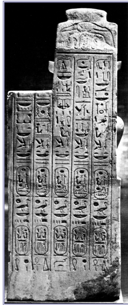
Figure 12. Left: Luxor Museum J 155, a dyad of Amenhotep III and Sobek appropriated by Ramesses II, who inscribed the dorsal face (right) with multiple columns of formulaic texts and titulary arranged for maximum visual impact.

titulary were added to the shoulders, chest, belts, back pillars, and thrones of statues, as well as to the fronts, sides, and upper surfaces of their bases. The large, flat surfaces on the backs of some dyads, triads, and colossi were used to present multiple columns of formulaic texts containing royal and divine titularies, carefully aligned for maximum visual impact (fig. 12; and see, for example, two dyads of Amun and Mut in the Colonnade Hall of Luxor Temple, and a third in the Luxor Museum [J 188]; Epigraphic Survey 1998: pls. 214 - 219).