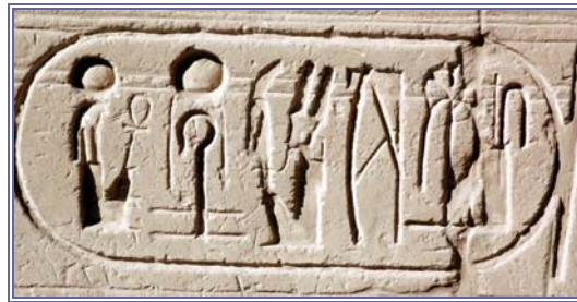
Figure 6. Nomen cartouche of Ramesses IV usurped by Ramesses VI from a bandeau text inside the "cachette court" at Karnak. The original version would have been suppressed with plaster before the final one was carved over it.

Royal usurpation of monuments was rare prior to the New Kingdom, when by far the largest number of cases occurred. Nor was the practice engaged in continuously between the Eighteenth and Twentieth Dynasties. Rather,