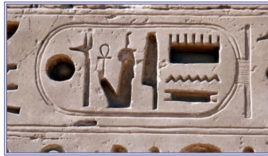
Figure 9. Cartouche of Ramesses III from bandeau inscription on east face of Karnak's third pylon. It is tempting to view this deep carving as a deterrent to usurpation and damnatio memoriae .