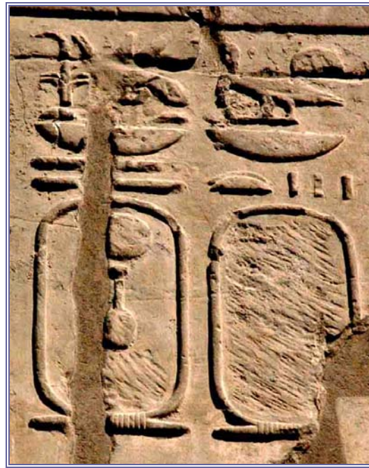
Figure 14. Defaced cartouches of Shabaqo from the passageway of the Ramesside pylon of Luxor Temple. The deliberate preservation of the R c and nfr elements in Shabaqo's prenomen cartouche suggests that Psammetichus II was responsible.

After the New Kingdom, usurpation sporadically occurred, including the reuse of sarcophagi and burial equipment by the 22 nd Dynasty kings of Tanis (Brock 1992). Occasionally, older royal statuary was also reused (see fig. 10). During the Saite Period, the monuments of the Kushite 25 th Dynasty were subjected to an official program of damnatio memoriae . In the temples of Karnak and Luxor, this policy resulted in the erasure of Kushite cartouches, mostly by Psammetichus II. At some point Psammetichus II also usurped Kushite monuments. He replaced Taharqo's names with his own on the former's kiosk before the second pylon at Karnak (fig. 13). A grey area between outright damnatio memoriae and usurpation characterizes Psammetichus's