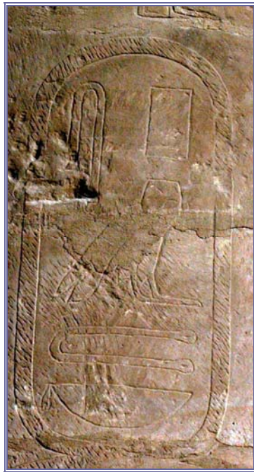
Figure 13. Nomen of Psammetichus II crudely etched in a surcharged cartouche on a column of Taharqo's kiosk in front of the second pylon of the Karnak Temple.

post-Amarna works, Sety II annexed a group of statuary made for Amenmesse in the late 19 th Dynasty (Cardon 1979; Yurco 1979b).