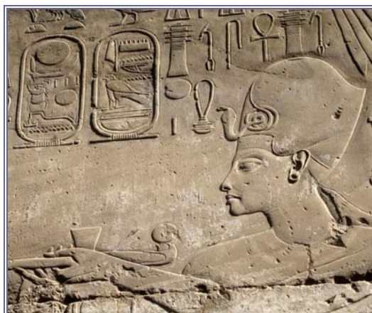
Figure 3. Relief of Tutankhamen usurped by Horemheb in the Colonnade Hall of Luxor Temple.

The techniques used to replace royal names on monuments depended on the nature of the original relief. With royal names in raised