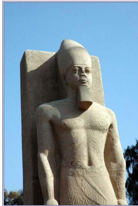
Figure 11. 12 th Dynasty colossus usurped by Ramesses II. The king's facial features have been retouched.

Usurpation of royal statues reached a peak under Ramesses II, who appropriated examples dating back as far as the Middle