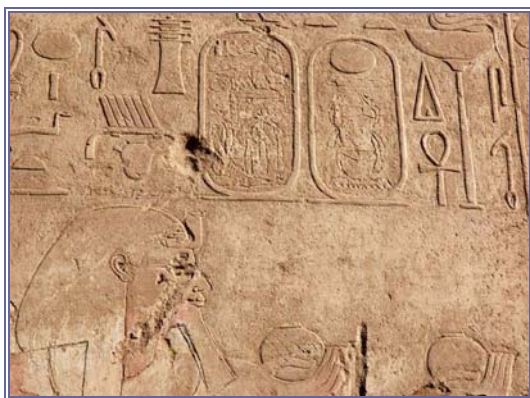
Figure 1. Relief of Hatshepsut usurped by Thutmose III in the name of his father, Thutmose II, in the suite of Hatshepsut's cult rooms south of the bark shrine of Phillip Arrhidacus at Karnak. The queen's names and image have been erased and replaced.