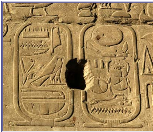
Figure 5. Another pair of Tutankhamen's cartouches usurped by Horemheb in the Colonnade Hall of Luxor Temple. Here, distinctive traces of Tutankhamen's names are visible within Horemheb's titulary.

Tutankhamen's reliefs in the Colonnade Hall of Luxor Temple (Epigraphic Survey 1994: plates passim; 1998: plates passim). If the original inscription was in sunken relief, the most common practice was to fill it in with plaster and cut the new name also in sunken relief (figs. 6 and 7). Fortunately for Egyptologists, both methods frequently left distinct traces of the primary version, making it possible to decipher the initial text. Plaster used anciently to mask usurped sunken-relief inscriptions has today usually fallen away, allowing palimpsests containing two or even three successive versions of the surcharged cartouches to be seen (fig. 8; Brand 2009: figs. 1, 2, 5, 6; Seele 1940: 8, fig. 1). Where raised-relief inscriptions have been usurped, faint traces of engraved lines or slightly raised edges often attest to the original owner's name (see figs. 5 - 7; Epigraphic Survey 1994: plates passim; 1998: plates passim; Seele 1940: 8, fig. 3).