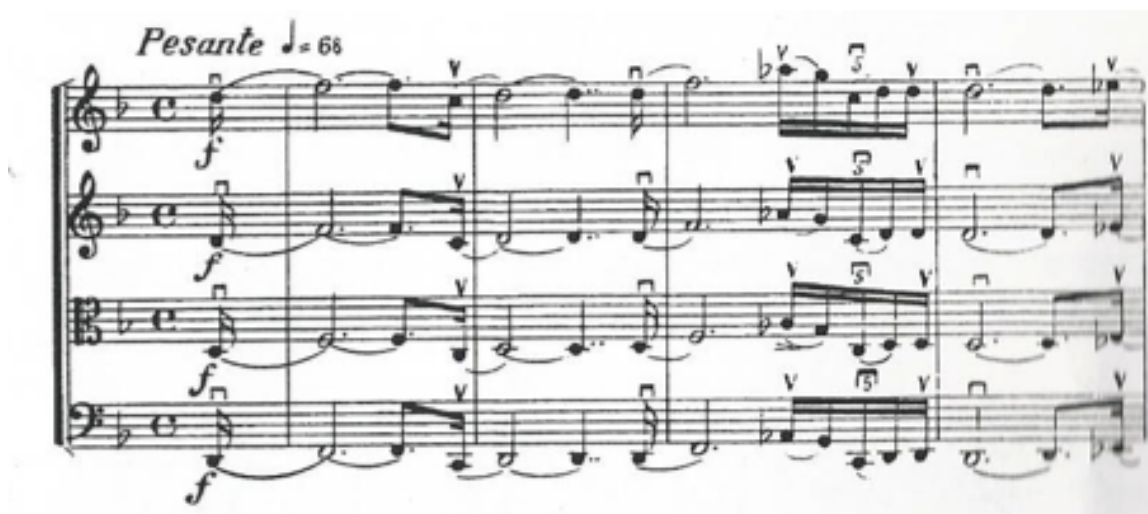
Figure 5. Zeisl, Second Quartet, mvt. I, mm. 1-4. Doblinger.