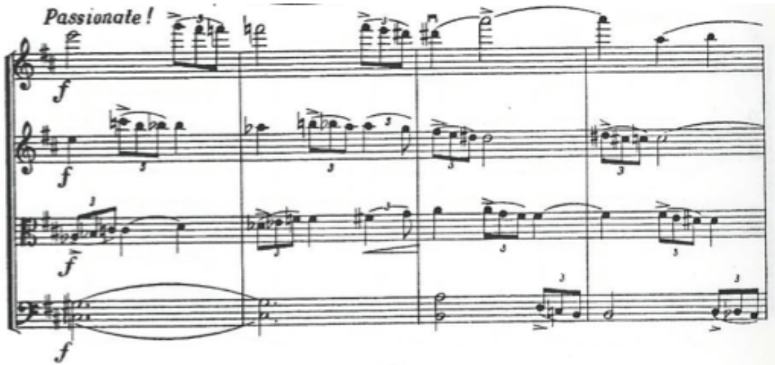
Figure 10. Zeisl, Second Quartet, mvt. II, mm. 53-56. Doblinger.