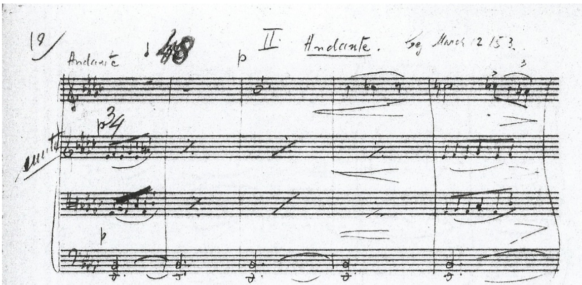
Example 4. Zeisl, Second Quartet, mvt. II, mm. 1-5. Manuscript.

Another example of differences in dynamic markings between the printed score and the printed parts is found at the beginning of the second movement (m. 1). In the manuscript Zeisl only writes three piano markings for the four parts; one that applies for the cello and the viola parts, one for the second violin part, and one for the first violin part two measures later (m. 3) (see Example 4). In the printed score Atkins omitted the dynamic level of the cello part which, once again, should match the three other voices in order to obtain the same character as the three other voices. However, he does add the piano marking in the printed cello part.