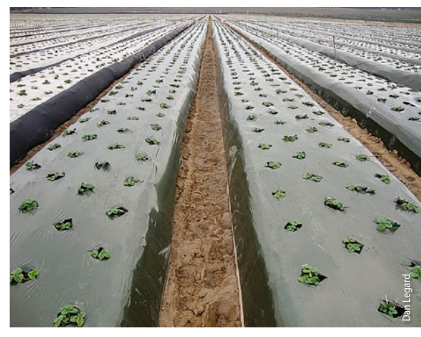
Strawberries planted in substrate at Mar Vista Berry, Santa Maria. One of the main concerns in soilless strawberry production is the maintenance of a favorable pH, EC and nutrient supply to the growing plants.