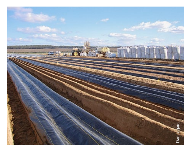
In a raised bed trough system, troughs are cut into each bed and lined with fabric that permits moisture penetration but not root penetration. The troughs are then filled with clean substrate materials. Here at Mar Vista Berry, Santa Maria, yields surpassed those from standard fumigation plots.

The primary justification for using this system is that strawberry crops can