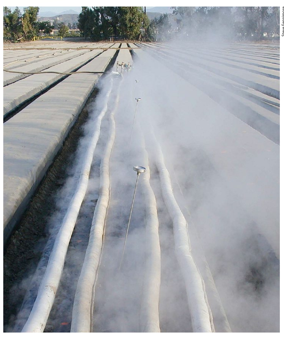
In a multi-year study of strawberry production systems, the use of nonfumigant alternatives such as heat treatment with steam resulted in fruit yields comparable to those produced using conventional fumigants. Above , steam application to strawberry beds prior to planting near Camarillo, CA.

alifornia's coastal districts, where 86% of the nation's strawberries are produced on 38,600 acres, are the most productive strawberry-growing areas in the United States (CSC 2011; NASS 2011). To achieve this level of productivity, California strawberry producers need effective soil disinfestation, productive varieties and cultural practices such as polyethylene mulch and drip irrigation (Strand 2008). Strawberries are very sensitive to soil pathogens, and growers with these highly productive systems have become dependent on preplant fumigation. Traditionally, they used methyl bromide plus chloropicrin (MB + Pic) as the basis for soil pest control. Fumigation with