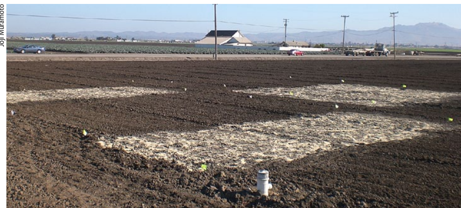
In preparation for anaerobic soil disinfestation, rice bran is applied to the planting field. This nonchemical alternative to methyl bromide was developed in Japan and the Netherlands.

Trial design. The trial was arranged in a randomized complete block design with four replicates. Anaerobic soil