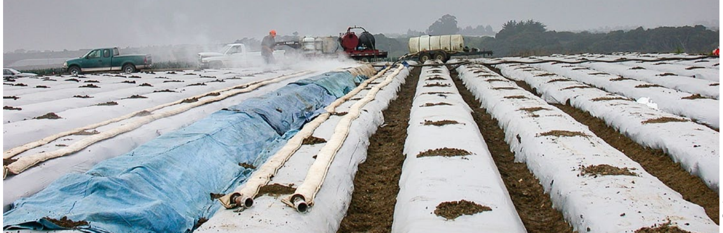
Steam is applied to strawberry beds with a stationary steamer at a commercial field near Watsonville. Raising the soil temperature to 158°F for 20 minutes produces soil pest control comparable to fumigants.

strawberry plant injury was observed in any of the treatments (data not shown).