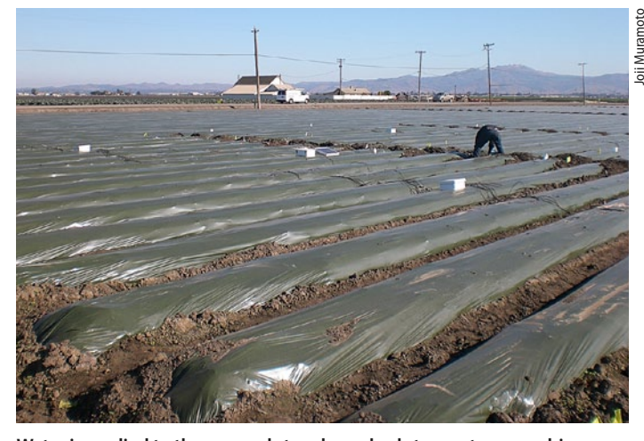
Water is applied to the covered strawberry beds to create anaerobic conditions prior to planting. Anaerobic soil disinfestation was very effective in suppressing Verticillium dahliae in soils, and it resulted in 85% to 100% of the marketable fruit yield observed with fumigated controls in coastal California strawberries.