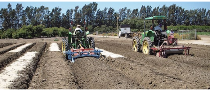
Rice bran can be incorporated before or after strawberry beds are formed. Shown are broadcasting, left, or bed top, right, application methods.