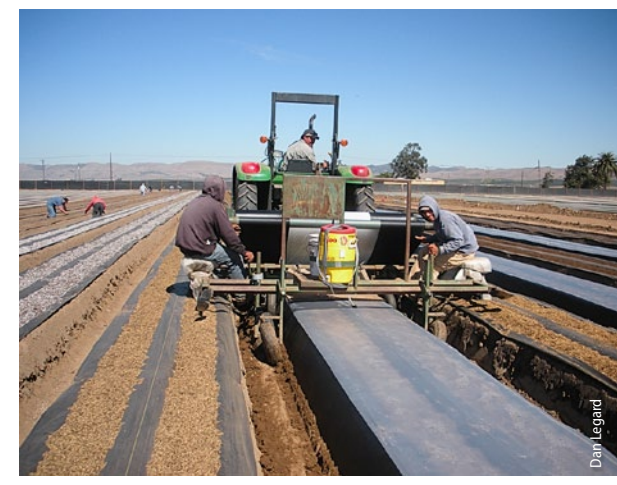
Once the troughs are filled with substrate (left), the beds are covered with film. The beds can be left in place for several crop cycles. No fumigant is used.