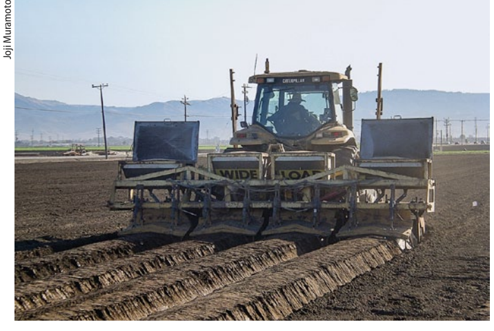
Listing of beds after incorporation of rice bran at Salinas, CA. Drip irrigation tape and then tarp will be installed so that the beds are ready to irrigate to create anaerobic conditions.