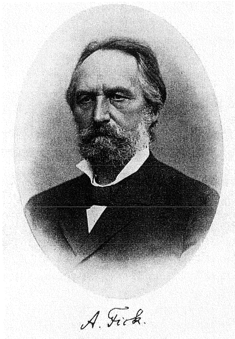
Figure 1: Adolph Fick, pioneer in the application of physics, chemistry, and mathematics to biological systems (Fick, 1903; Frontispiece)

To understand double diffusion across a membrane, Fick considered a single vertical cylindrical pore with hydrophilic walls, separating solutions of differing concentrations above and below. He cited earlier observations of Brücke, and others suggesting that the substance of the partition attracted the particles of water more than the particles of salt. Fick made a clear distinction between two fundamentally different modes of water movement; diffusion of water, and “ filtration of the liquid, by virtue of their cohesion ”, driven by external pressure differences. He assumed the