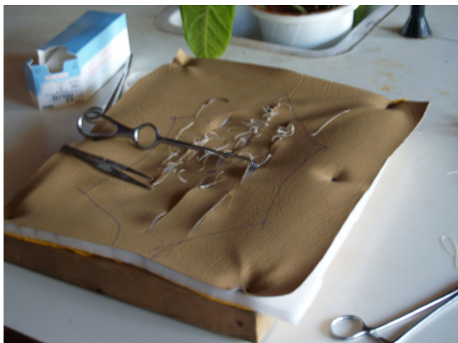
Figure 5 Picture of model used for laparotomy skills station.

appropriate placement of the vacuum on the fetal head and developed proper delivery traction with the vacuum.