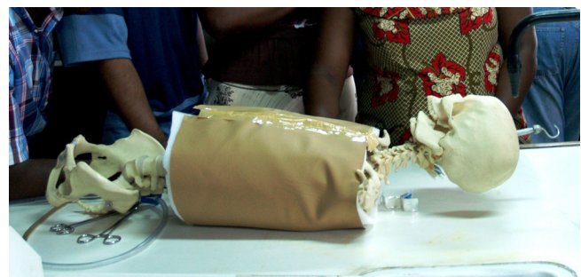
Figure 4 Picture of skeleton model for chest tube insertion skills station.

For the vacuum-assisted vaginal delivery, we used an obstetrical mannequin on which students practised