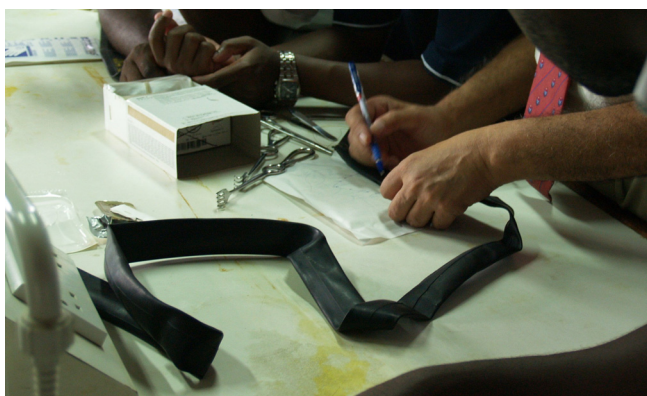
Figure 6 Picture of inner tube models for bowel anastomosis station.

Development and execution of the training required a total of 290 work-hours (Table 2). The execution of the surgical skills training required a total of 252 hours of faculty teaching time. The surgical faculty contributed an additional eight hours in curriculum development meet-