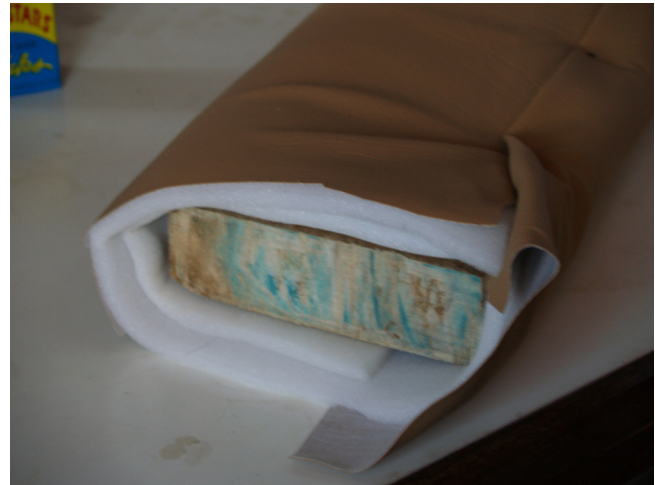
Figure 3 Picture of foam suturing boards for knot-tying and suturing skills station.

the anterior axillary line, insert the chest tube in the mannequin, secure the tube in place with suture, and close the chest tube opening with a suture upon removal of the tube.