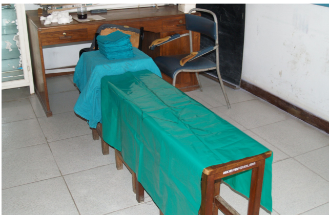
Figure 2 Picture of bench draped with polythene sheet for a patient preparation station.

The intubation station was carried out using adult intubation mannequins ("Airway Larry," Nasco Health Care) and adult laryngoscopes. The chest model used to teach chest tube insertion consisted of a teaching-skeleton rib cage draped with layers of foam and opaque vinyl that were sewn shut (Figure 4). Students were to review anatomy on a volunteer male student, isolating the fifth rib on