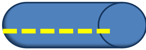
Figure 2. Preparation of the nail splint tube: The dashed yellow line depicts where the tube is cut for placement around the lateral nail plate