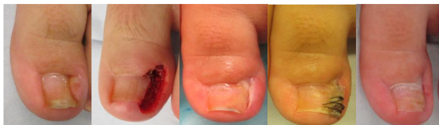
Figure 3. Operative course of bilateral affected great toes

Preoperative Postoperative 1 month 2 months 3 months