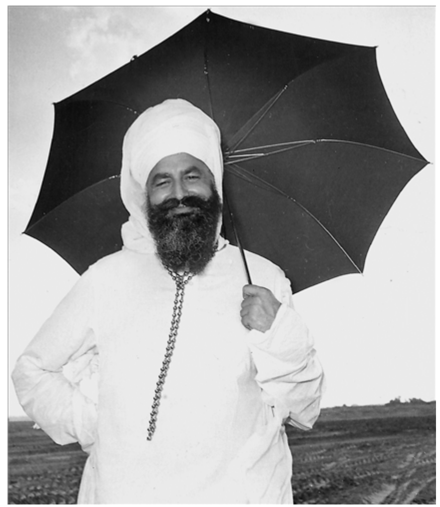
Figure 1: Maharaj Virsa Singh standing in the freshly ploughed fields at Gobind Sadan, outside of New Delhi, circa 1971.