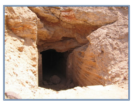
Figure 9. Tell el-Amarna Unfinished Tomb 29 possibly of Kiya.

she suffered a fall from Akhenaten's grace, she may have been a victim of the epidemic instead. Her tomb may have been located in the royal necropolis at Tell el-Amarna (fig. 9). In years 13 or 14, three of Akhenaten's six daughters—Meketaten, Neferuneferura, and Setepenra—disappeared from the record as well (Gabolde 1998: 125-131; Laboury 2010: 321, n. 663).