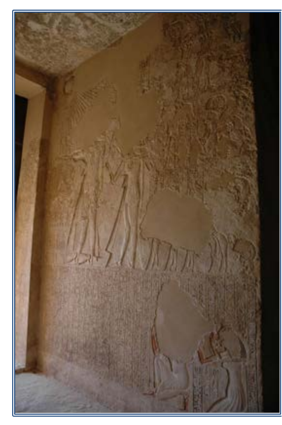
Figure 8. Tell el-Amarna Tomb 25 of Aye.

Their continued presence in the Delta area was perhaps permissible due to Memphis' long standing association with solar deities. Akhenaten erected Atenist structures at Memphis as well (for example, the Sunshade of Ra chapel, UPMAA E16230), so he may not have felt a need to secure their loyalty (Silverman et al. 2006: fig. 81).