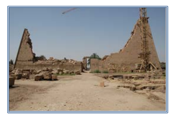
Figure 3. The ninth pylon of Karnak.

foundations for the Great Hypostyle Hall (fig. 3), proving that Prisse d'Avennes was correct.