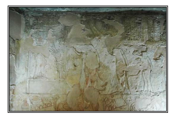
Figure 10. Akhenaten's tomb. Detail of the royal family mourning Meketra. Tell el-Amarna.