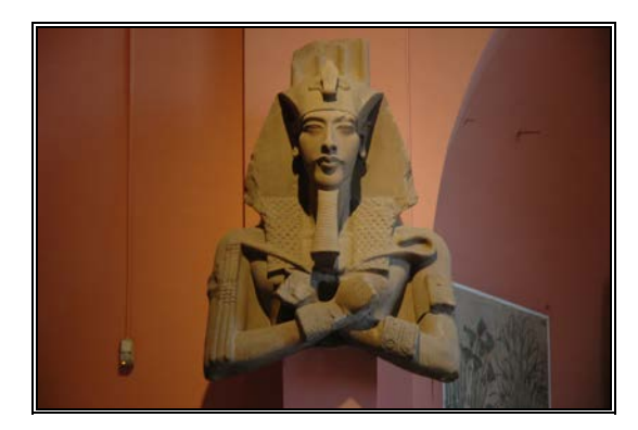
Figure 4. Colossal statue of Amenhotep IV/Akhenaten from Karnak. Cairo Museum JE 49528.

The first examples of Akhenaten's Karnak statuary were published in 1903, found during Georges Legrain's excavations of the Karnak Cachette in the court of the seventh pylon. Also, in the Annales du Service des Antiquités de l'Égypte, Legrain (1902) published two of Akhenaten's stelae from the Gebel el-Silsila sandstone quarry, Akhenaten's primary source for building material while resident at Thebes. During excavations to the east of the Karnak precinct in 1925, Pillet and Chevrier, accompanied later by Legrain, uncovered the first in situ evidence of Akhenaten's Karnak Temple: the famous Karnak colossi of Akhenaten (fig. 4) and the foundations for Akhenaten's Sed Festival court (Davies 1923; Laboury 2010: 161; Manniche 2010).