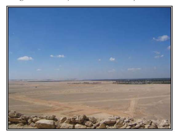
Figure 6. View of Tell el-Amarna looking south from the North Tombs.

a natural wadi, similar to the Valley of the Kings in Thebes (see Tell el-Amarna).