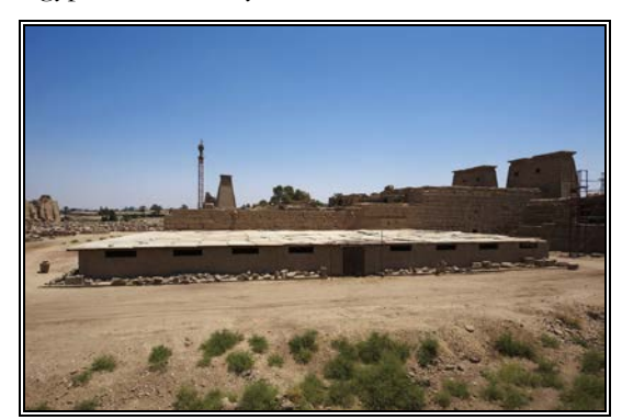
Figure 5. The Pennsylvania Magazine in Karnak.

Research on Akhenaten's building program at Karnak is ongoing (Vergnieux 1999). Several thousand of Akhenaten's talatat are stored within the Karnak Temple precinct, some in a magazine near the Khonsu Temple (fig. 5). Many more are still inside the structures of Karnak Temple itself and spread throughout many storage areas in the Luxor region (Sa'ad 1970). Talatat from both Amarna and Thebes have also been found in other areas around Egypt, such as Abydos.