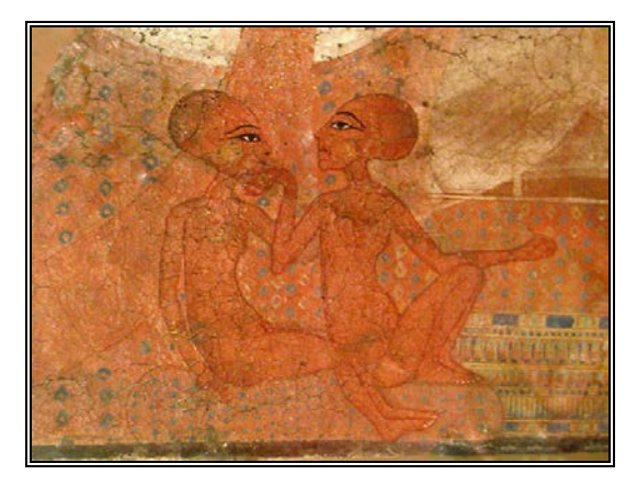
Figure 1. Painting of two princesses from the King's House, discovered by Petrie.

Flinders Petrie excavated extensively at Tell el-Amarna starting in the early 1890s. His excavations included the Great Aten Temple, the royal archives, and the King's House (fig. 1). Petrie's work generated even wider interest about Akhenaten and his religion.