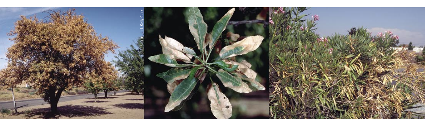
Almond leaf scorch, left and center , is a relatively slow-spreading disease that may take many years to establish in cropping systems. Right , oleander leaf scorch is causing millions of dollars of damage to California's freeway median strips and other ornamental plantings.

a single age showed that progeny production was greatest from GWSS eggs 3, 4 and 2 days old for G. ashmeadi, G. triguttatus and G. fasciatus, respectively. Furthermore, each parasitoid species was able to utilize a range of egg ages around their most preferred age: 1 to 4, 3 to 6, and 1 to 3 days old for G. ashmeadi, G. triguttatus and G. fasciatus, respectively. GWSS eggs that were parasitized at 8 to 10 days of age produced few parasitoid progeny and those that did emerge had been oviposited into sterile or dead host eggs lacking a GWSS embryo (Irvin and Hoddle 2005a). This suggests that the low production of parasitoid progeny in older GWSS eggs was most likely due to the advanced stage of development of the GWSS embryos.