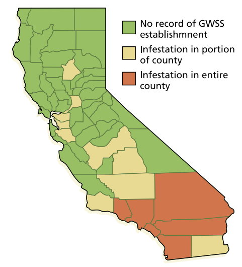
Fig. 1. GWSS establishment in California counties and infested parts of counties.

Two of these species ( G. morrilli and G. ashmeadi ) are already established in California. G. morrilli is native to California and G. ashmeadi is self-introduced from the southeastern United States (with no direct assis-