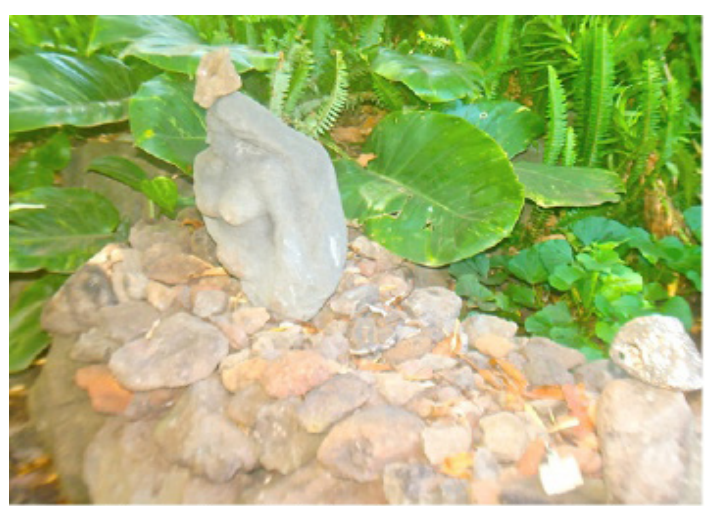
Figure 6. Emplaced person in Te Pou Huke's garden.

Whereas varua and various other-than-human persons are essentially fluid, therefore, certain places and paths limit the trajectory of this fluidity. William Hanks makes a similar point in regard to Maya spirits. He argues that "they may move habitually...yet remain anchored" to their places.<sup>79</sup> One of these paths in Rapa Nui is Ara Roa Ra Kei . Before the 1860s this was the only road used to safely cross the island without transgressing the territory of other clans.<sup>80</sup> The following is a photograph of a typical emplaced person.