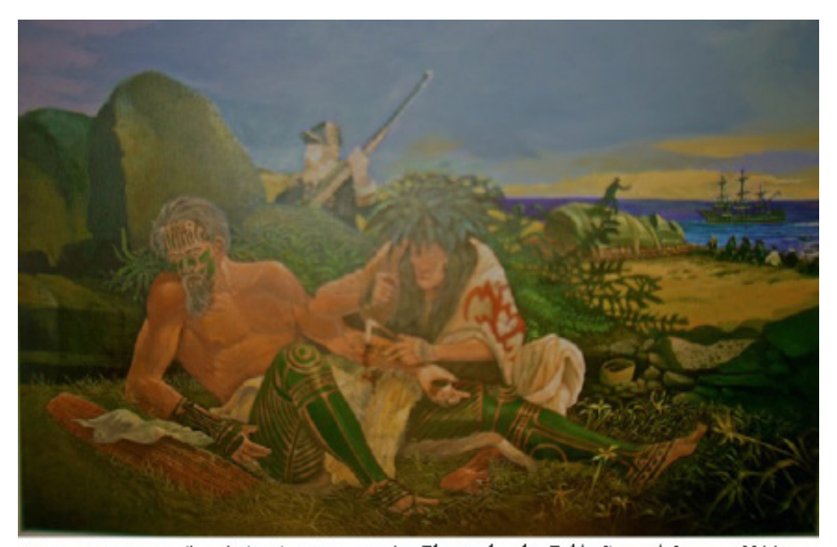
Figure 13. An acrylic painting by Te Pou Huke. Photo taken by Pablo Seward, January 2014.

Other than wood carving, Te Pou is able to use his art practice for activist goals through exhibitions to local people. In collaboration with a local hotel, at the time of my fieldwork Te Pou was planning a controversial exhibition of his recent paintings. I illustrate the controversial nature of this exhibition by an analysis of the following painting.