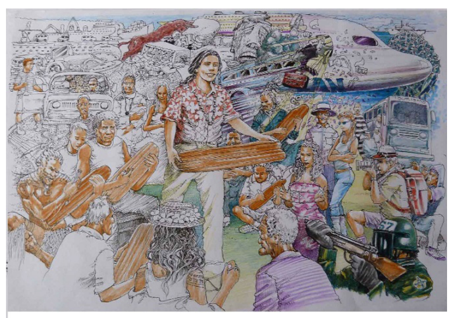
Figure 1. Painting by artist Te Pou Huke. Reproduced with permission from the author.

— Pablo Neruda, "La rosa separada" (1973), my emphasis