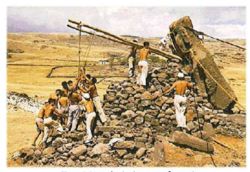
Figure 4. Image showing the process of restoration.