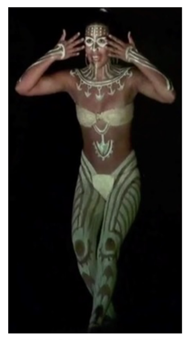
Figure 8. Takona performance in Rapa Nui, February 2013.