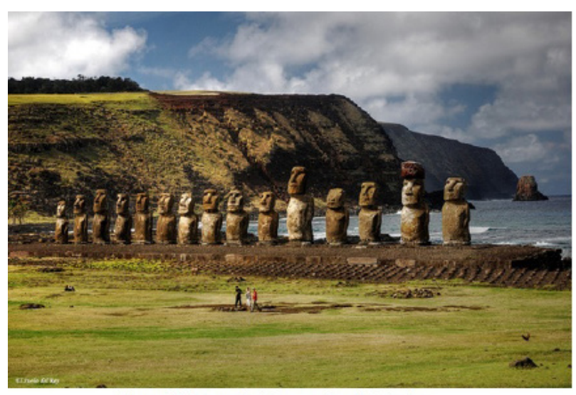
Figure 5. Image showing a restored site today.

Other than technically an inaccurate term for what actually took place, "restoration" forgets the fact that in the 1860s, before the Rapanui were first decimated and dispossessed of their land, Rapa Nui may well have been an incipient new lifeworld. The havoc Europeans witnessed, including the toppled moai , may have been the ruins of a past lifeworld amid latent efforts to create a new lifeworld. Both Rodrigo Paoa<sup>31</sup> and Te Pou Huke,<sup>32</sup> considered by the contemporary Rapanui community cultural leaders, talked of the moai as one stage in their culture's history that had met its natural denouement; their culture, they contend, was in the full process of rebirth around the new foundational symbol of the manutara [birdman] when Westerns decimated their population. By "restoring" the island back to its moai stage, archaeologists and other outsiders assumed that Rapanui culture was stagnant.