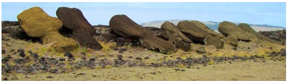
Figure 3. Image showing how the island was prior to restoration.

The official story is that starting the 1950s the landscape was simply restored and the Rapanui simply underwent a radical, if positive change of lifestyle. I contend that "restoration," however, is not the correct term for what William Mulloy and other archaeologists accomplished from the 1960s to the 1990s. As Ingold and Hallam argue, "copying or imitation... is not the simple, mechanical process of replication that it is often taken to be." Some of the sites were restored such that they intentionally appear like ruins. The restoration process usually involved re-assembling a muddled cultural landscape, rather than simply restoring in situ landscape features. Outsiders had ransacked many of the sites multiple times, so archaeologists had to fill the gaps with material from other sites and even with material that was in the personal possession of Rapanui people. For instance, in the case of Ahu Toŋariki, a tidal wave had displaced the site, which lay cluttered at the time of restoration. Moreover, in the case of Ahu Tahai, the smallest of the moai did not ancestrally belong to that platform, and the ramps in front of the moai were completely reconstructed by Mulloy.