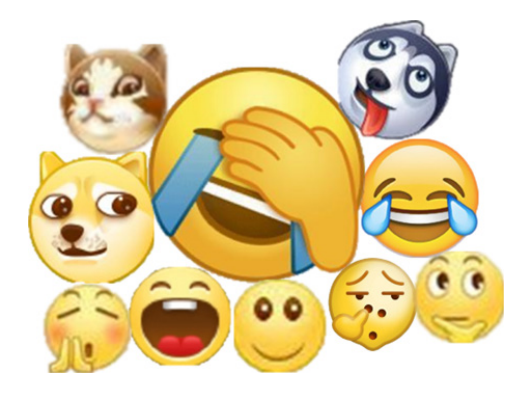
Top 10 Emoticons Used (Sizes Based on Frequency)

The most popular emoticon was named "yǔn bēi (允慧)," short for "please allow me to make a sad face." It depicts a crying face with a bitter laugh and a hand covering its eyes, expressing an optionless sorrow. One user added this emoticon to the end of their comment "My facial mask is not even ten yuan each," expressing