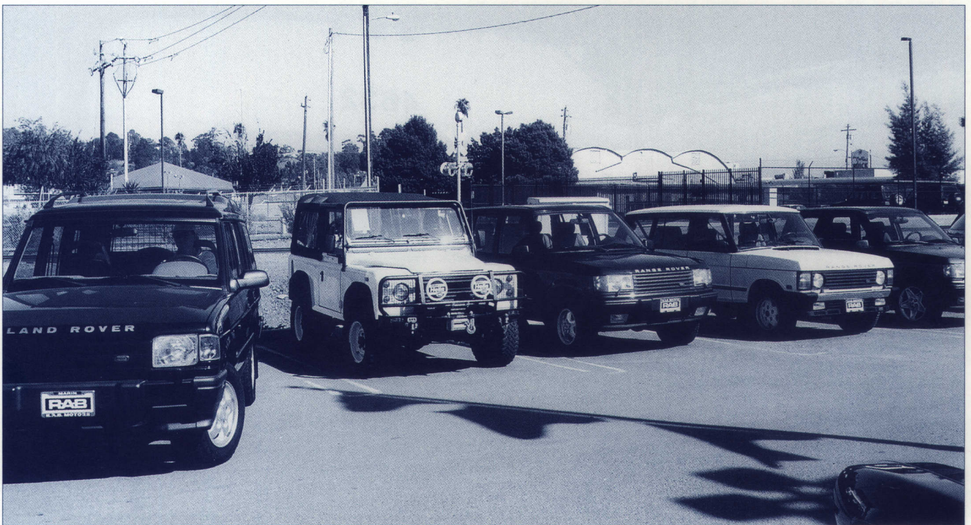
Invasion of the SUVs.

Concerns about energy use no longer reflect fears of oil depletion or energy dependence (though that may change in the coming decade). Instead, we're concerned about climate change and the greenhouse gases that cause it. About 25 percent of all human-generated greenhouse gases come from transportation, over half of that from light-duty vehicles. Unlike air pollutants, greenhouse gases from vehicles cannot be reduced easily or inexpensively with add-on control devices. The relationship between gasoline consumption and CO 2 emissions is fixed. CO 2 emissions may be reduced by improving fuel