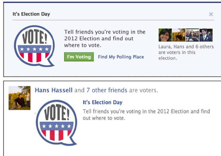
Fig 1. Example messages shown to adult Facebook users in the United States on election day 2012. The top message was shown to users in the “banner” condition at the top of their News Feed. The bottom message was shown to users in the “feed” condition within their news feed if at least one of their friends in the “banner” condition had clicked on the “I’m Voting/I’m a Voter” button.

https://doi.org/10.1371/journal.pone.0173851.g001