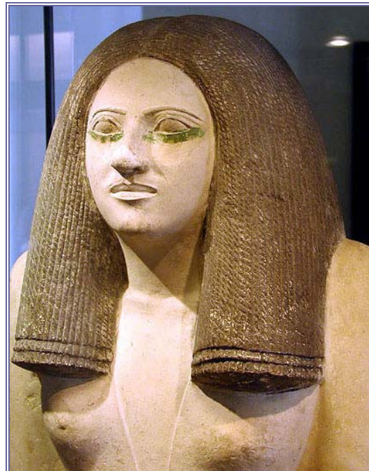
Figure 6. Limestone tomb statue of Sepa, Dynasty 3, Louvre A36. The statue has actual malachite around the eyes. The application of pigments on sculpture was not merely cosmetic: it indicated the elevated status of the person depicted, and was part of “bringing to life” a statue or image.

The importance of grooming and adorning the body is reflected in the number of cosmetic preparations and utensils buried with the dead, along with jewelry and artifacts worn on the body. This pattern of grave goods is observed already in prehistoric times, when combs, pins, tags, beads, and cosmetic vessels dominate burial assemblages (Wengrow 2006: 69 - 71). Bodily associations also permeate the realm of objects and images used in offering rituals. Model phalli and vulvae are attested as votive offerings, as are figurines of naked women and nursing women (Pinch 1993: 197 - 245; see also Pinch and Waraksa 2009; Waraksa 2008, 2009; Pinch 1983). Censers were made in the form of a human hand (fig. 7) and offering tables could have pouring spouts in the shape of the glans penis (fig. 8; Meskell 2002: 151). The action of pouring an offering ( stj ; water and water-related determinatives) is homologous with the word used for both ejaculation and impregnation ( stj ; phallus determinative),