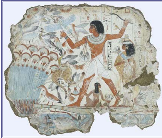
Figure 2. Fragment of painted wall from tomb of Nebamun, Thebes, Dynasty 18, British Museum EA 37977. Nebamun, his wife, and their daughter (seated on floor of boat) exemplify elite ideals of physical beauty, with strong, sensual bodies, fine clothing, and carefully dressed hair.

Sauneron 2000: 37 - 38). There is no clear evidence for female circumcision (excision) during the Pharaonic Period, though there may be some indications for the practice, in particular from the Ptolemaic and Roman Periods (Cohen 1997: 563; Huebner 2009; contra Janssen, J.J. and Janssen 1990: 90). Male circumcision was one of a number of practices related to priestly service, all of which were concerned with purity (see Grunert 2002; Quack 1997; Fischer-Elfert 2005a). Other requirements included washing, cleaning the mouth, shaving body hair, abstaining from sexual activity, and adhering to dietary restrictions (Gee 1998; Roth 1991; Sauneron 2000: 36 - 40).