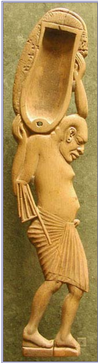
Figure 4. Wooden cosmetic spoon (lid missing), Dynasty 18, Louvre N 1738. The spoon is carved to represent a male servant, struggling with the weight of the “jar” that forms the bowl of the spoon. The servant presents a non-elite body type, with bald head, heavy facial features, and a pot belly.

and dancers may bear tattoos (Fletcher 2005) and are almost nude, with distinctive hairstyles that set them apart from elite women (Robins 1999). Their bodies may likewise adopt more informal postures and gestures, sometimes incorporating rear or frontal views (Müller