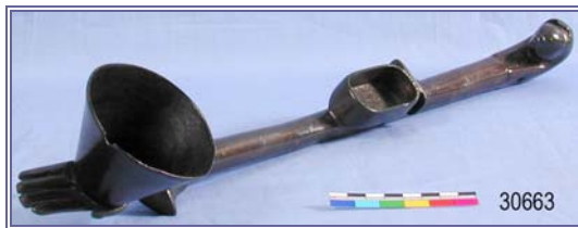
Figure 7. Bronze censer, Ptolemaic Period, Petrie Museum UC30663. The censer has a human hand at one end, holding the bowl for burning incense, and a falcon head at the other end; a cartouche-shaped box in the middle held pellets of incense.