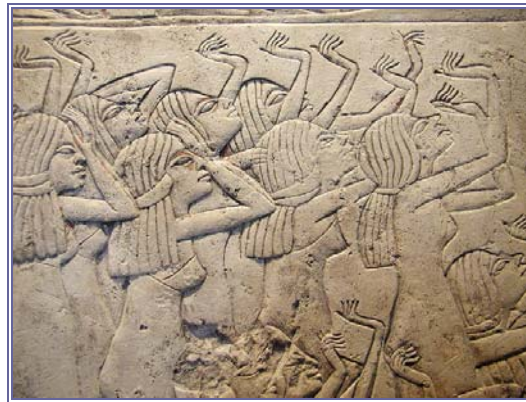
Figure 5. Limestone relief of mourning women, Saqqara, Dynasty 19, Louvre. The women’s loose hair and dresses, and flailing arms and hands, fit the trope of female mourners lamenting the dead.

and dancers may bear tattoos (Fletcher 2005) and are almost nude, with distinctive hairstyles that set them apart from elite women (Robins 1999). Their bodies may likewise adopt more informal postures and gestures, sometimes incorporating rear or frontal views (Müller