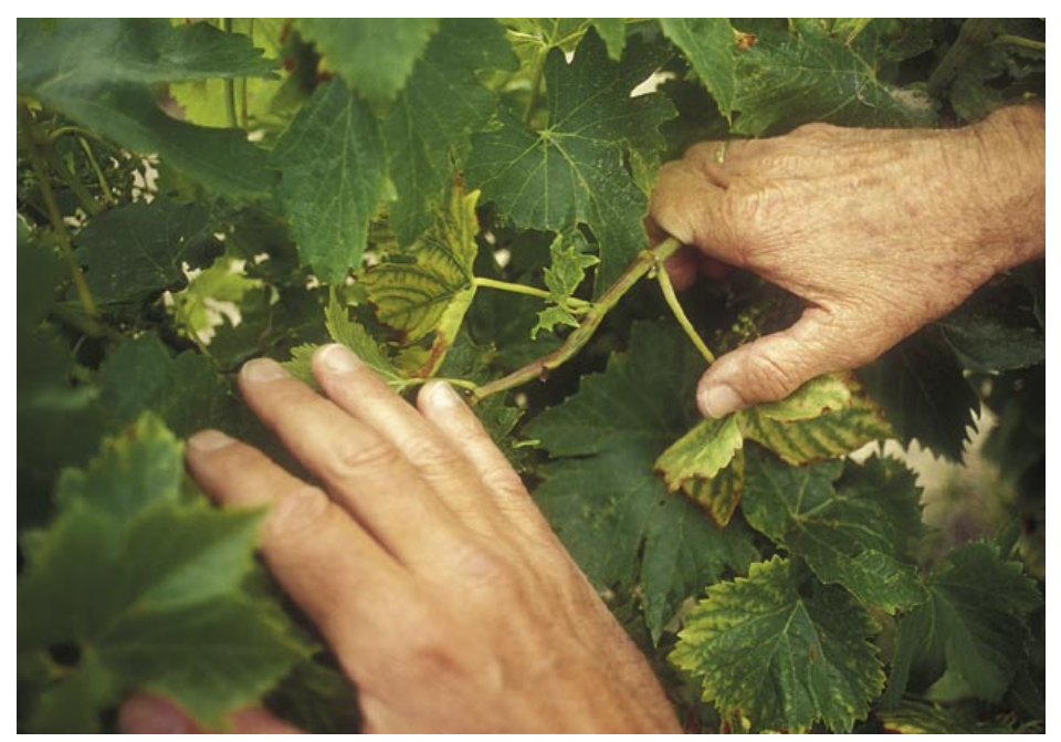
Boron-deficient vines have, facing page, bottom, clusters that set numerous shot berries, small berries with a distinctive pumpkin shape; or, facing page, top, calyptras that stick on young, developing berries. Above, shoots have shortened and swollen internodes, and shoot tips sometimes die.

The goal of boron fertilization of grapevines is to keep tissue levels within a narrow range, since both deficiency and toxicity can have serious negative effects on vine growth and production.